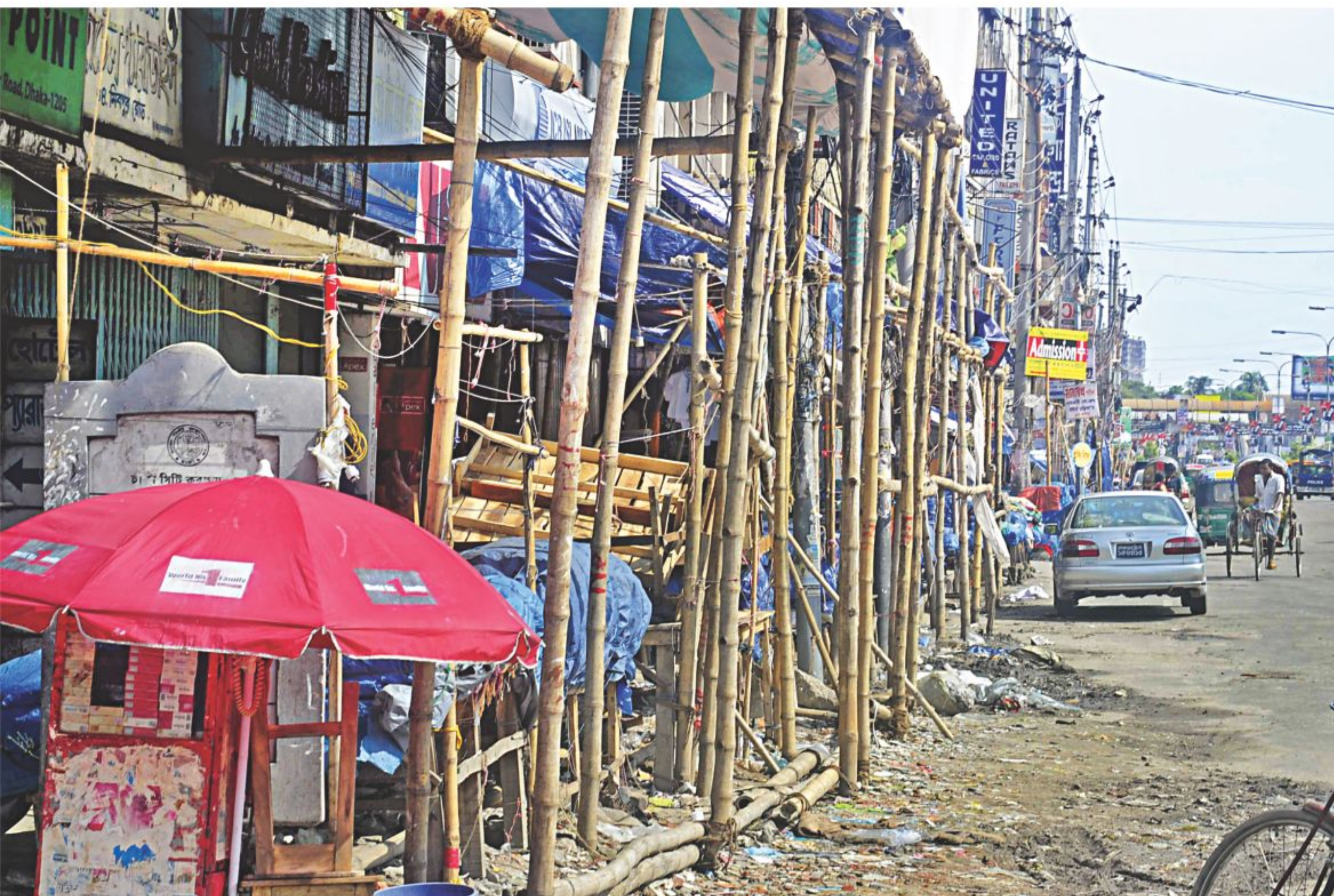
Scaffoldings of makeshift shops built on the pavement across Dhaka College before the Eid are still there putting pedestrians in difficulty. Most pavements in the area were illegally occupied by hawkers before the Eid.

PLEASE CAST YOUR VOTE AT www.thedailystar.net YOU MAY ALSO VOTE AT facebook.com/dailystarnews