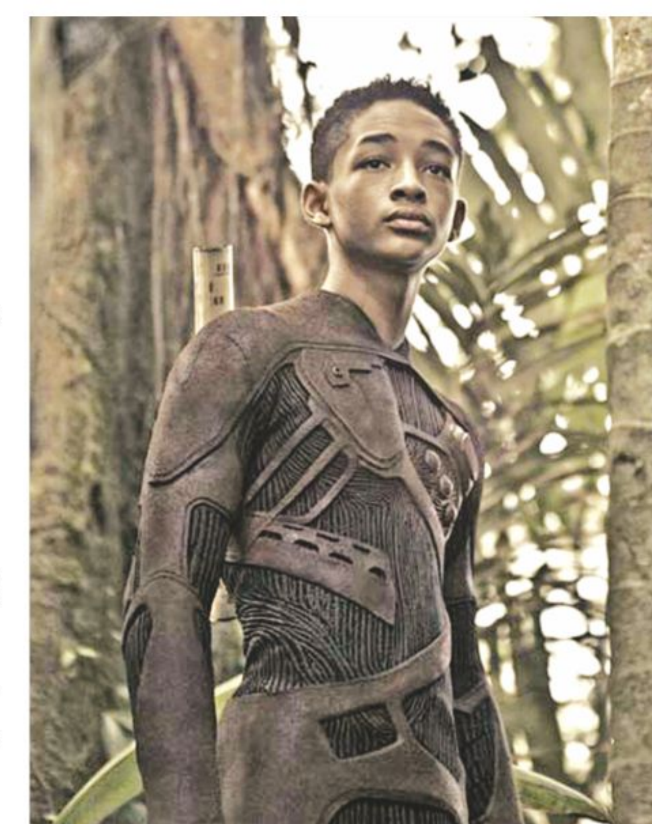
Jaden Smith in "After Earth".