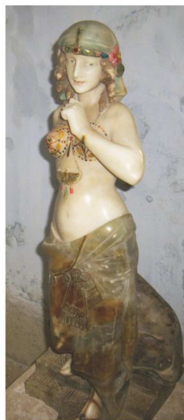
An uncared for artefact at the museum.

Priceless manuscripts are kept in iron shelves with no scientific preservation system. Handwritings on palm leaves take the visitors to the past heritage of the country. How-