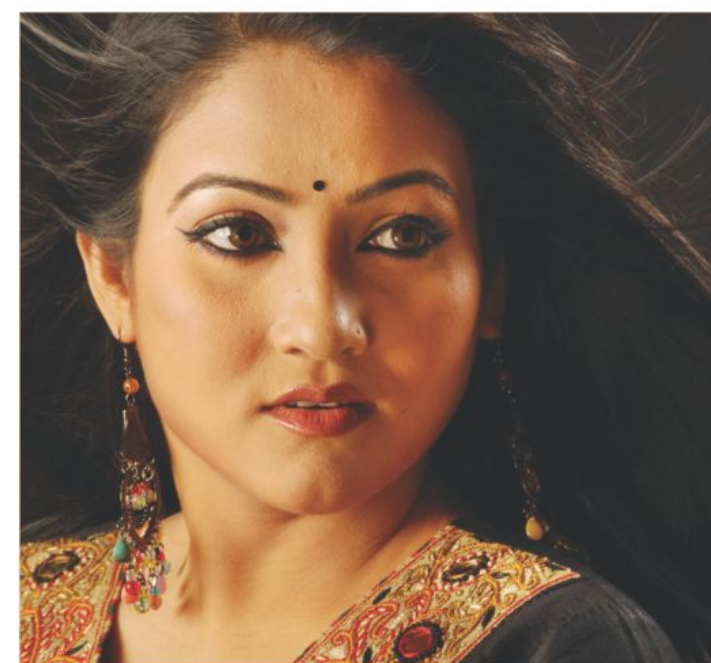
"Hawa Mithhai", also recently finished airing.