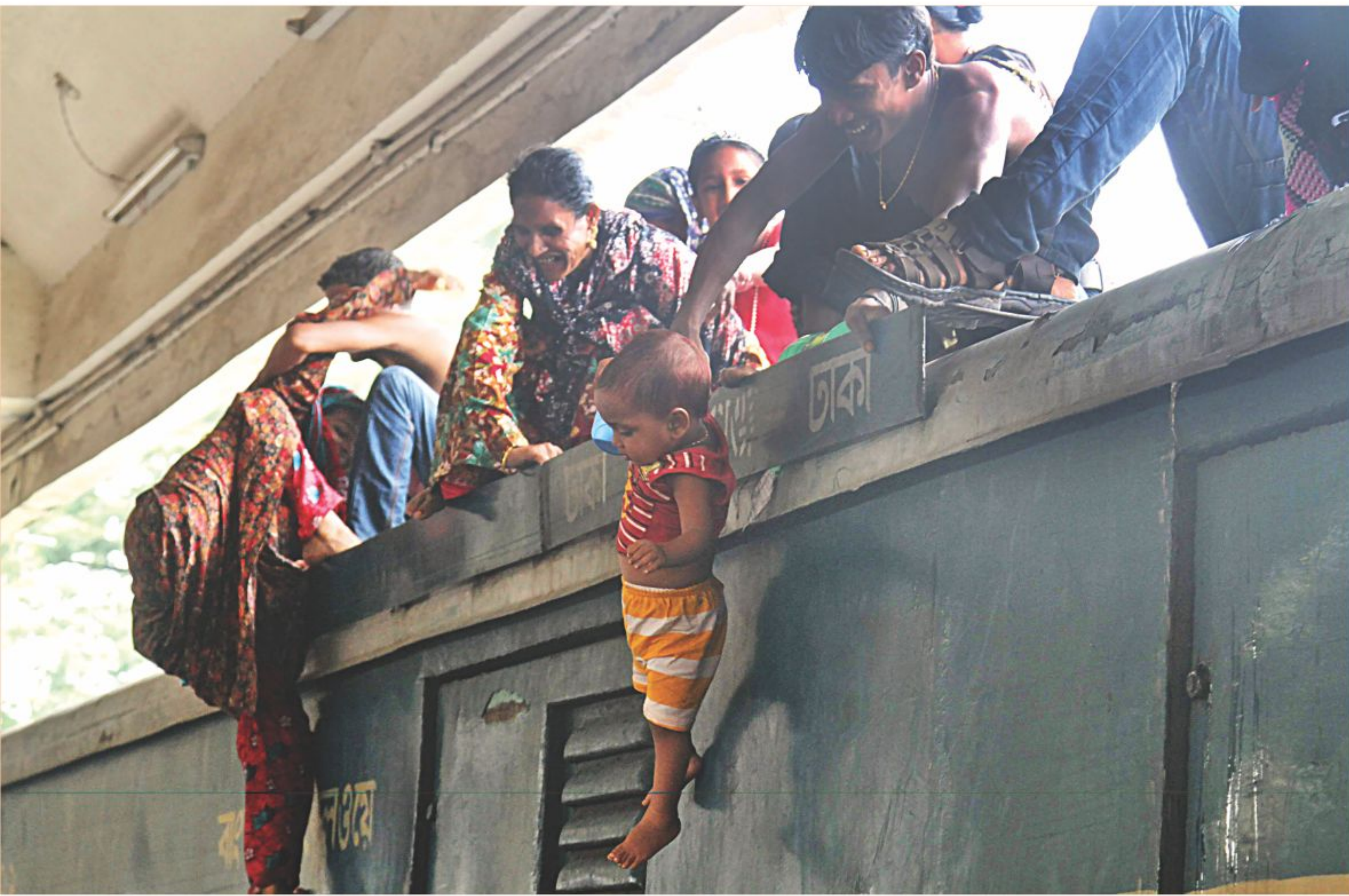
Unable to find room inside the train, these people returning to the capital after Eid holidays travelled on the roof, risking their lives and the life of the child. The photo was taken at Kamalapur Railway Station yesterday while they were disembarking from the train.