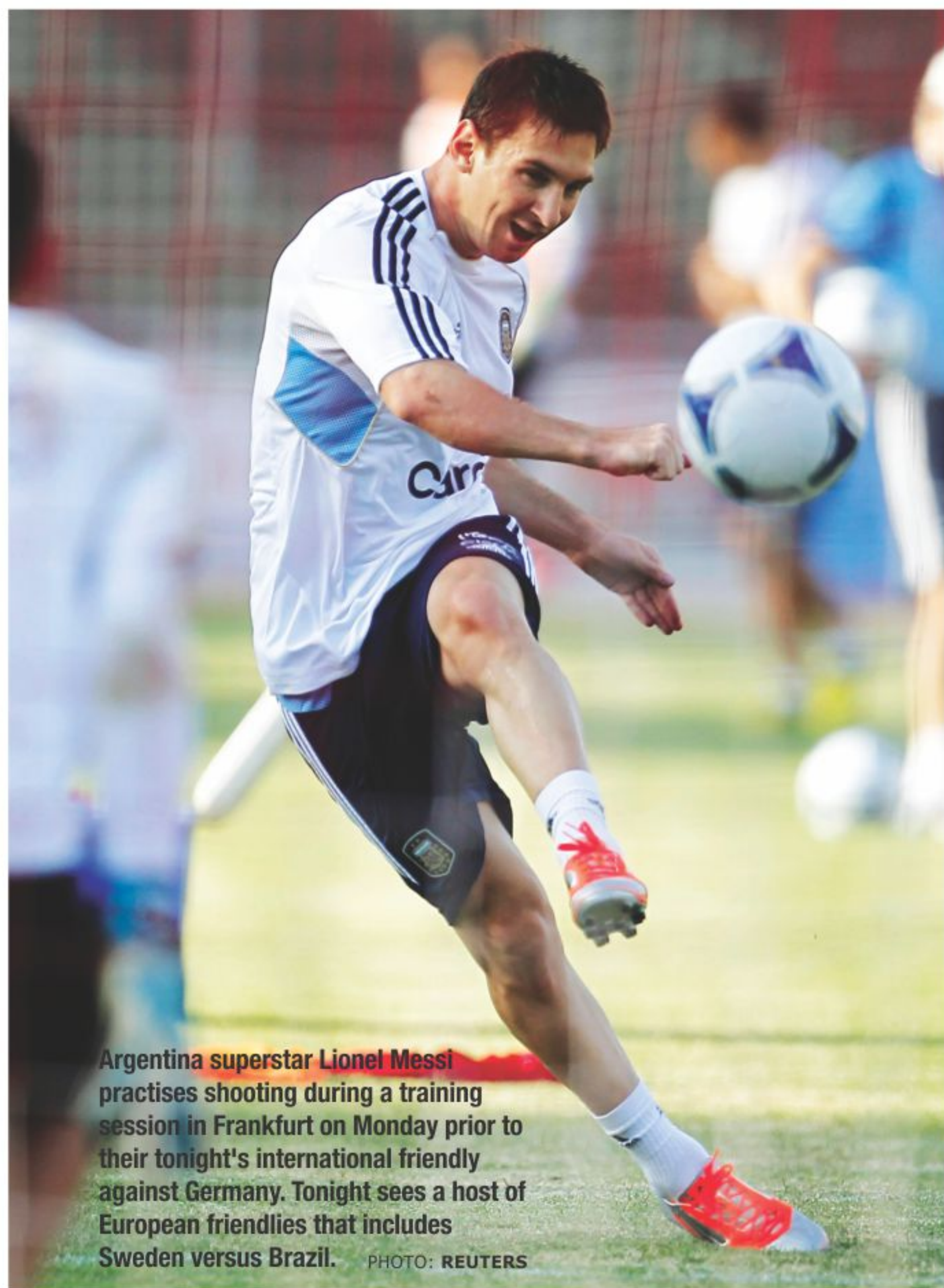
Argentina superstar Lionel Messi practises shooting during a training session in Frankfurt on Monday prior to their tonight's international friendly against Germany. Tonight sees a host of European friendlies that includes Sweden versus Brazil.

But Barcelona finished second behind Real Madrid who set records for most La Liga wins in a season with 32, most goals scored (121) and best goal difference (plus-89) en route to a first league title in four years.