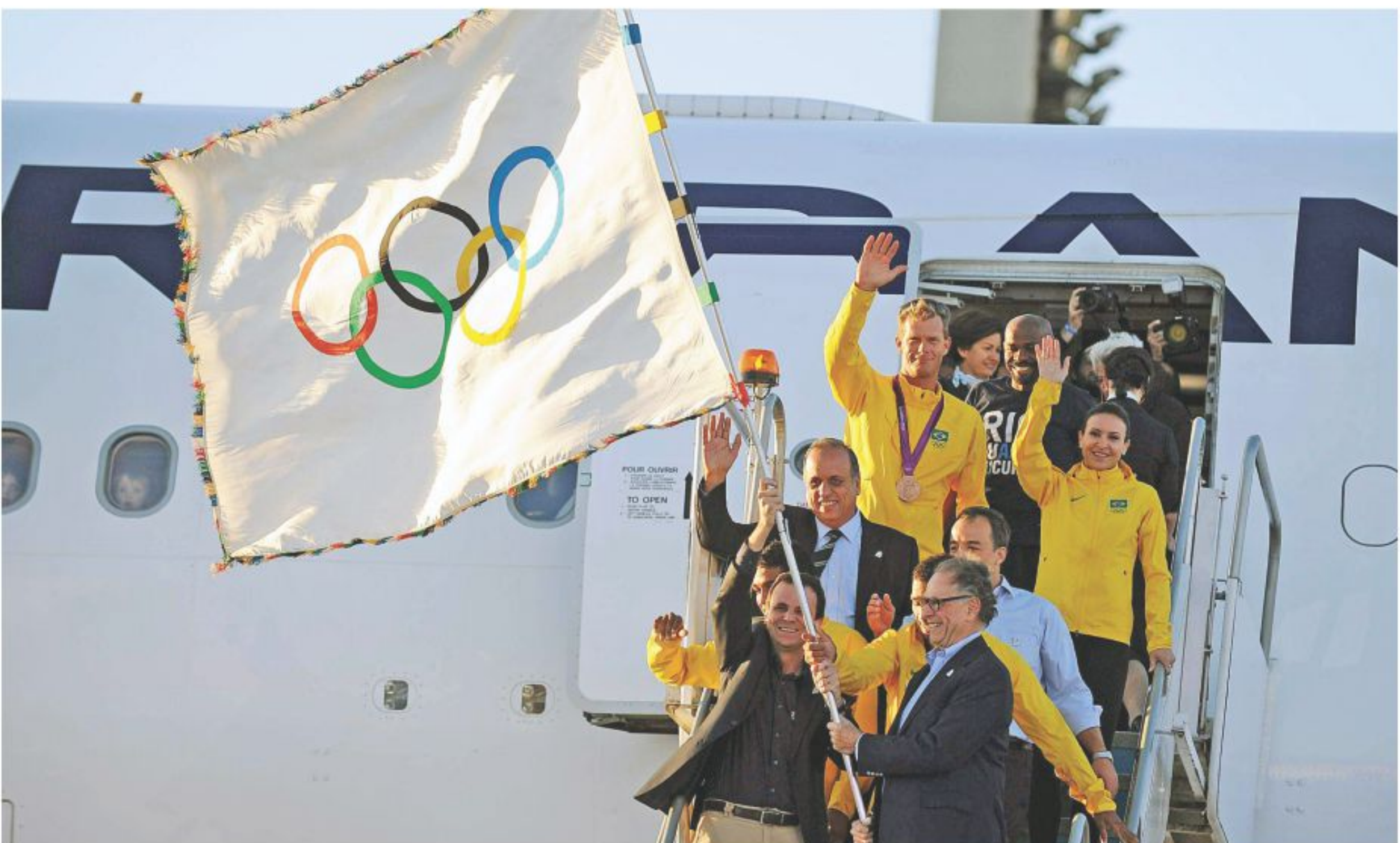
Rio de Janeiro mayor Eduardo Paes (L), president of the Brazilian Olympic Committee Carlos Arthur Nuzman (C), and Brazilian athletes wave the Olympic flag upon arrival from the London 2012 Olympics at the Tom Jobim international airport in Rio de Janeiro on Monday. Rio de Janeiro will host the 2016 Olympic Games.

The NBA stars who squeezed past Spain on Sunday carried outsized reputations into London. But, unlike during the fiasco in Athens eight years ago, they showed they were patriotic