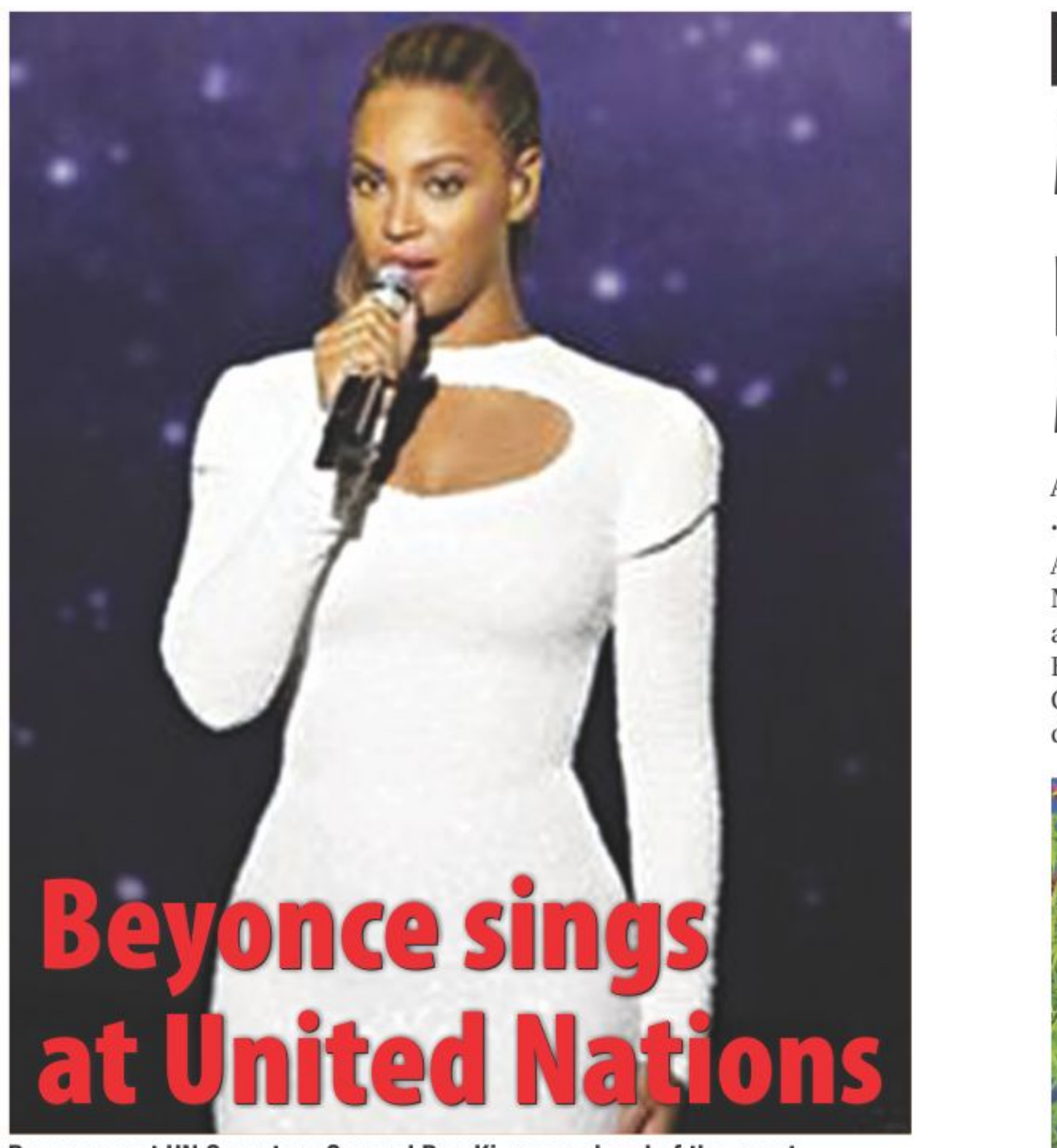
Beyonce met UN Secretary General Ban Ki-moon ahead of the event. Beyonce has performed at the United Nations in New York to mark World Humanitarian Day.

friends with him or her. What tires you the most? When a mediocre fellow artiste tries to woo the media just to get exposure, it angers me. One should never lose self respect. Are you a romantic or idealistic person? It depends on the time and situation. But I can assure you I am not always very realistic. Dreams ahead... Every dancer has a dream to make a contribution to the cultural world and for this he or she needs an institution. I am very fortunate that I have had the opportunity to establish Nrityanchal where we train 700 students. If I couldn't dance anymore, I wouldn't have any regrets because I would still have the opportunity to train budding dance talents. We are also in the process of promoting our neglected folk dance and making our folk culture attain global standards. Tell us how you plan to celebrate Eid. It's been a tradition to spend this festive day with my parents. Now that my mother stays with me, all my brothers and sisters get together at our house for the day. Though I get very little time to myself, I love to buy gifts for my near and dear ones. Do you share the day with the underprivileged? Before my father passed away, his last wish was to be buried in our village in Karimganj, Kishoreganj. This was to ensure that we would remain close to our roots. We have set up a school for the underprivileged in our village where women attend literacy classes. The year round we share different occasions with them.