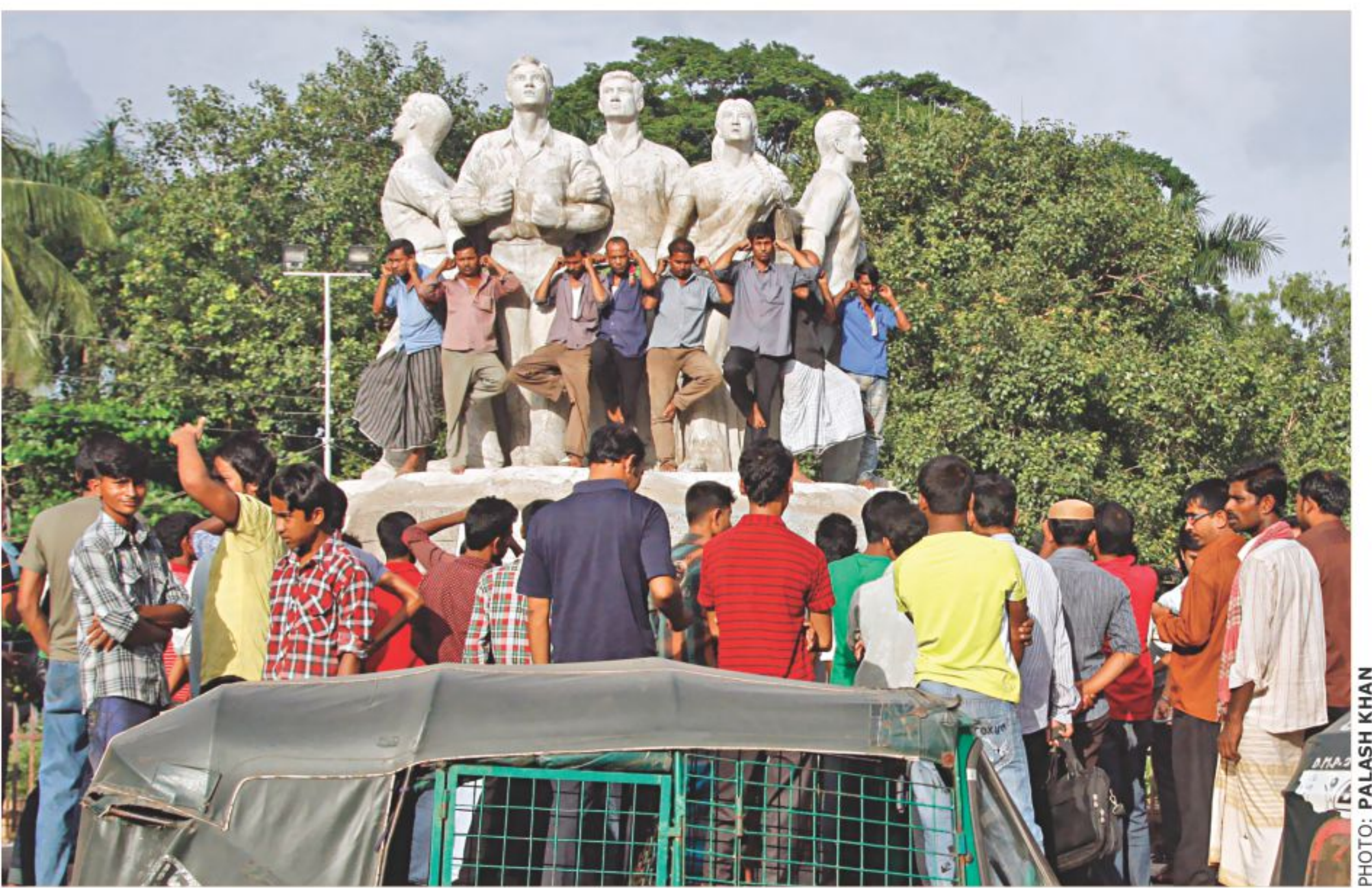
Thirteen auto-rickshaw and taxi drivers are made to stand on one leg holding their ears at the plinth of the Santrash Birodhi Raju sculpture on Dhaka University campus yesterday. Fed up with drivers not willing to go wherever the passengers want and their refusal to use the meter, a few university students gave them the punishment.

The government high-ups have also expressed their concern about the problem and asked the authorities concerned to be on a state of alert. Yesterday, the Armed Police Battalion (APBn) at Shahjalal International Airport arrested seven Rohingyas with Bangladeshi passports, all trying to depart through the airport. One of them managed a Machine-Readable Passport (MRP), while others got forged ones -- passport books recently stolen from a Dhaka passport office, police say. SEE PAGE 6 COL 1