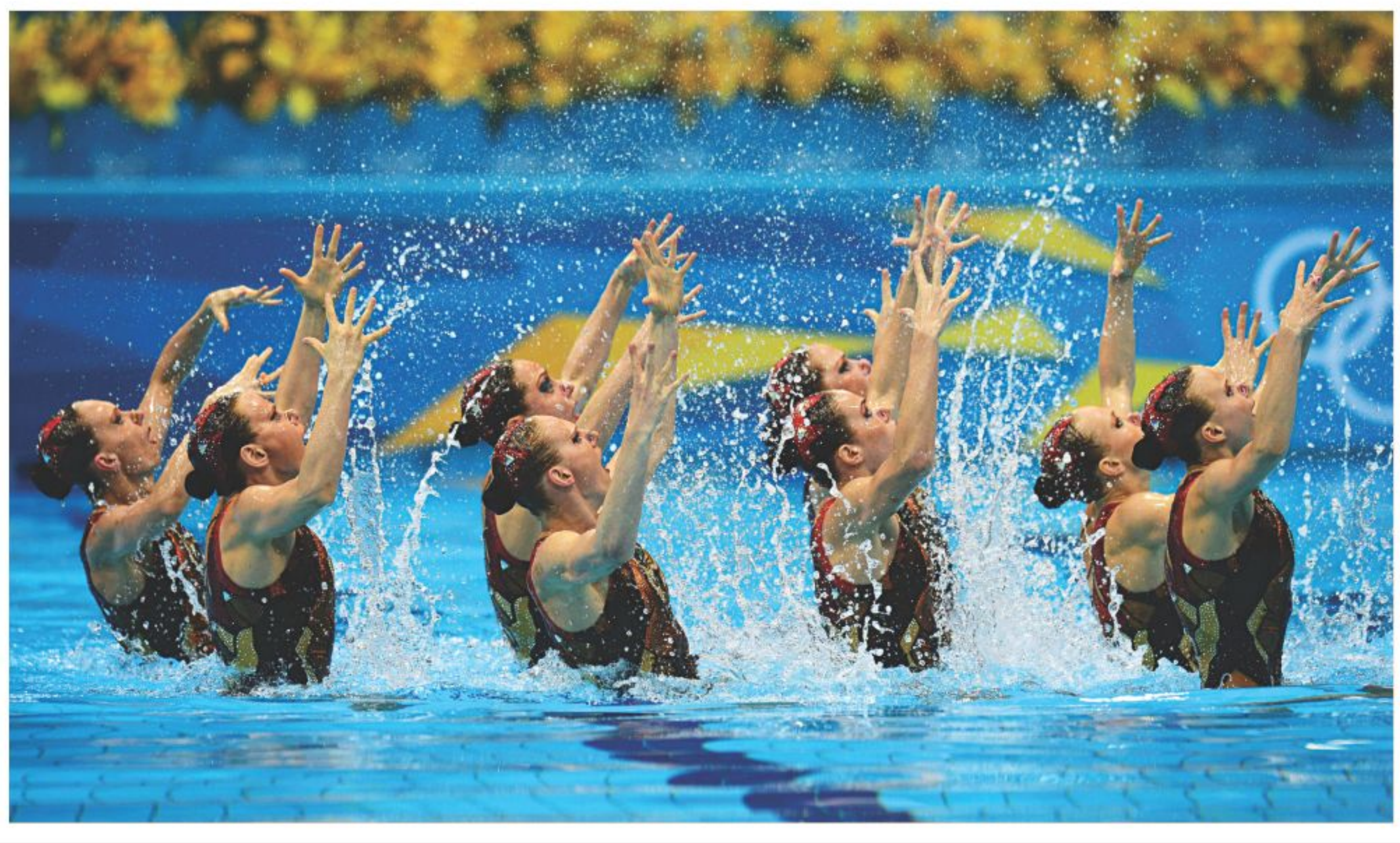
Russia's synchronised swimming team perform during the free routine final on way to retaining their Olympic gold at London Aquatics Centre on Friday.

at a meeting last month instructed the officials and employees to donate the sums fixed for them. The Padma bridge project was dealt a body blow when the World Bank on June 29 cancelled its $1.2 billion fund for the bridge, citing a "corruption conspiracy". In the wake of the loan cancellation, Prime Minister Sheikh Hasina declared in parliament that the government would construct the bridge with its own resources. SEE PAGE 19 COL 5