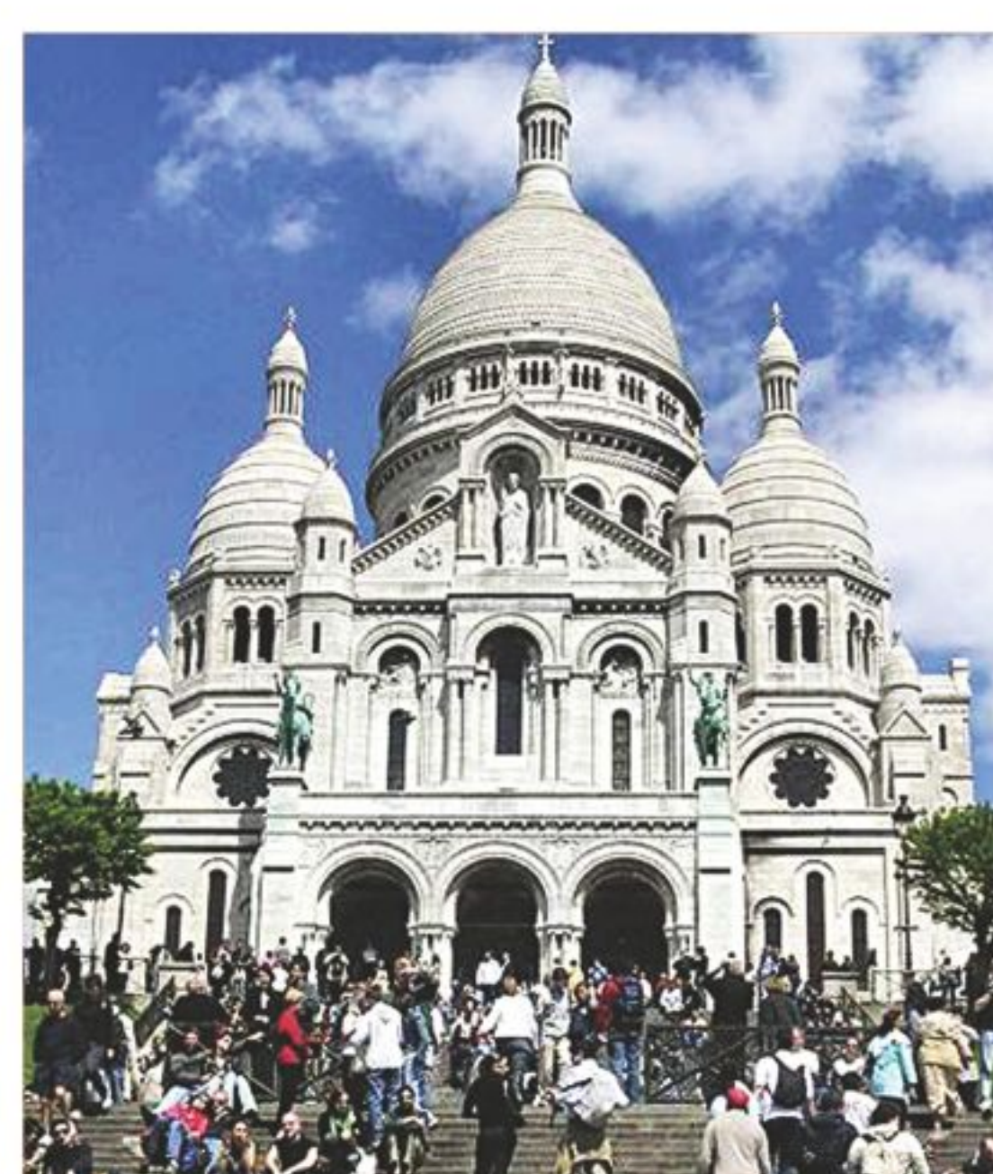
Montmartre in Paris; one can see the whole city from these stairs.

sunshine, which looks warm and golden but feels cool -- absolutely unlike the hot mid summer we know. Everyone looks chic here -- people walking with their beloveds, hand in hand; housemates; pets; and with big, branded, cheerful shopping bags. Last evening I was sitting on the top of the Montmartre (a hill) which is 130 metres high and is a common touristy place. Many artists had studios or worked around the community of Montmartre, such as Salvador Dalí, Amedeo Modigliani, Claude Monet, Piet Mondrian, Pablo Picasso and Vincent van Gogh. I love the atmosphere as I can see the whole Paris from this spot. Few young guys were selling souvenirs, soft drinks, red roses and bottled water. As soon as they heard me talking in Bangla with my friend, they understood that I am from Bangladesh. When I come across Bangladeshis with odd jobs outside the country, they often deliberately ignore me or try to avoid me. This young man, probably 28/29, was different. He talked to me with a very warm smile and was describing how difficult it has been for him to survive here. He came to Paris when he was 16 and now he is 29. For him it has been a tough 13 years. I can easily imag-