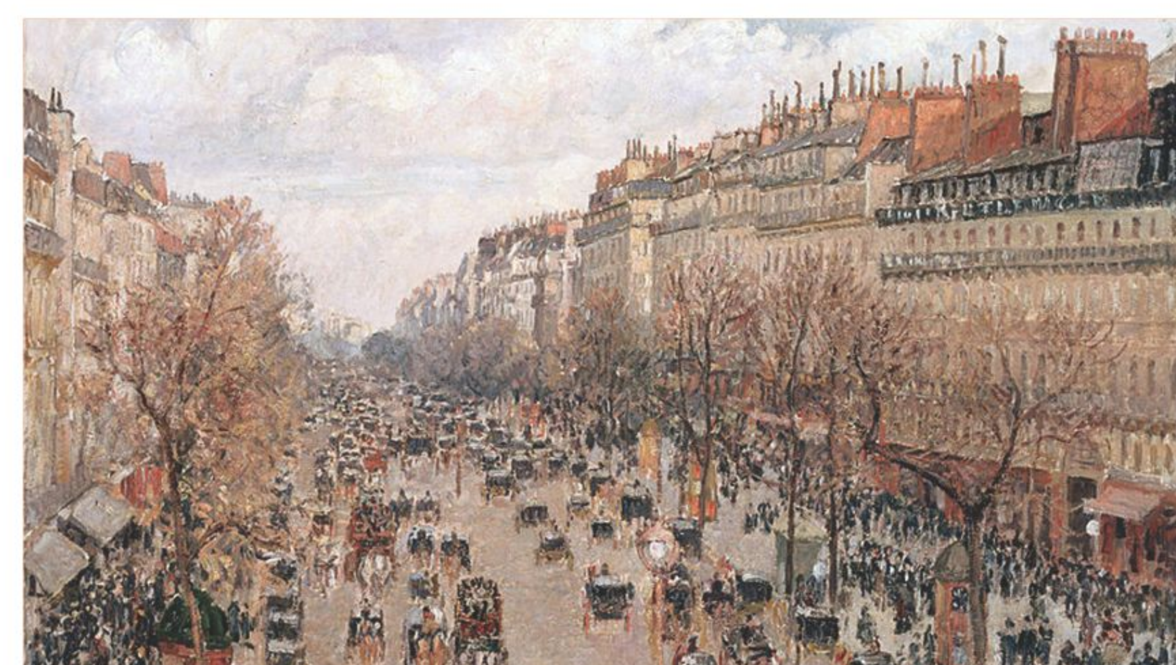
Boulevard Montmartre (1897), a painting by Camille Pissarro of the boulevard that led to Montmartre as seen from his hotel room.