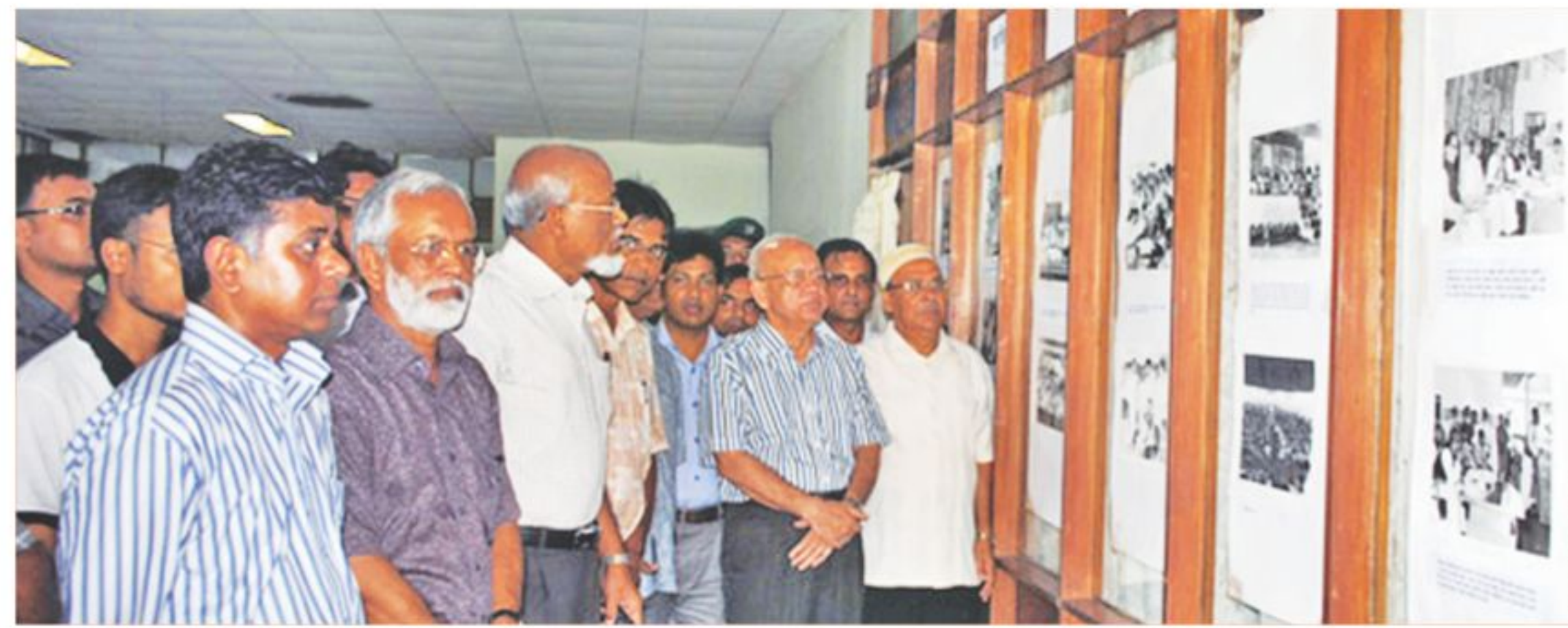
Visitors at the exhibition.

Terming the photographs a priceless collection of the country's history and independence, the speakers also said that the younger generation can get a vivid picture