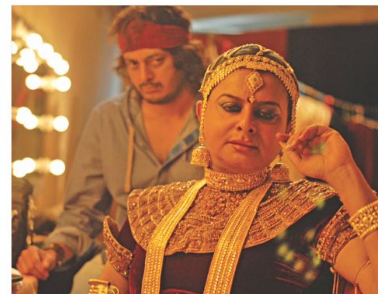
A scene from "Chitrangada".