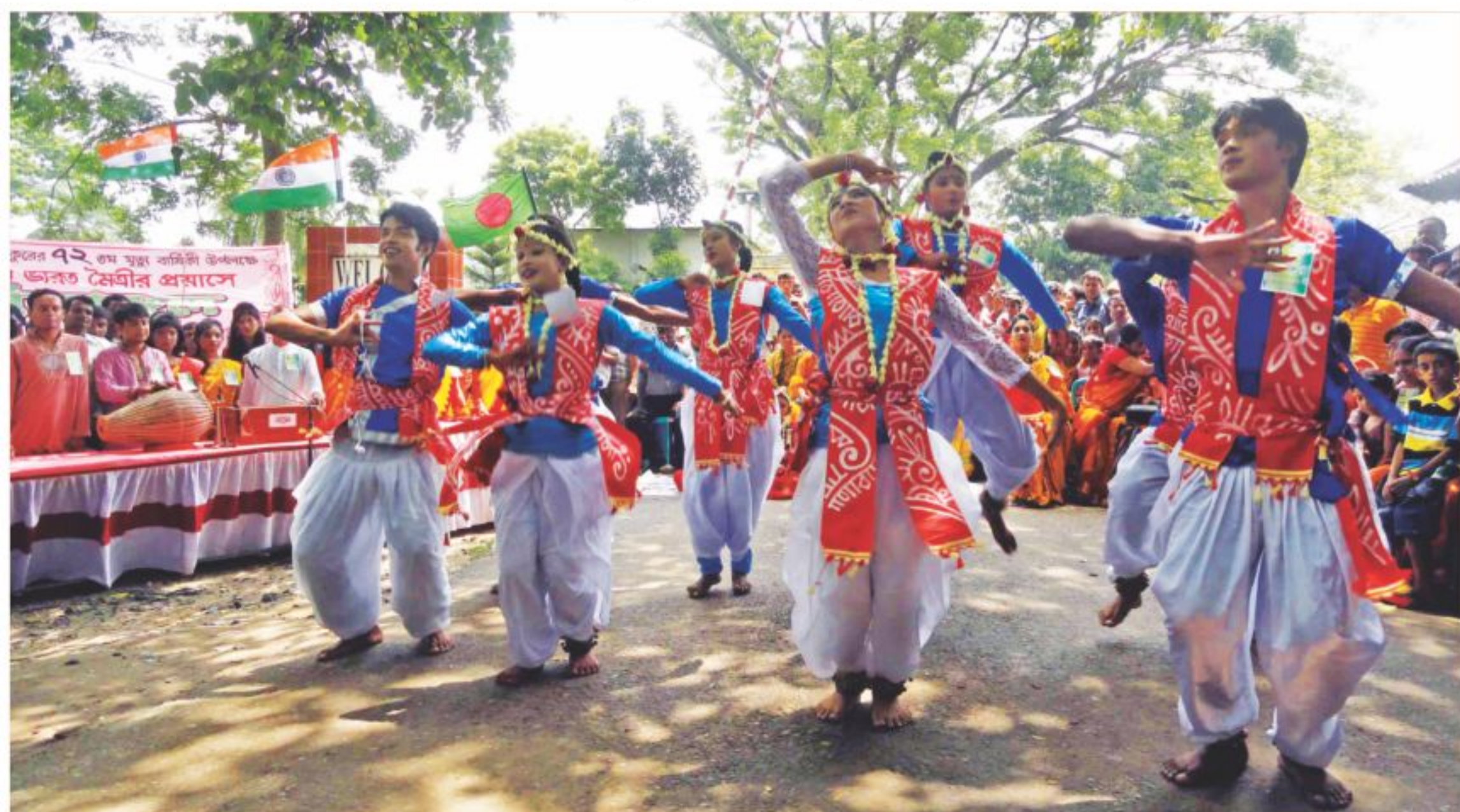
A group dance performance at the programme.