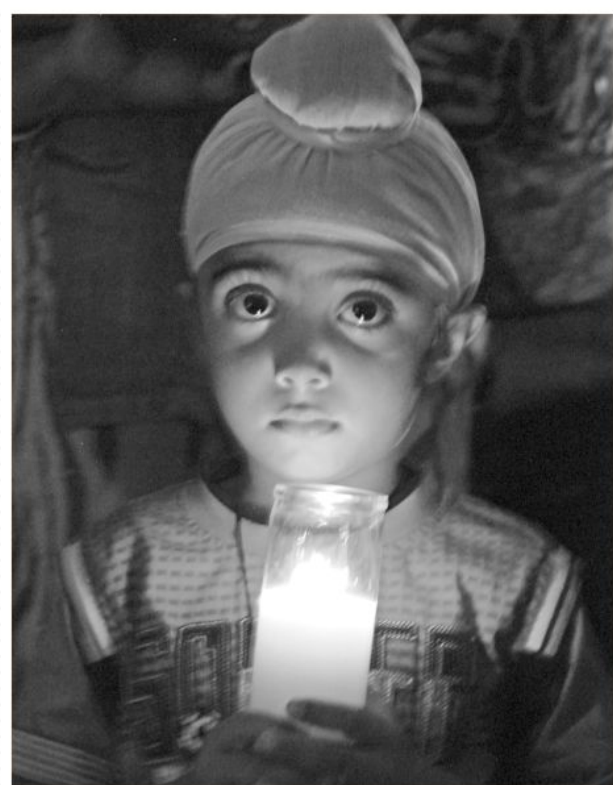
A Sikh boy, 4, holds a candle in honor of six people killed in an attack the day before on a Wisconsin Sikh temple on Monday in Brookfield, Wisconsin, USA.

"He was identified as a mentor for aspiring skinheads," SITE said, noting that Page "engaged in extensive online activity" and maintained user accounts on "some of the most prominent white supremacist forums."