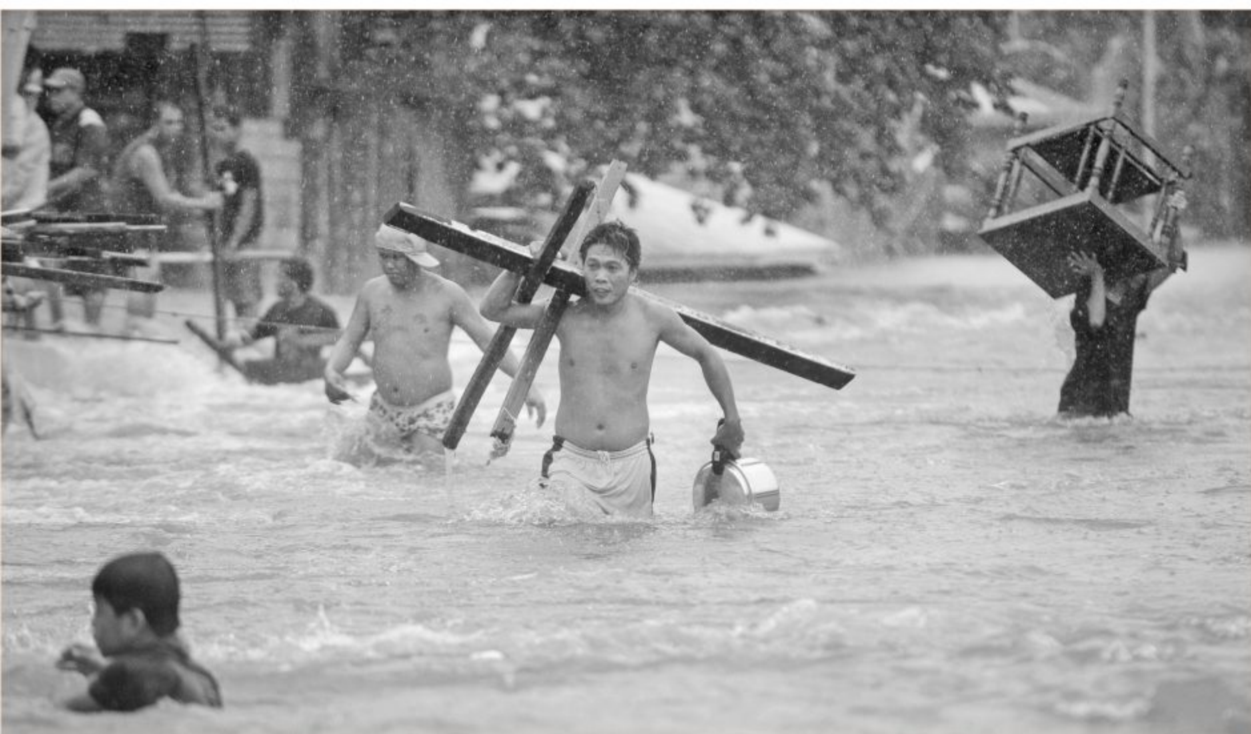
Residents carry their belongings as they wade through flood waters after a river overflowed following torrential rain in Manila yesterday. Half of Manila was under water, officials said, as heavy rains paralysed the city in its worst floods since a typhoon killed more than 400 people three years ago. At least 16 people were killed in the floods so far.