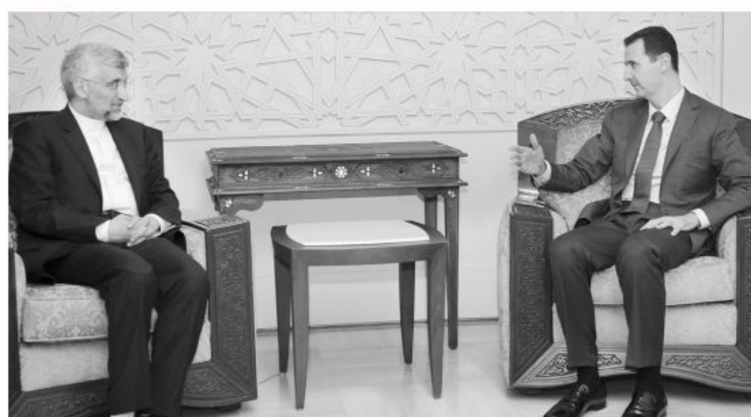
Syrian President Bashar al-Assad, right, meets with Saeed Jalili, a top aide to Iran's supreme leader Khamenei in Damascus yesterday.

Assad has reinforced his troops in preparation for an assault to recapture rebel-held districts of Aleppo after repelling fighters from most of Damascus.