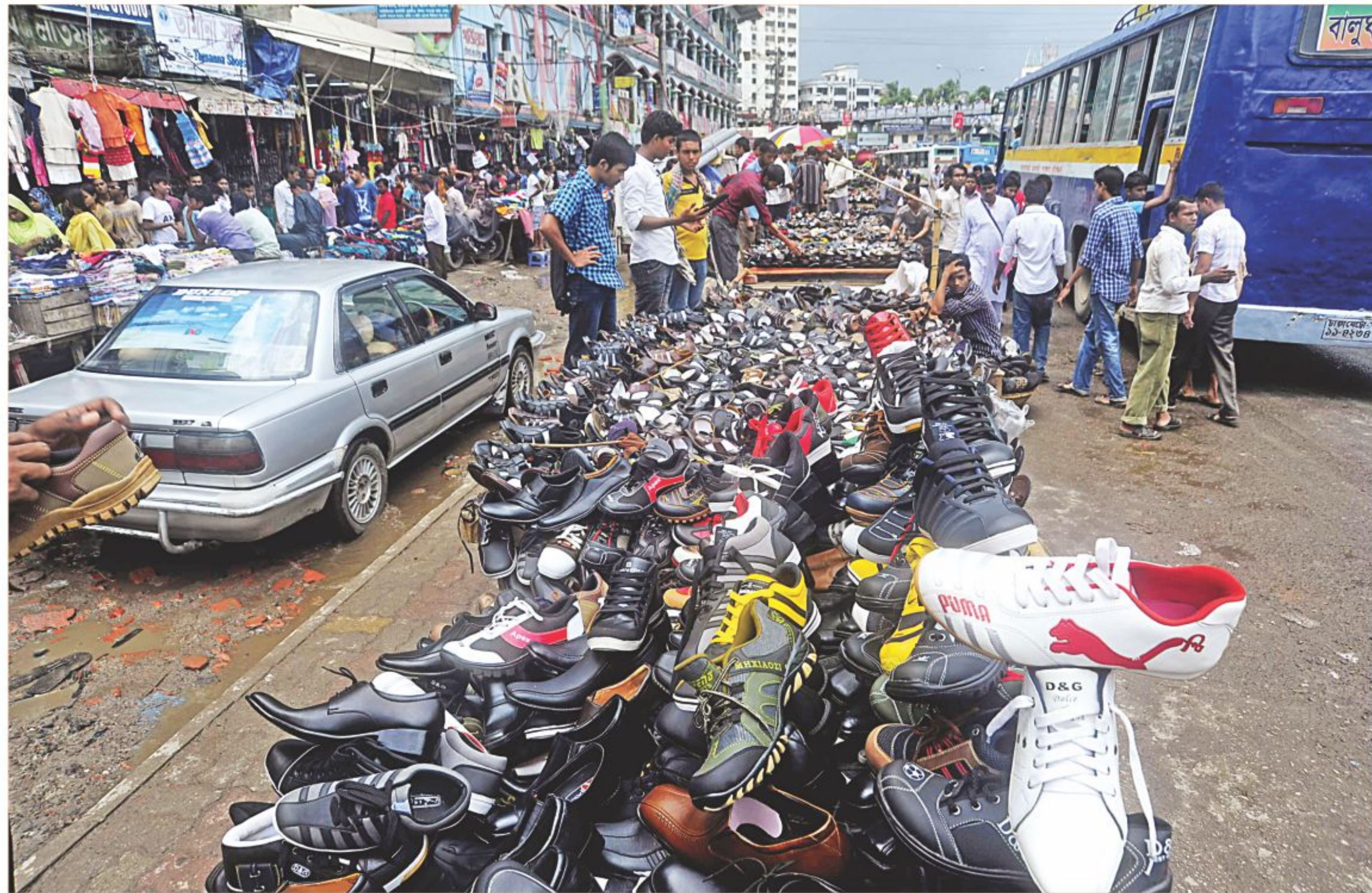
Piles of footwear for sale fill a footpath at Farmgate, much to the inconvenience of the pedestrians. Ahead of Eid-ul-Fitr, this has been a common scene at other busy points of the capital as well. The photo was taken yesterday.

She was a teacher at St Joseph Higher Secondary School from 1981 to 2008.