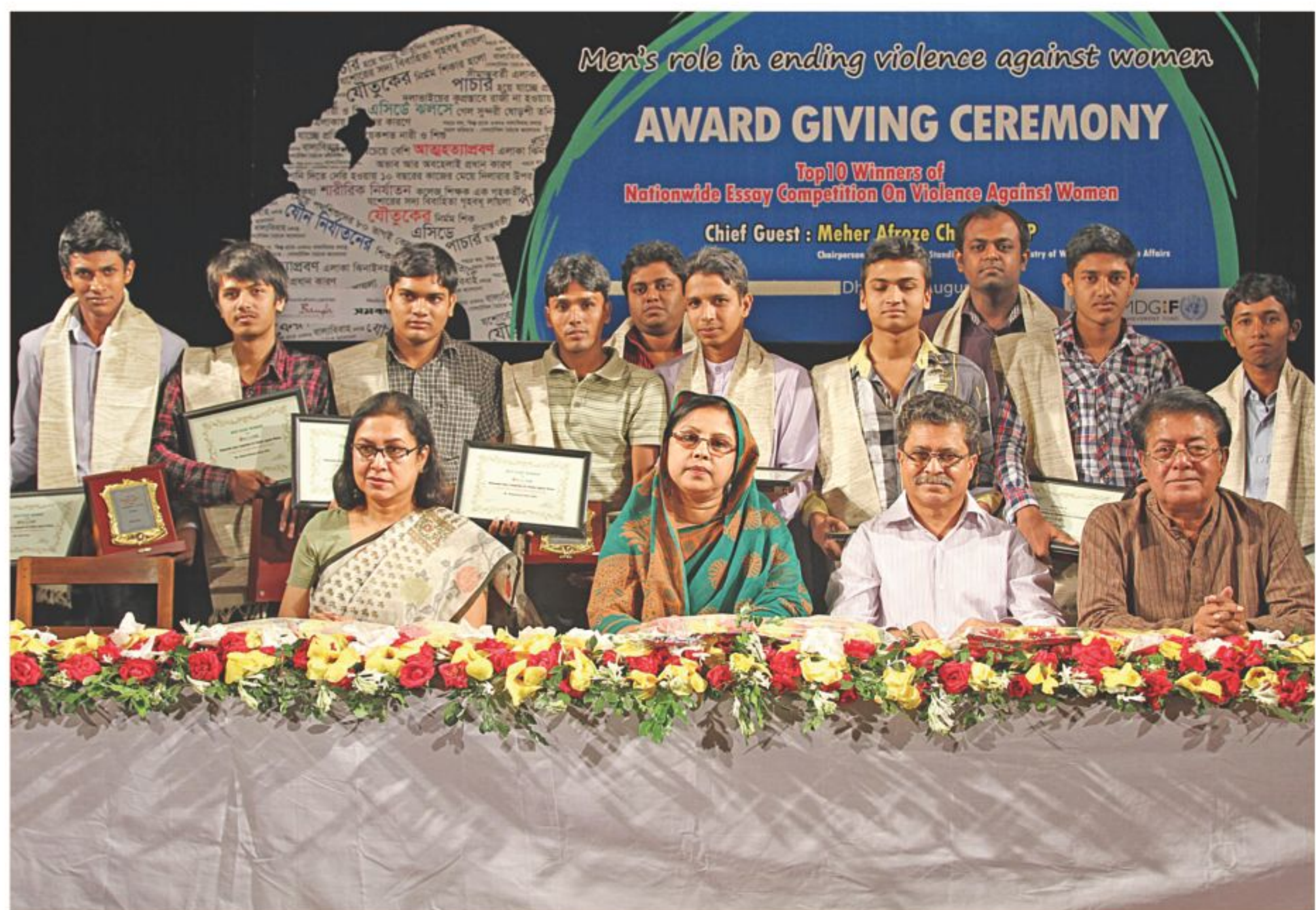
Guests and 10 winning essayists at an award giving ceremony hosted by UN Women at Chhayanaut Bhaban of the capital yesterday.

The robbers looted the valuables after tying up all family members at gunpoint.