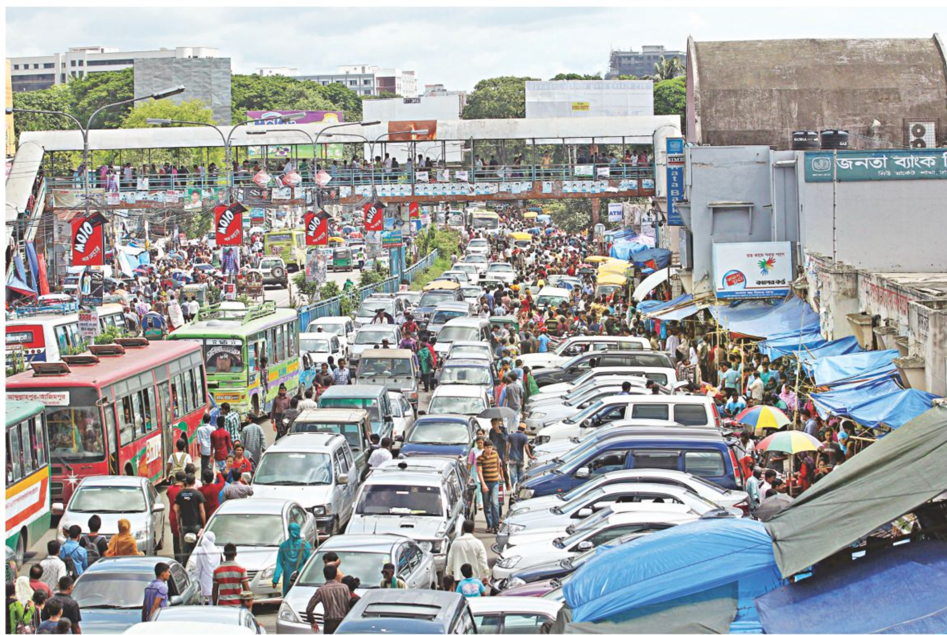
A row of cars parked in front of New Market in the capital causes long tailback on the narrowed-down Mirpur Road yesterday.