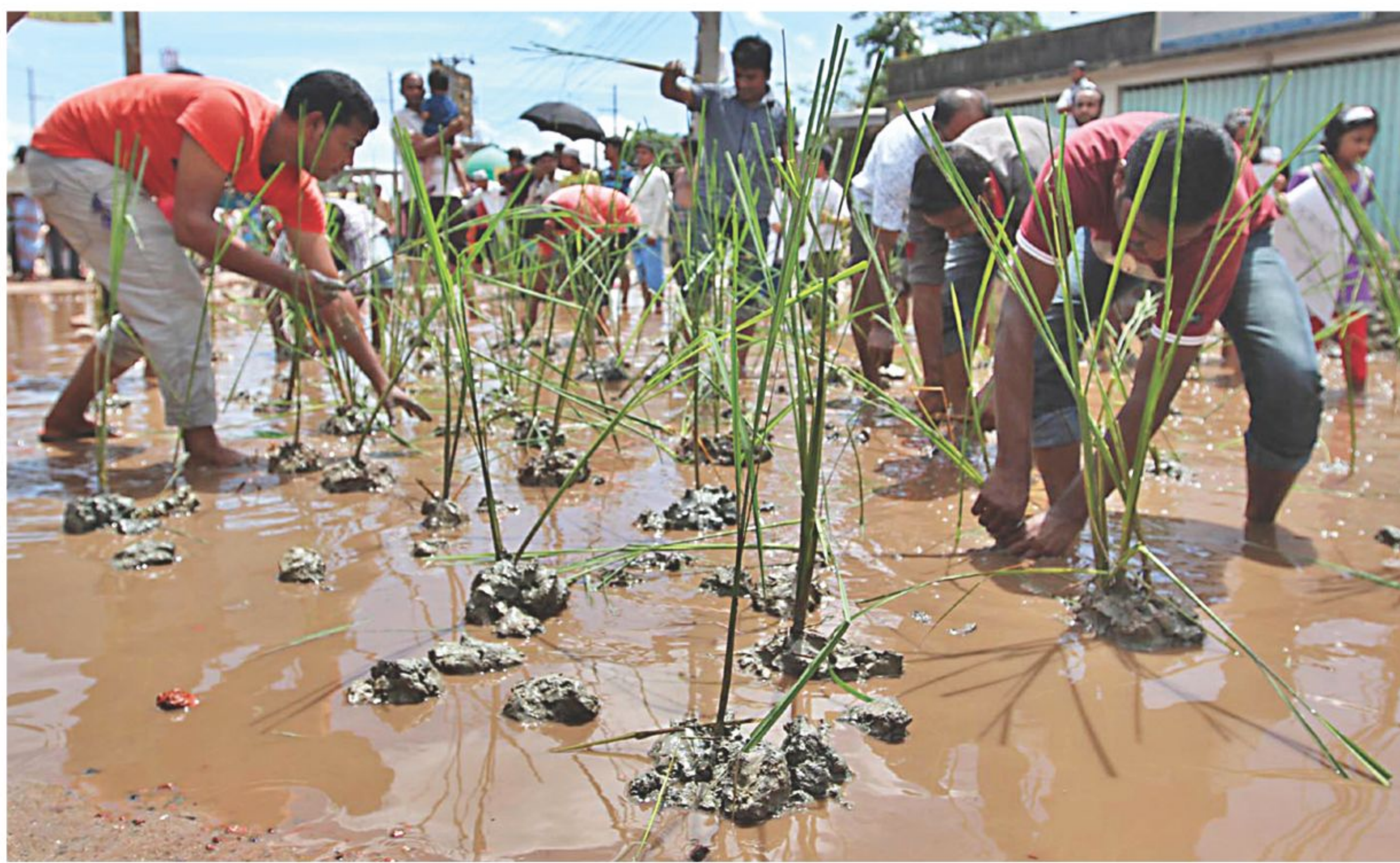
This is in fact a protest scene. Locals, transport owners association and Swopnojatri, a social organisation, are mock-planting paddy seedlings on Arakan road of the port city to draw attention of the authorities concerned to the road's battered condition. The photo was taken yesterday. Story on page 2.