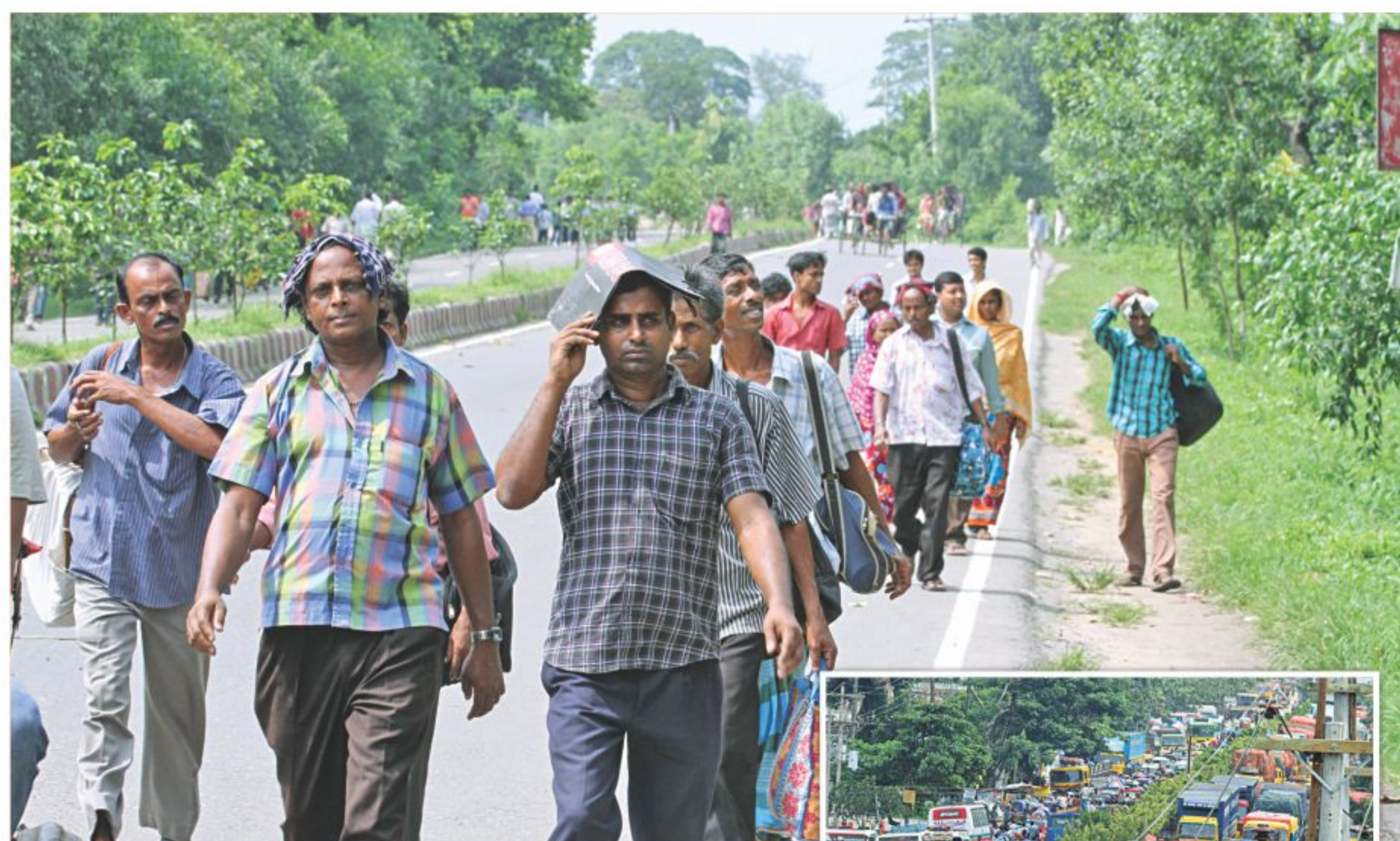
People walk on foot in the sweltering heat while traffic stands still because of barricades put up by agitating students of Jahangirnagar University on Dhaka-Aricha Highway at Savar yesterday.