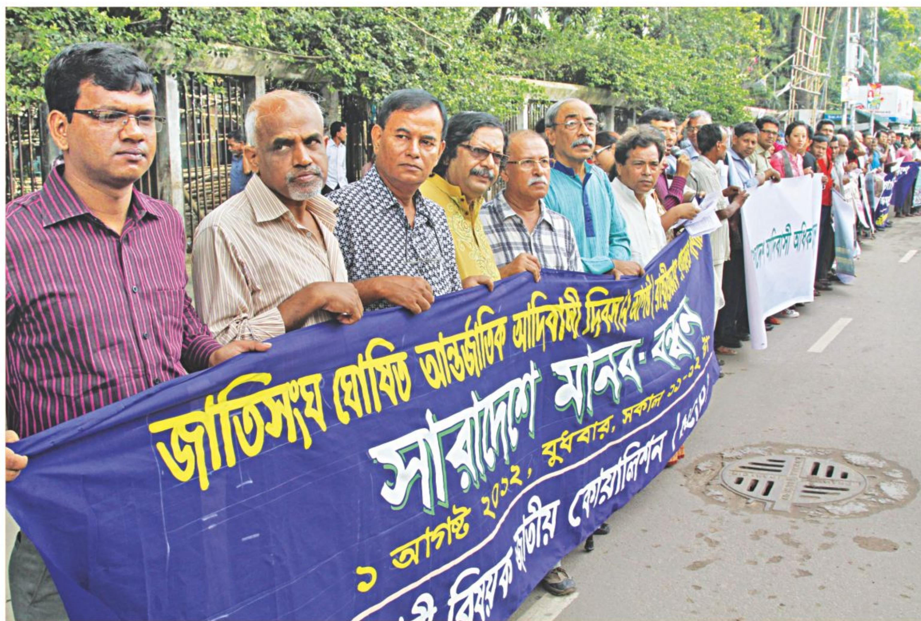
National Coalition for Indigenous Peoples forms a human chain before Jatiya Press Club in the capital yesterday demanding observance of the International Day of the World's Indigenous Peoples by the state.