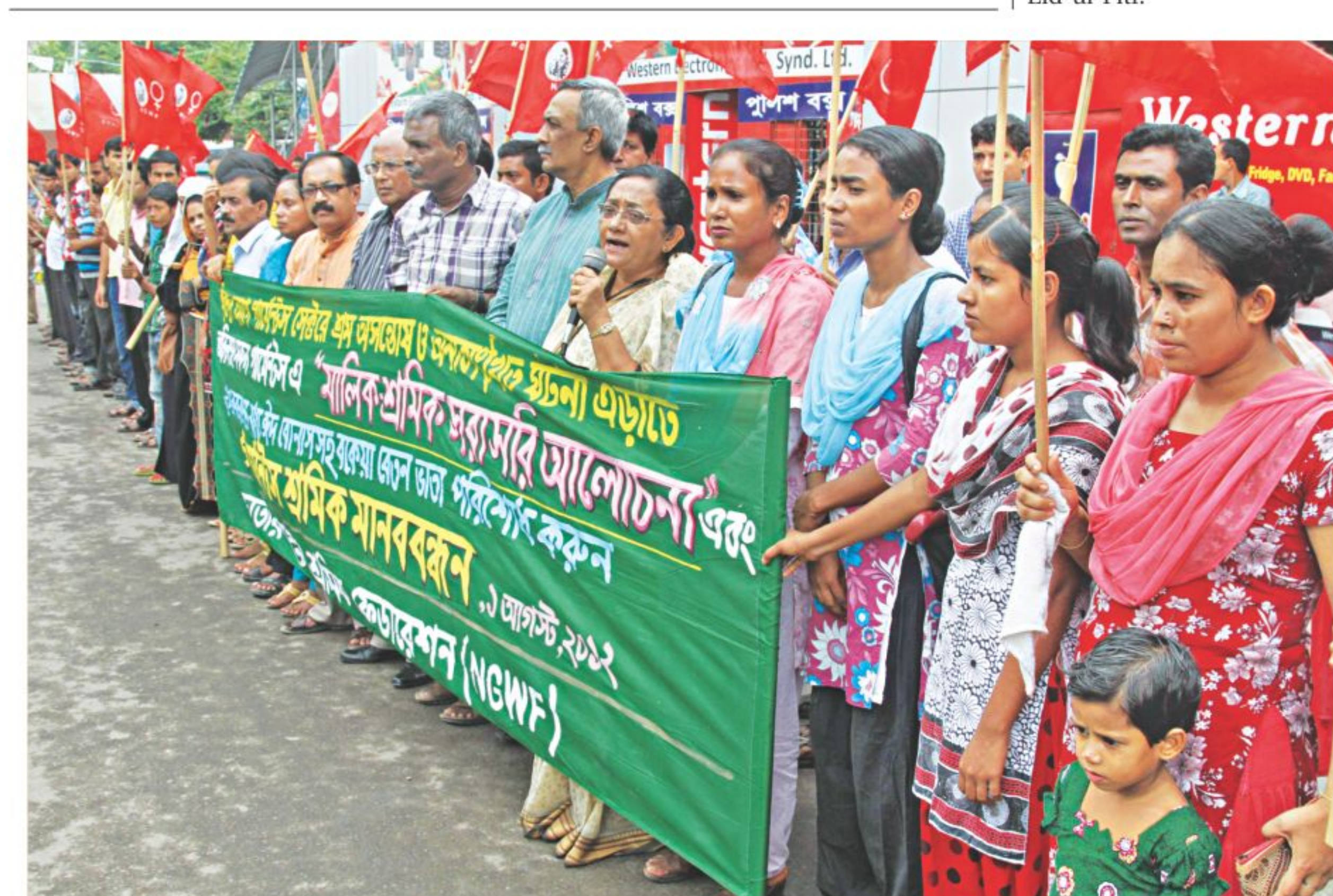
Jatiya Garments Federation forms a human chain in front of Jatiya Press Club in the capital yesterday demanding salaries and bonuses for RMG workers before Ramadan 20.