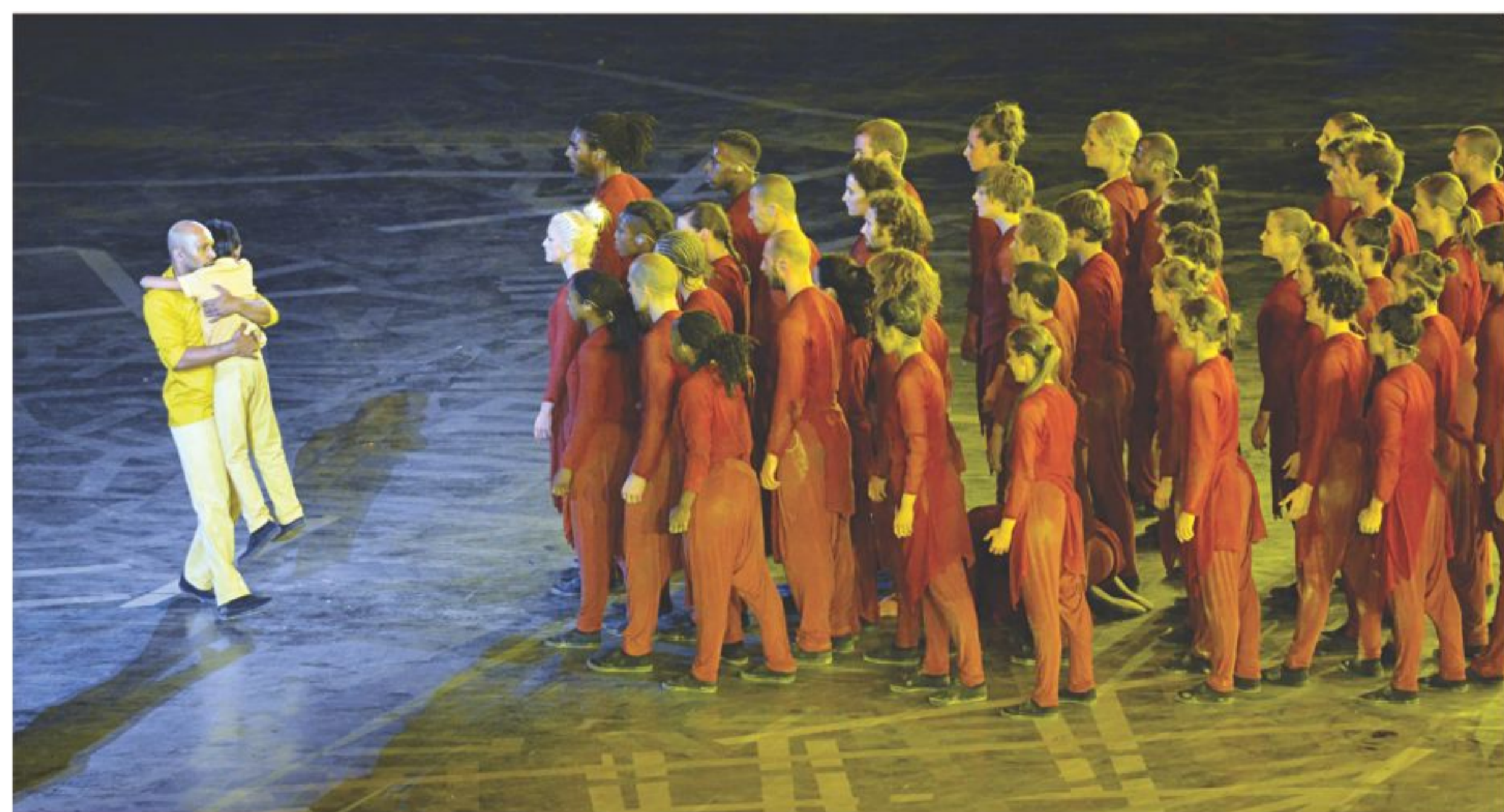
British-born Bangladeshi dancer Akram Khan (L) and his troupe perform during the opening ceremony of the London 2012 Olympic Games on Friday.

"In both we desire to test the very limits of what we're capable of doing. In sports, human endurance, in arts, human imagination."