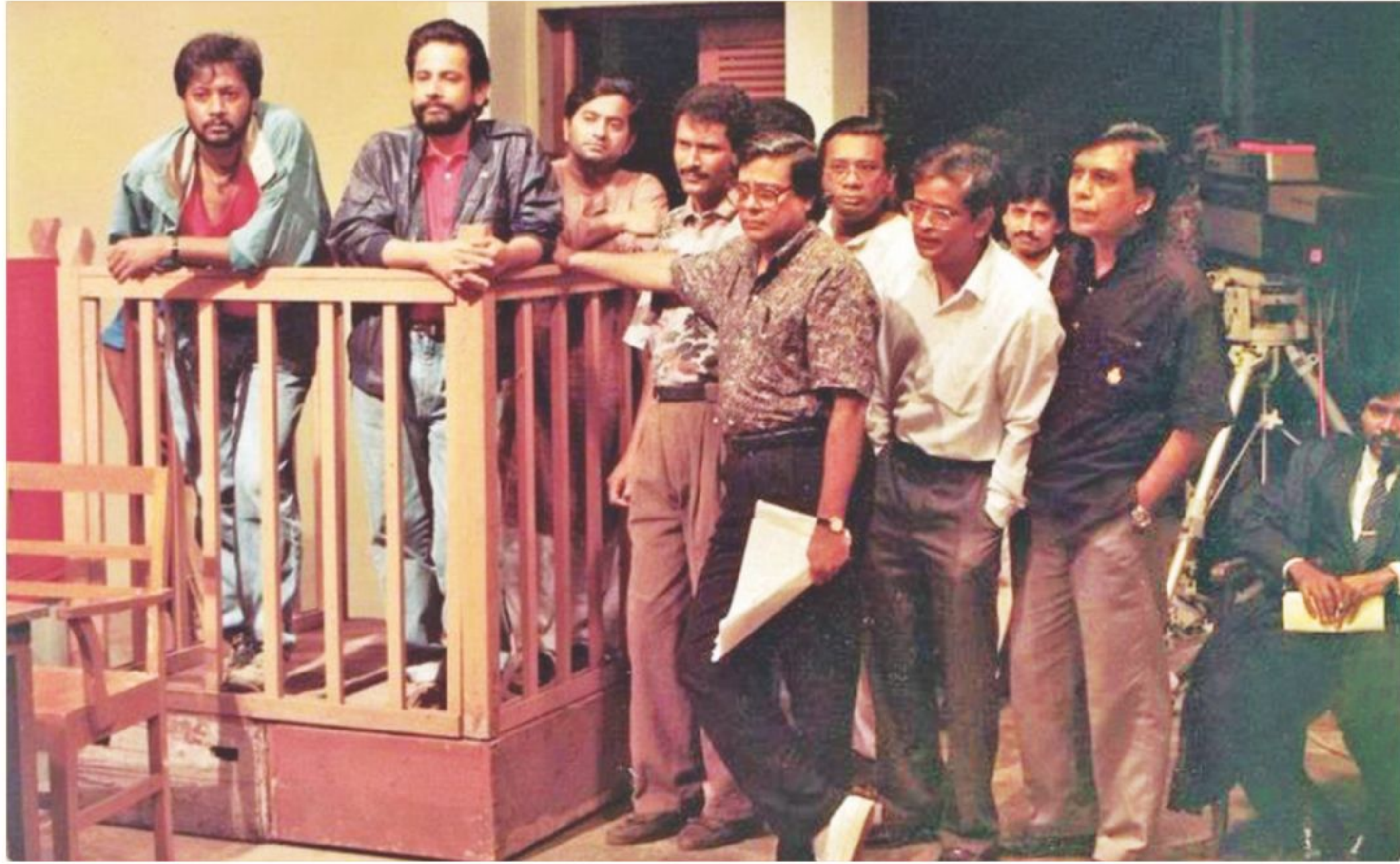
Humayun Ahmed (4-R) on the set of "Kothao Keu Nei".