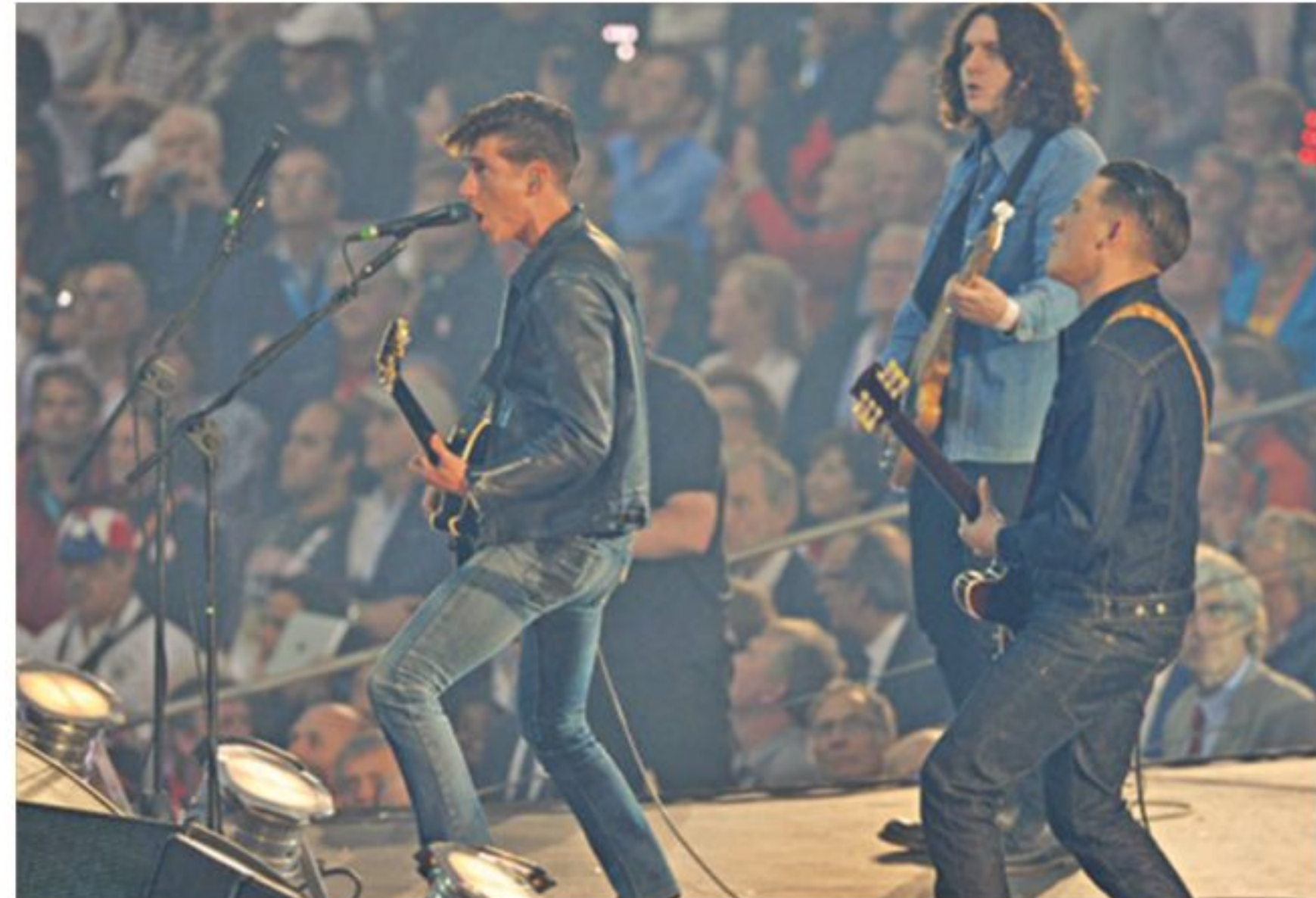
Arctic Monkeys performs at the Summer 2012 Olympics Opening Ceremony.

London's 2012 Olympics opening ceremony raced into the British charts on Sunday with a collection of music from the kaleidoscopic extravaganza becoming the week's fifth-best selling compilation album after just 24 hours on sale. Friday's 27 million pound ($42 million) "Isles of Wonder" spectacle, devised by filmmaker Danny Boyle and watched around the globe, was performed to a roller coaster of British music that ran from Mike Oldfield's blockbuster "Tubular Bells" to Dizzee Rascal's 2009 hit "Bonkers". Elgar's "Nimrod" Enigma Variation shared the Olympic Stadium's stage with Sheffield rockers Arctic Monkeys and British electronic duo Underworld, who were music directors of the event. All feature on the anthology, which had sold 10,000 copies by the sales cut-off time on Saturday, enough to make it fifth in the compilation album charts, which are separate from the main album rankings, the Official Charts Company said. The week's best-selling album, "Ill Manors" from London singer Plan B, brought another Olympic connection to the charts as it topped the rankings on its debut. "The album is the soundtrack for a low budget crime film of the same title written and directed by Plan B - under the name Ben Drew - set in the run-down London area of Newham which includes the Olympic Stadium in its boundary. English rock band Florence and the Machine held on to the top spot in the singles charts with "Spectrum".