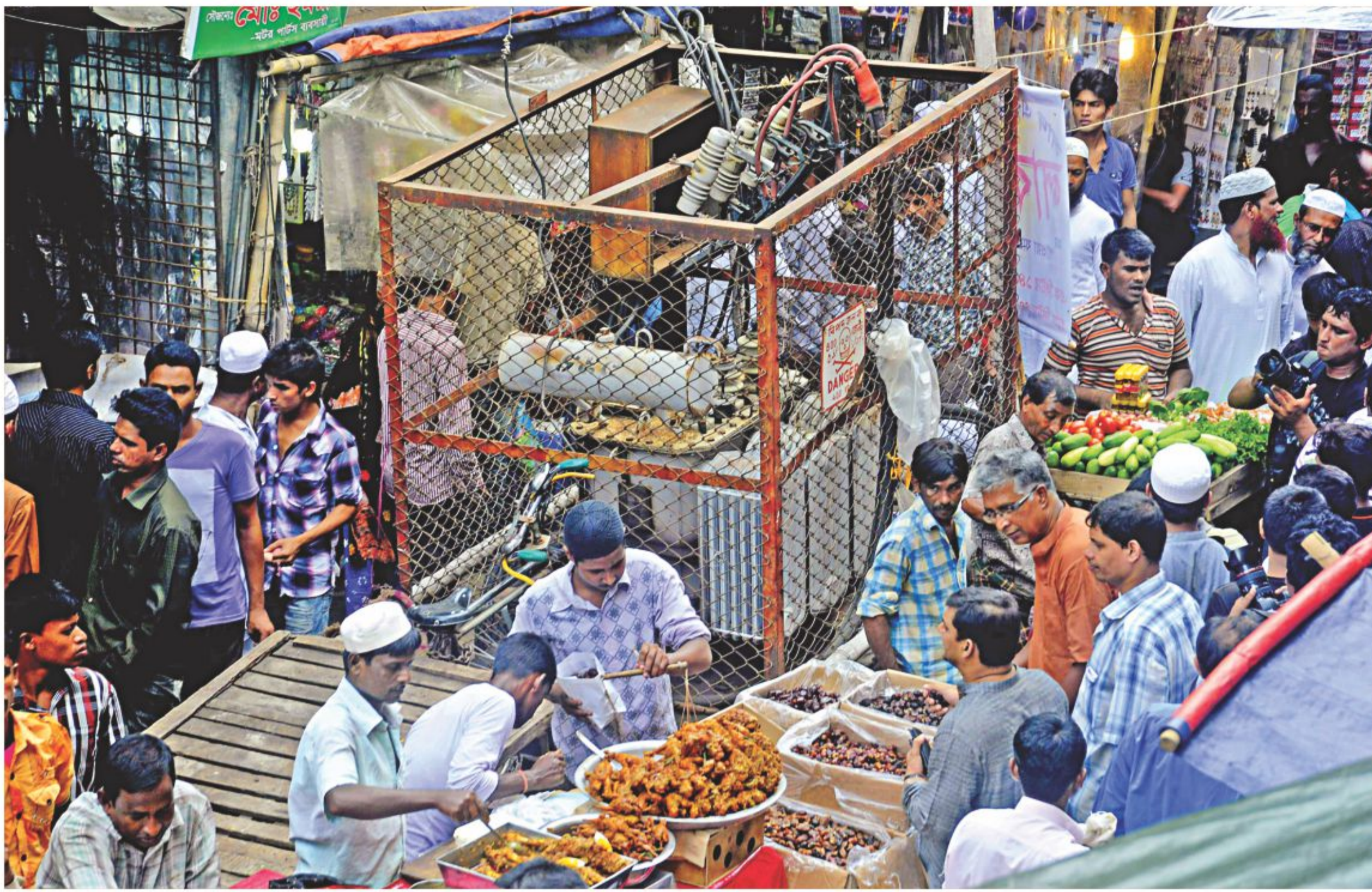
A transformer is kept right in the middle of a busy road in Old Dhaka's Chawkbazar, posing a grave risk of electrocution for citizens. The photo was taken recently.

The BNP-Jamaat alliance government passed the act to give immunity from prosecution all those who carried