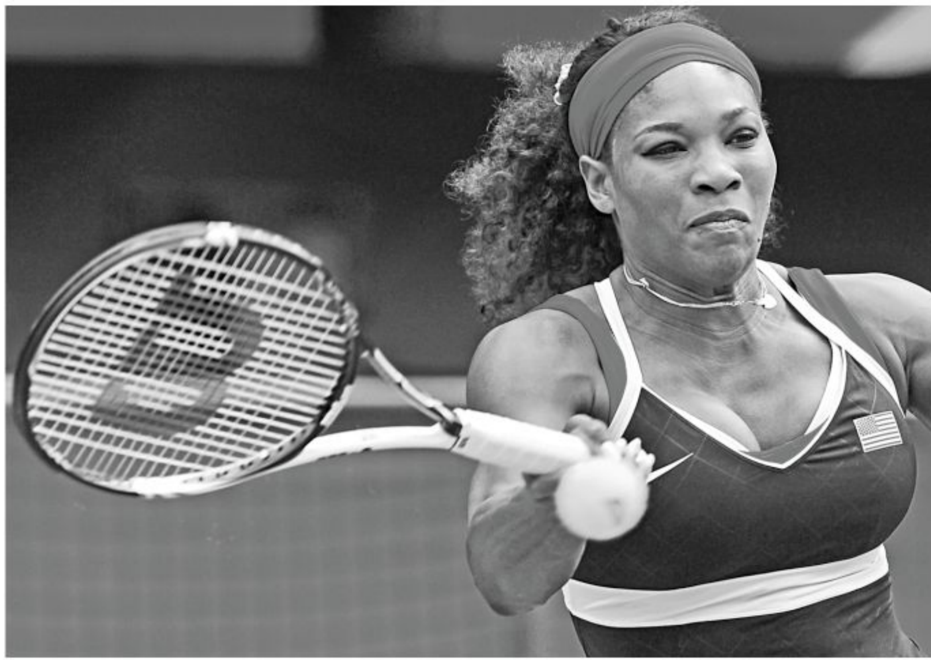
US tennis superstar Serena Williams smashes a forehand during her Olympics women's singles victory over Serbia's Jelena Jankovic at the All England Tennis Club in London yesterday.