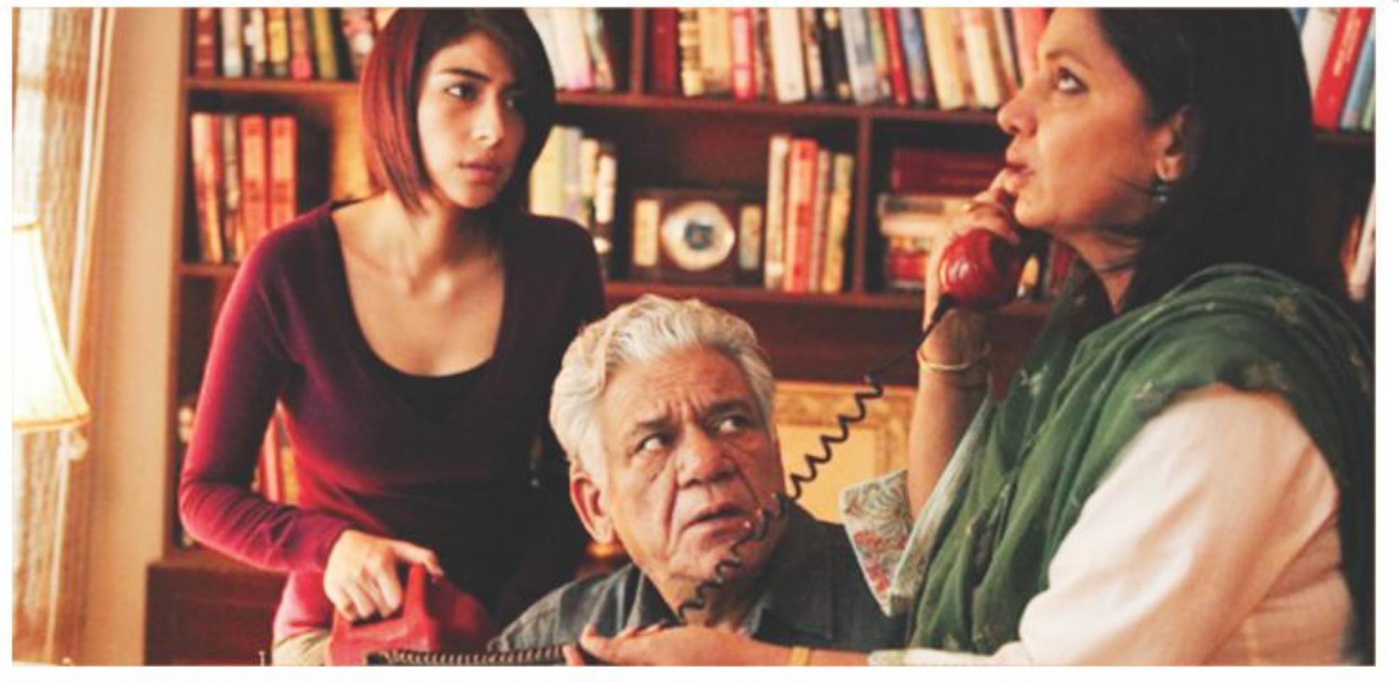
Scenes from "English Vinglish" (top) and "The Reluctant Fundamentalist".

Also to be screened at the festival are political thriller "Argo", helmed by and starring Ben Affleck, Robert Redford's "In the Company You Keep," about a civil-rights lawyer exposed as a fugitive for murder and the much-anticipated "Cloud Atlas," an adaptation of the best-selling novel starring Tom Hanks and Halle Berry, directed by Twyker and "Matrix" co-directors Andy and Lana Wachowski.