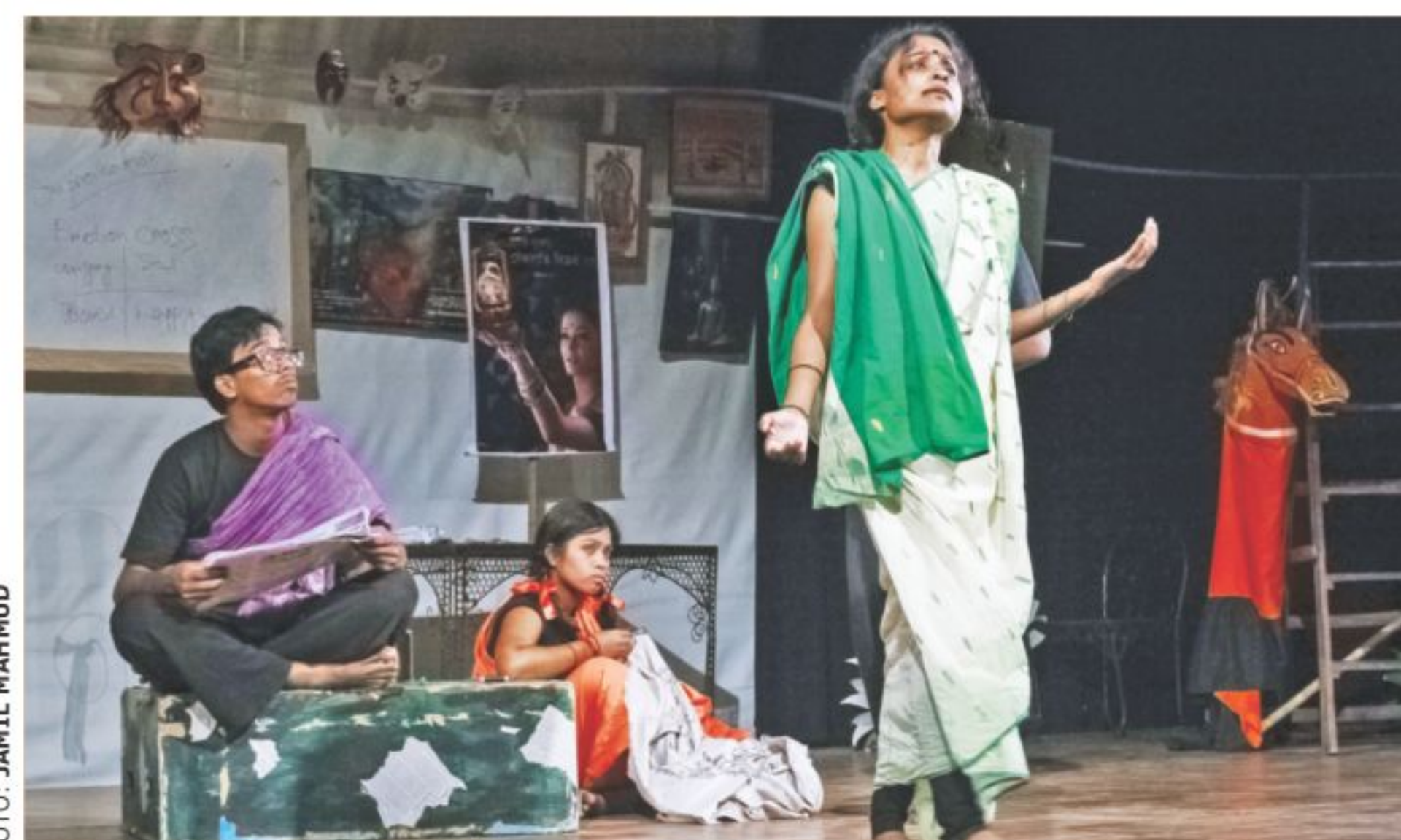
The play subtly mocks the so-called Babu-culture and upholds the struggles of the performers.