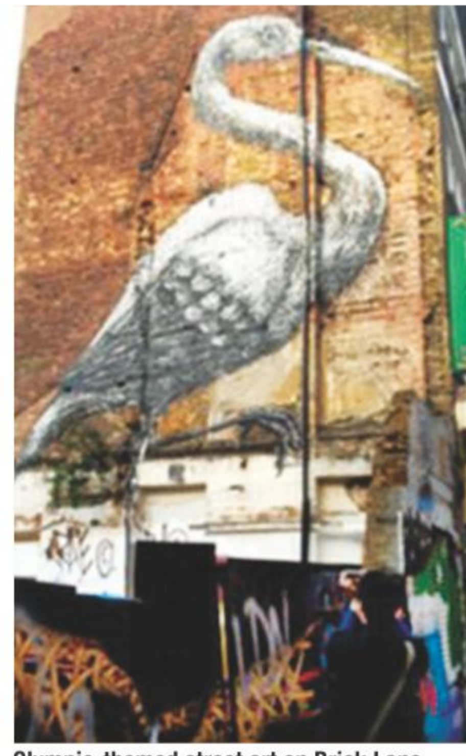
Olympic-themed street art on Brick Lane has been left untouched.