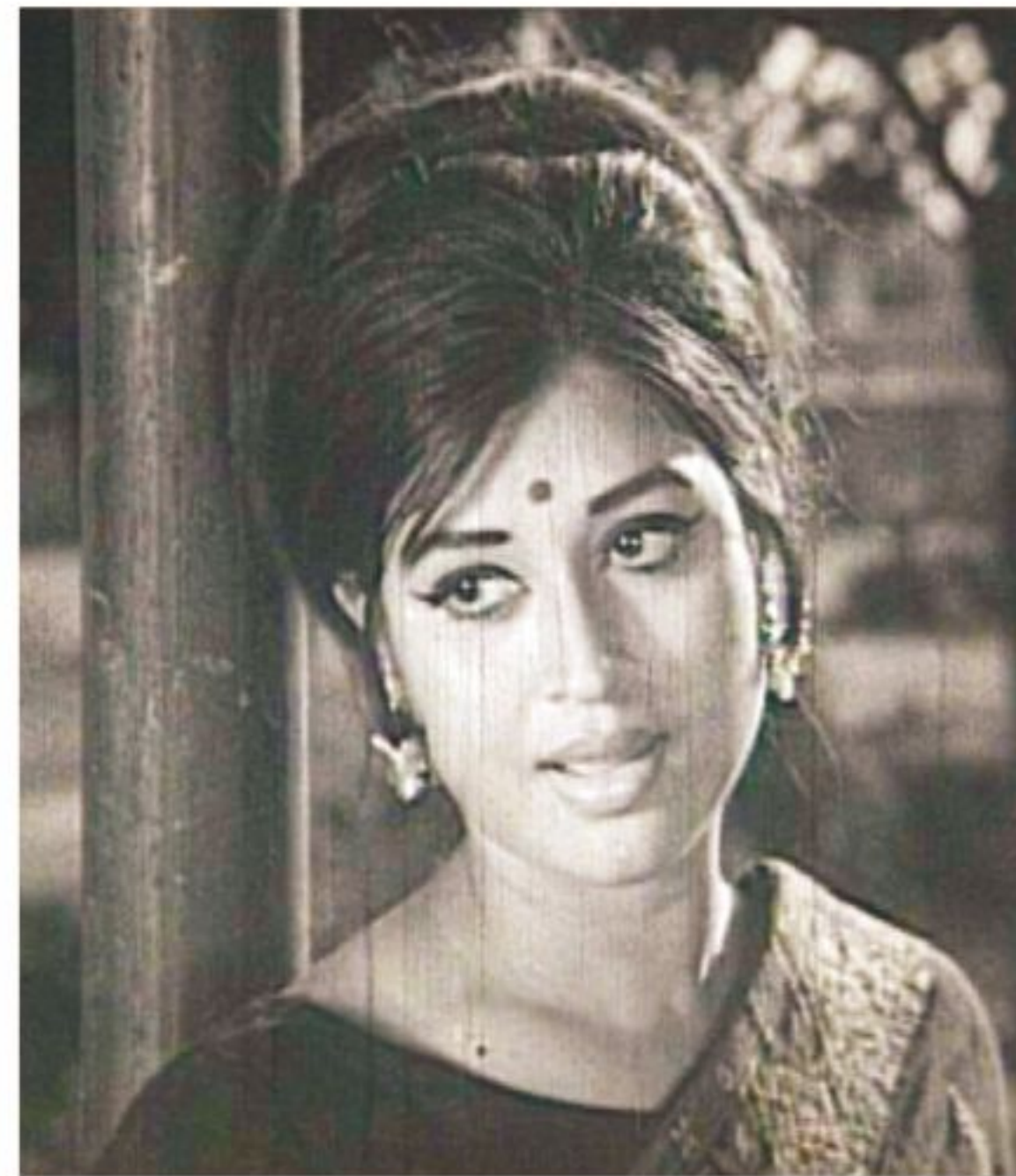
In her days of glory.

So, there was every reason for the Pakistani cine-goers to rejoice once the couple arrived. Besides the regular TV shows, interviews, Pakistan TV hosted a grand reception for