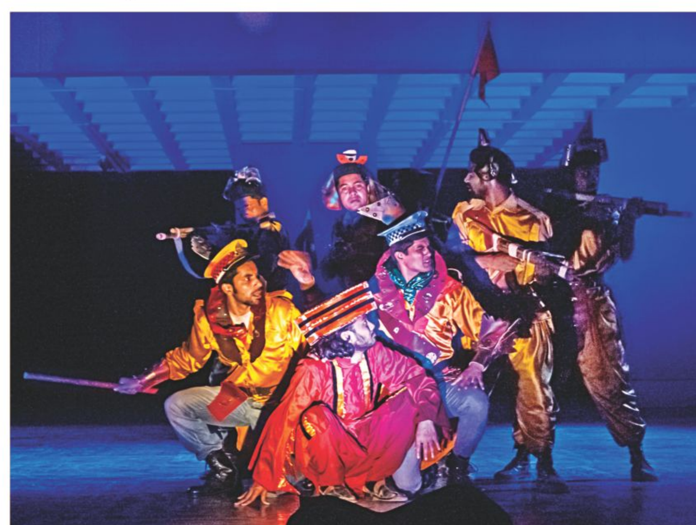
In the play, the Pakistani Army and its collaborators will dress as colonial rulers.

Audience will see the maximum utilisation of space