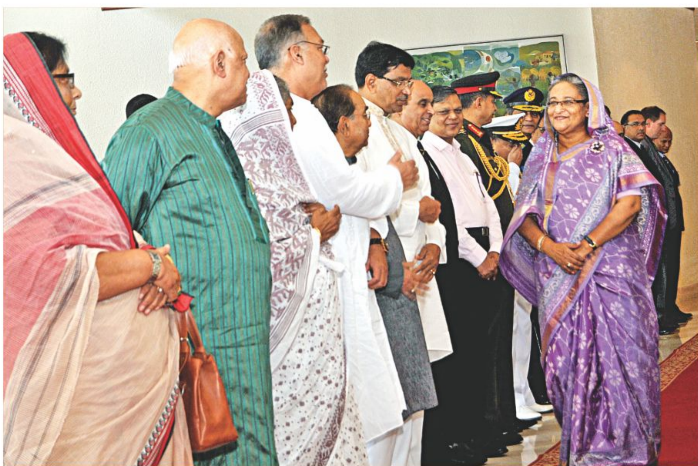
Cabinet members, civil and military high-ups and Awami League leaders see Prime Minister Sheikh Hasina off at Hazrat Shahjalal International Airport prior to her departure for London yesterday.

A mobile court also fined Faith Consumer and Beverage in Purana Paltan Tk 50,000 for producing and selling drinks without BSTI licence. The court also sealed the company.