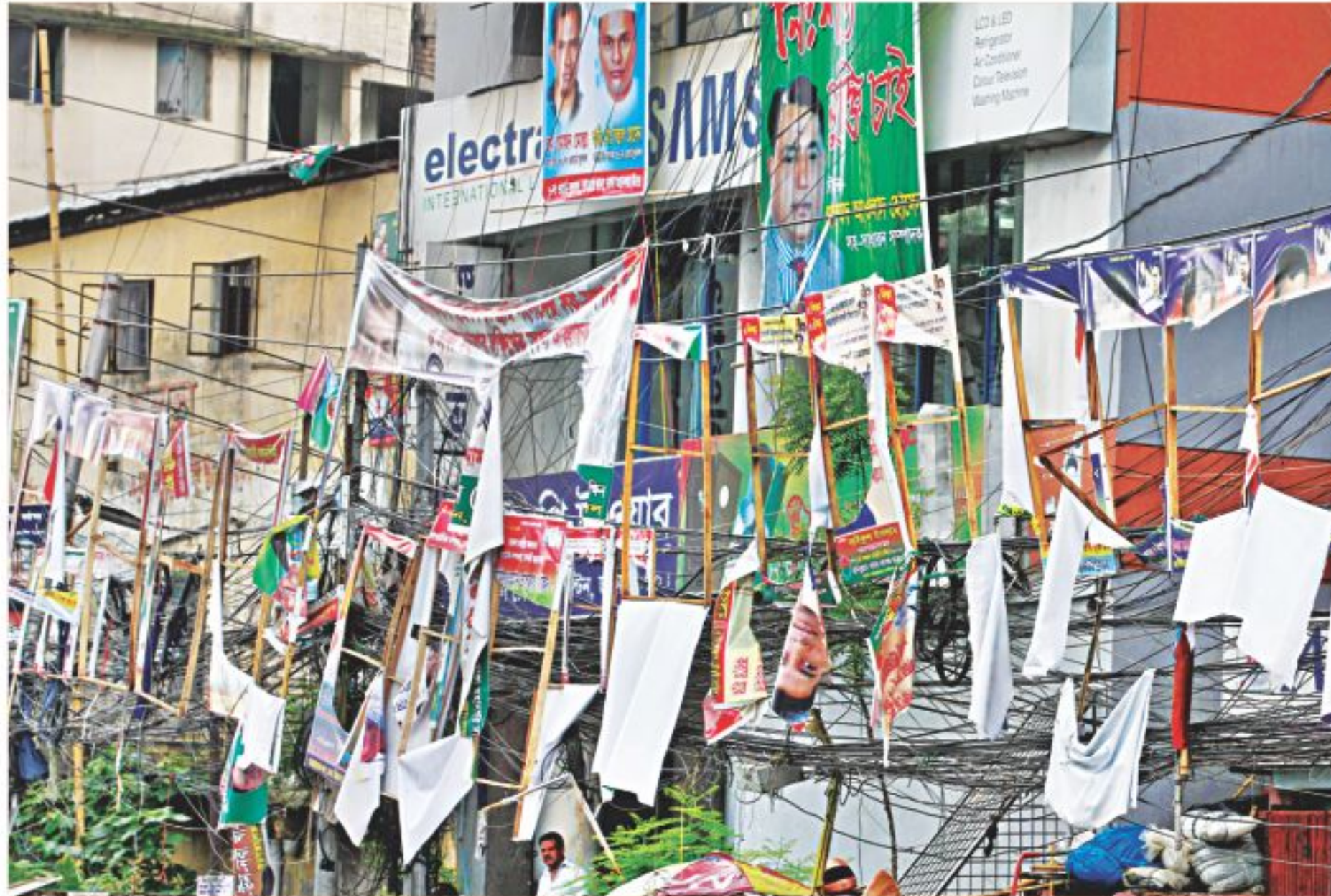
Posters and banners before the main opposition BNP's Naya Paltan office are being torn down allegedly by city corporation staff. The picture is different at Bangabandhu Avenue, where the ruling Awami League office is located. The photos were taken recently.