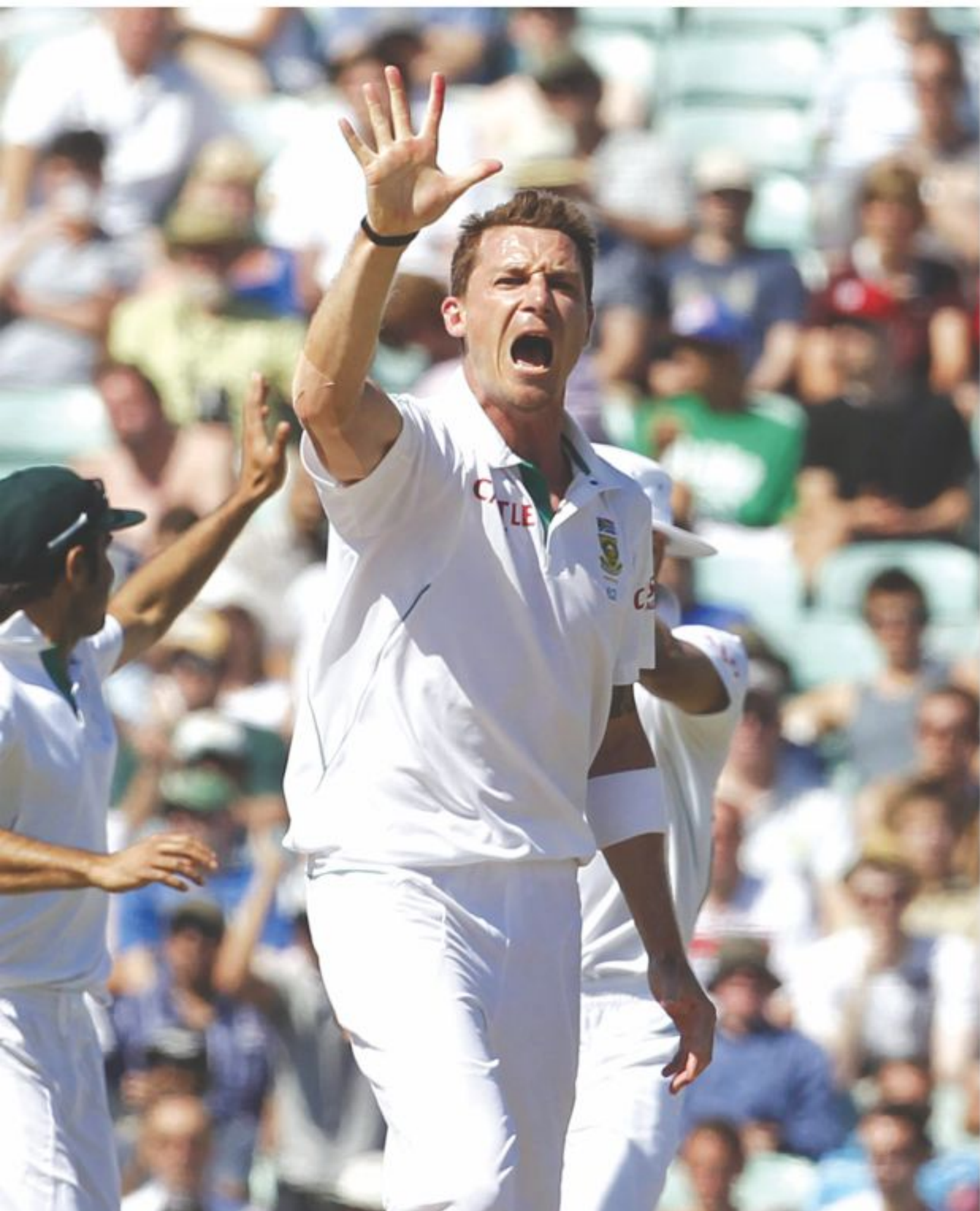
5-STAR STEYN: South Africa fast bowler Dale Steyn celebrates picking up his fifth wicket, that of England batsman Graeme Swann, to speed up the home team's demise on the fifth day of the first Test at The Oval in London yesterday.