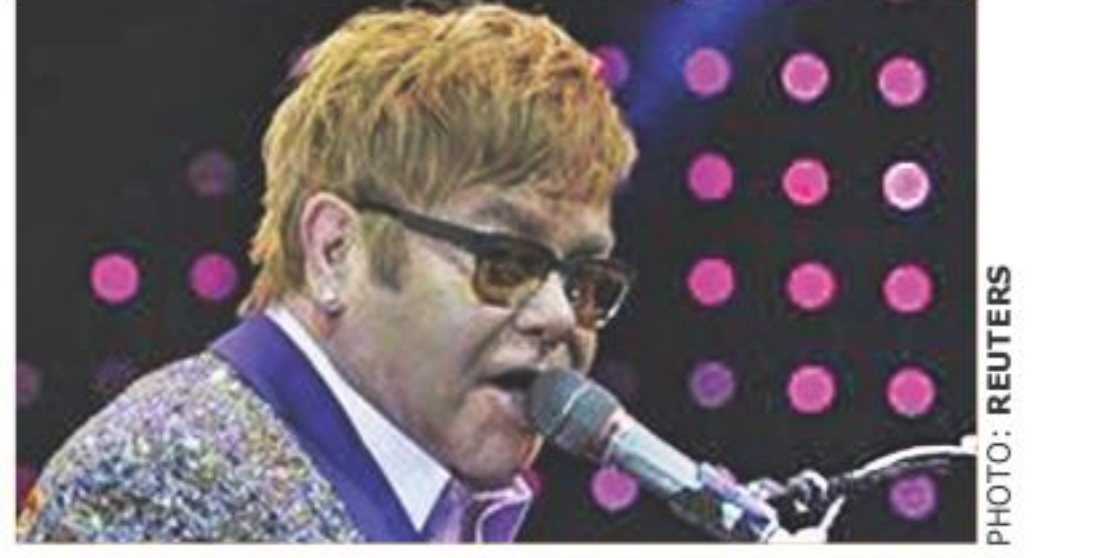
Elton John performs during a concert as part of his "Greatest hits Live 2012" world tour in Bratislava, Slovakia on July 10, 2012.

Elton John has scored his first number one album in 22 years, an electronic reworking of his hit songs, while Florence and the Machine clung to top spot in the singles chart for a second week running, the Official UK Charts Company said on Sunday.