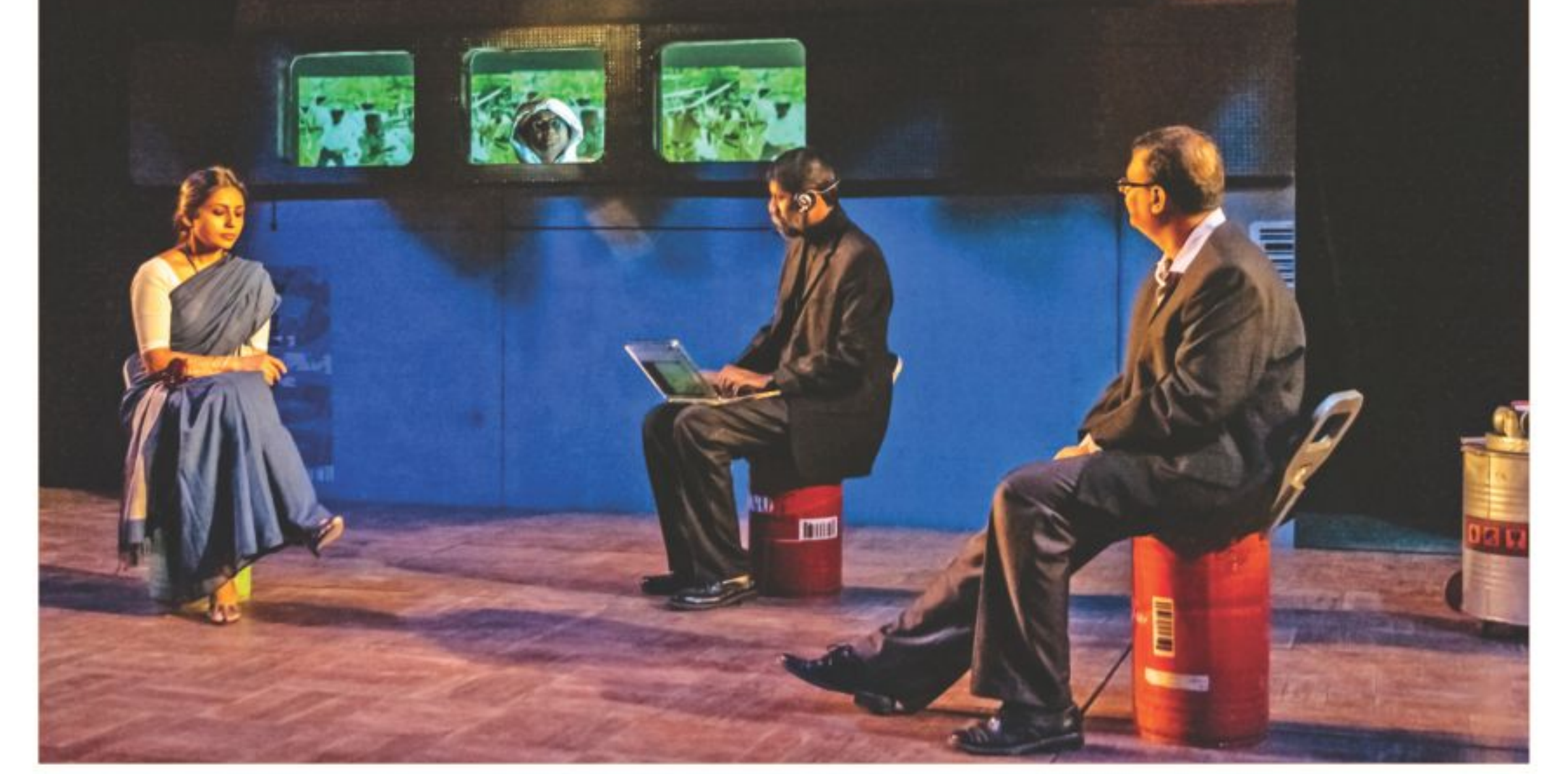
As the play draws to an end, Sekandar's father-- now a departed soul-- contacts him through high-tech equipment and tells him to re-think his own identity.

50th show of Shylock and Sycophants staged