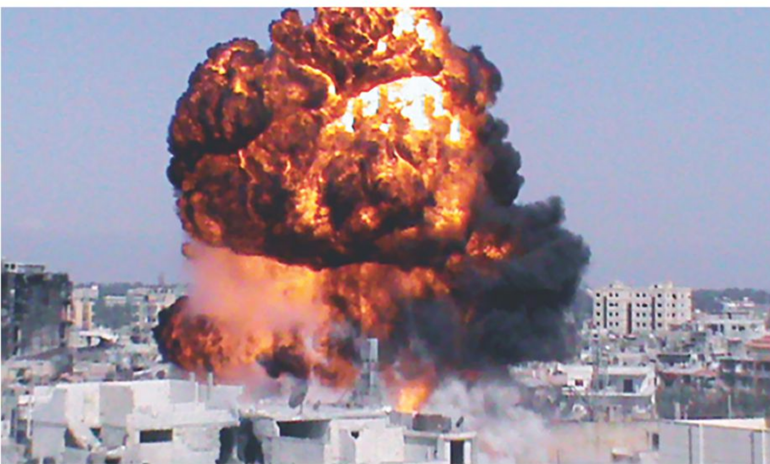
An image grab from video, released by the Syrian opposition Shaam News Network Saturday, shows an explosion alleged to be in the Jouret al-Shayyah neighbourhood of the central Syrian city of Homs.