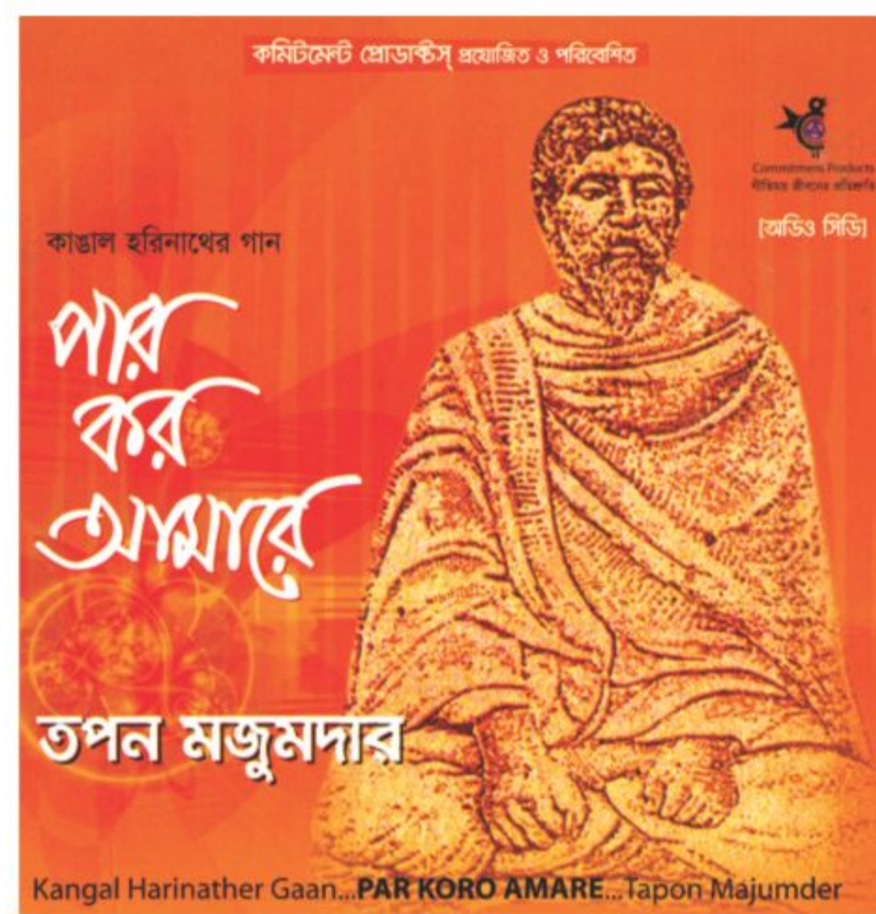
Cover jacket of the album.

Between 1883 and 1893, Harinath published his Baul songs in 16 volumes under the title "Kangal Fikir Chand Fakirer Geetaboli". Harinath's disciples included Akshay Kumar Maitreya, Dinendranath Roy and Jaladhar Sen. Harinath died on April 16, 1896. His complete writings were published posthumously, in 1901, as "Harinath Granthaboli".