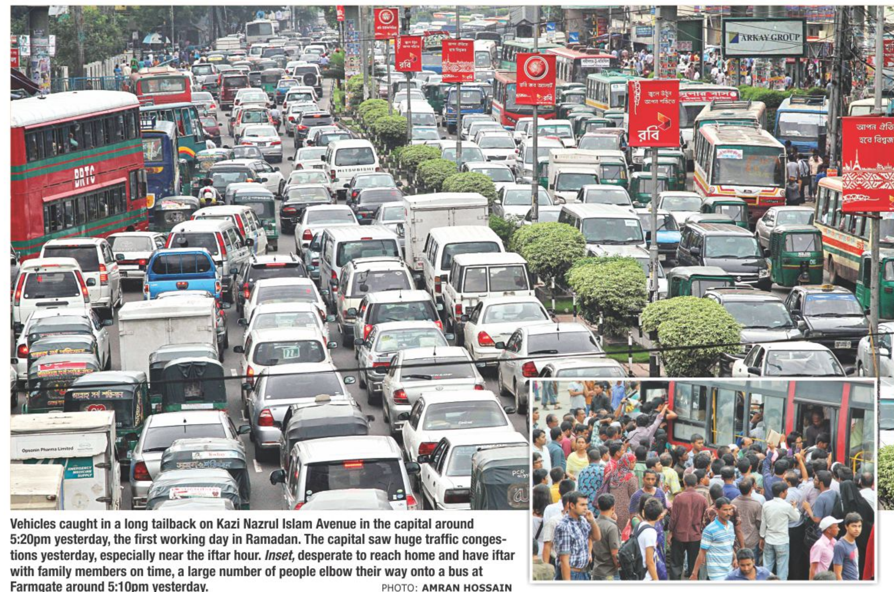
Vehicles caught in a long tailback on Kazi Nazrul Islam Avenue in the capital around 5:20pm yesterday, the first working day in Ramadan. The capital saw huge traffic congestions yesterday, especially near the iftar hour. Inset, desperate to reach home and have iftar with family members on time, a large number of people elbow their way onto a bus at Farmgate around 5:10pm yesterday.

issue, not two," the minister said, implying that the issue involving the Anti-Corruption Commission was not really a problem. "There was a little problem with the World Bank's fourth condition. We are trying to see how it can be resolved." He indicated that the government was working to send those public officials on leave. If the issue of the fourth condition can be solved, the project's work can start very soon, said Muhith. The WB cancelled its $1.2 billion credit for the Padma bridge project on June 29, saying it had proof of a corruption conspiracy involving Bangladeshi officials, executives of a Canadian firm and private individuals.