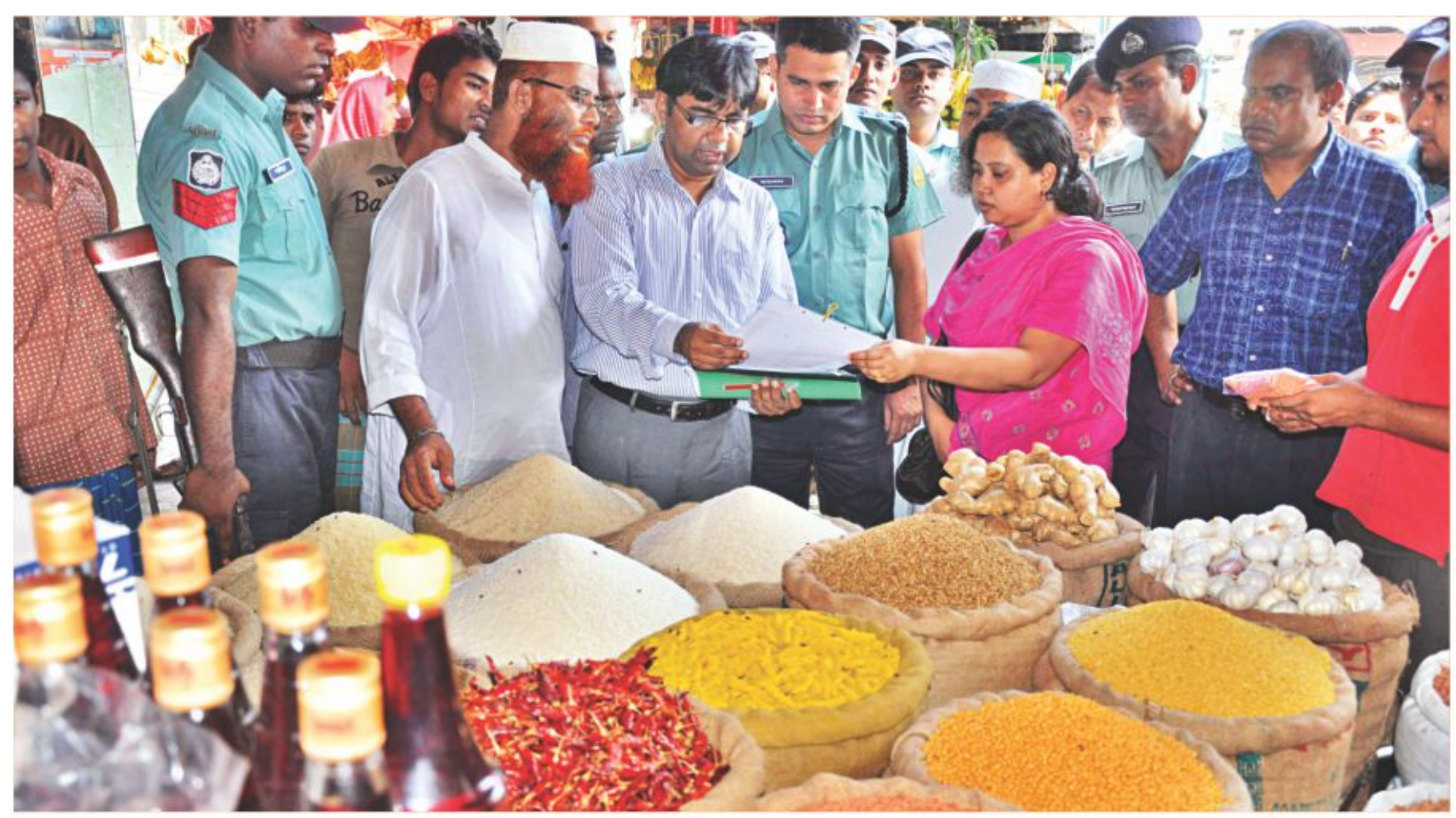
A parliamentary team visits a bazaar in the capital's Mohammadpur yesterday to check if traders are charging extra prices of essentials.

STAFF CORRESPONDENT The government needs to pay more attention to human rights of people in every community as human rights violation amounts to the violation of democracy. European Union Ambassador to Bangladesh William Hanna said this at a seminar in the capital yesterday, also urging the state to protect the rights of indigenous people. SEE PAGE 19 COL 4