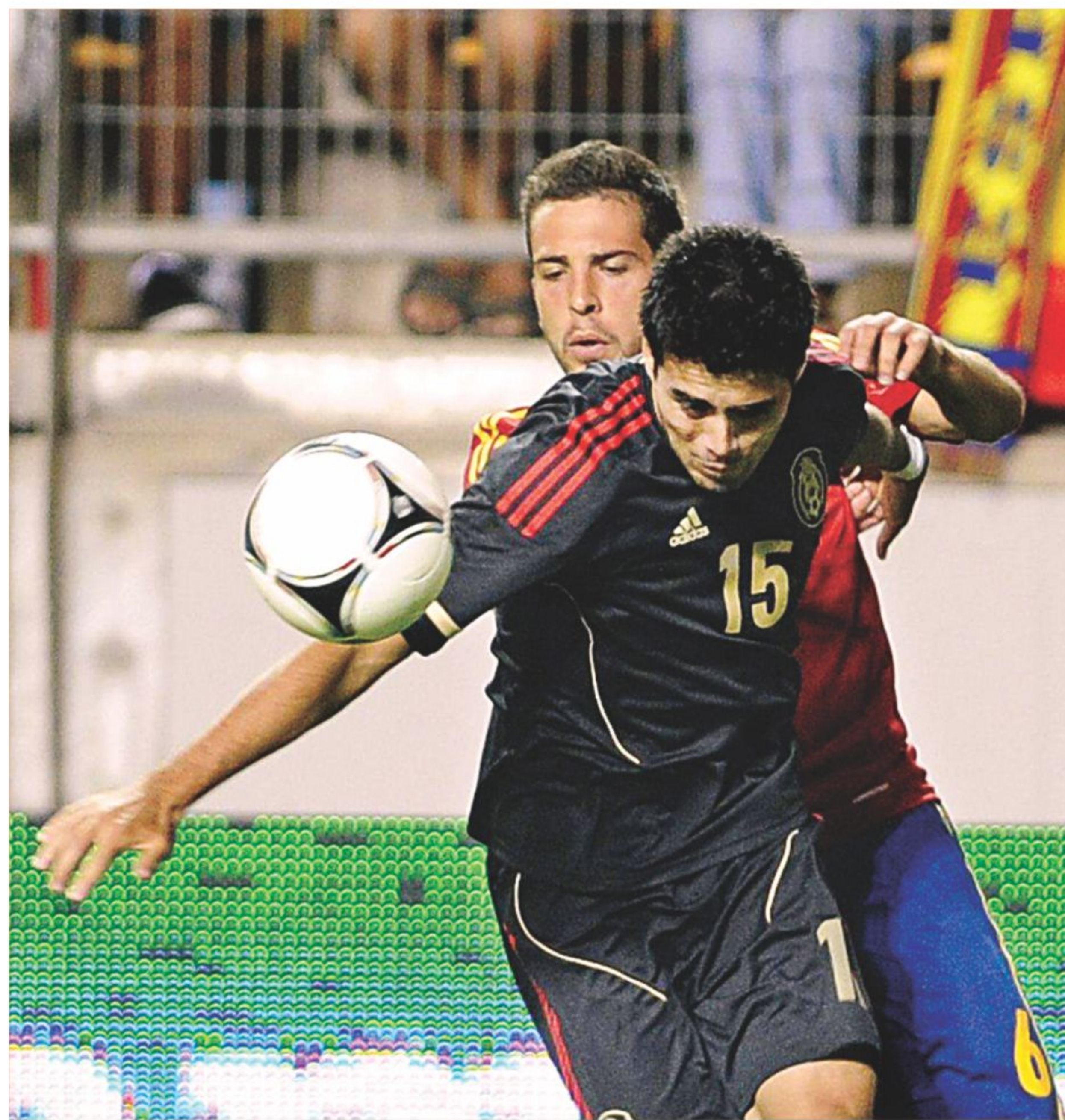
Spain wingback Jordi Alba (R) challenges Mexico defender Diego Reyes during their international friendly before the London Olympics at the Nuevo Stadium on Wednesday. Spain won the match 1-0.

"I'm in favour of him playing," Spain coach Vicente del Bosque said.