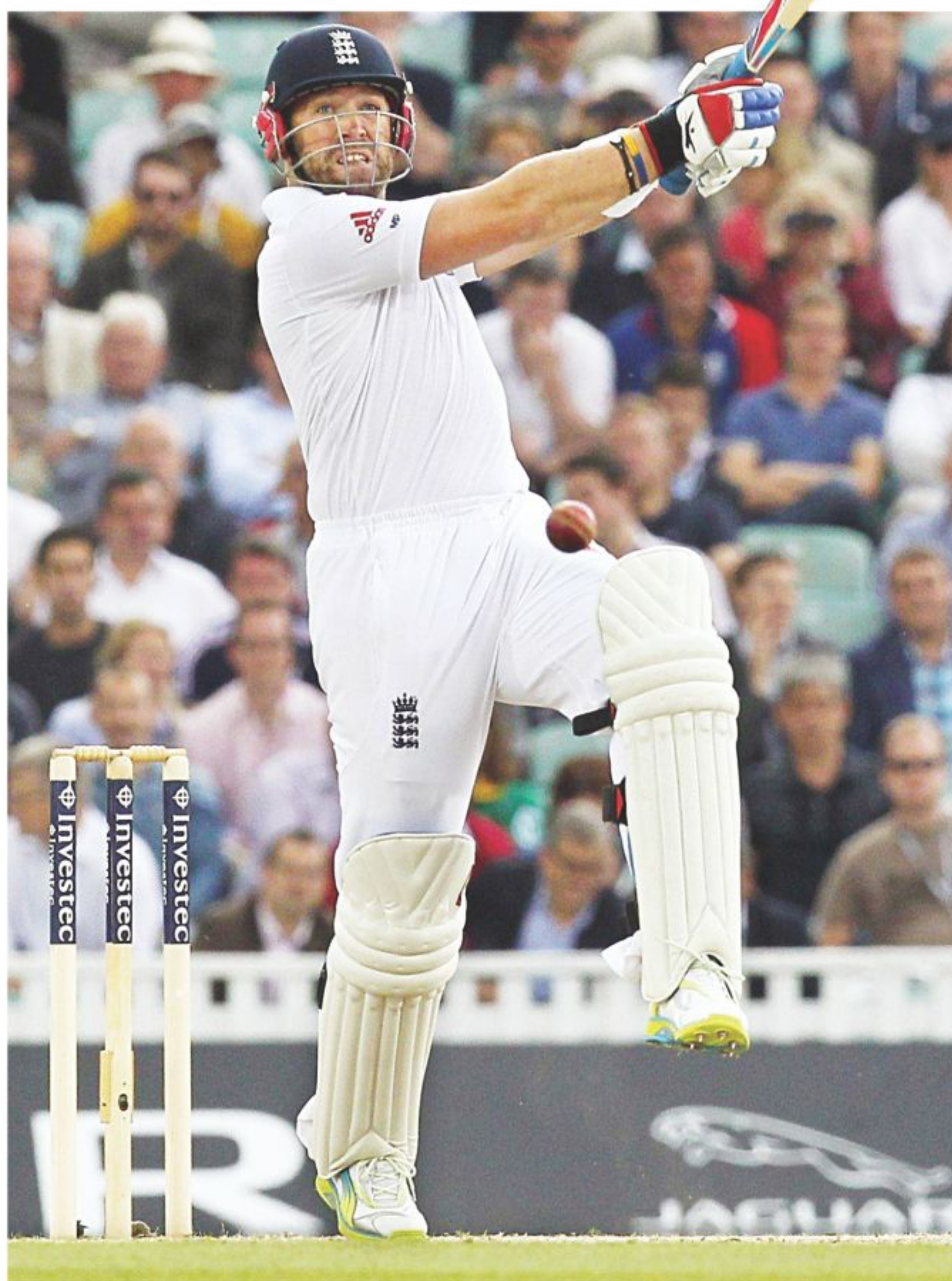
England wicketkeeper Matt Prior plays a square cut on the second day of the first Test against South Africa at The Oval in London yesterday.