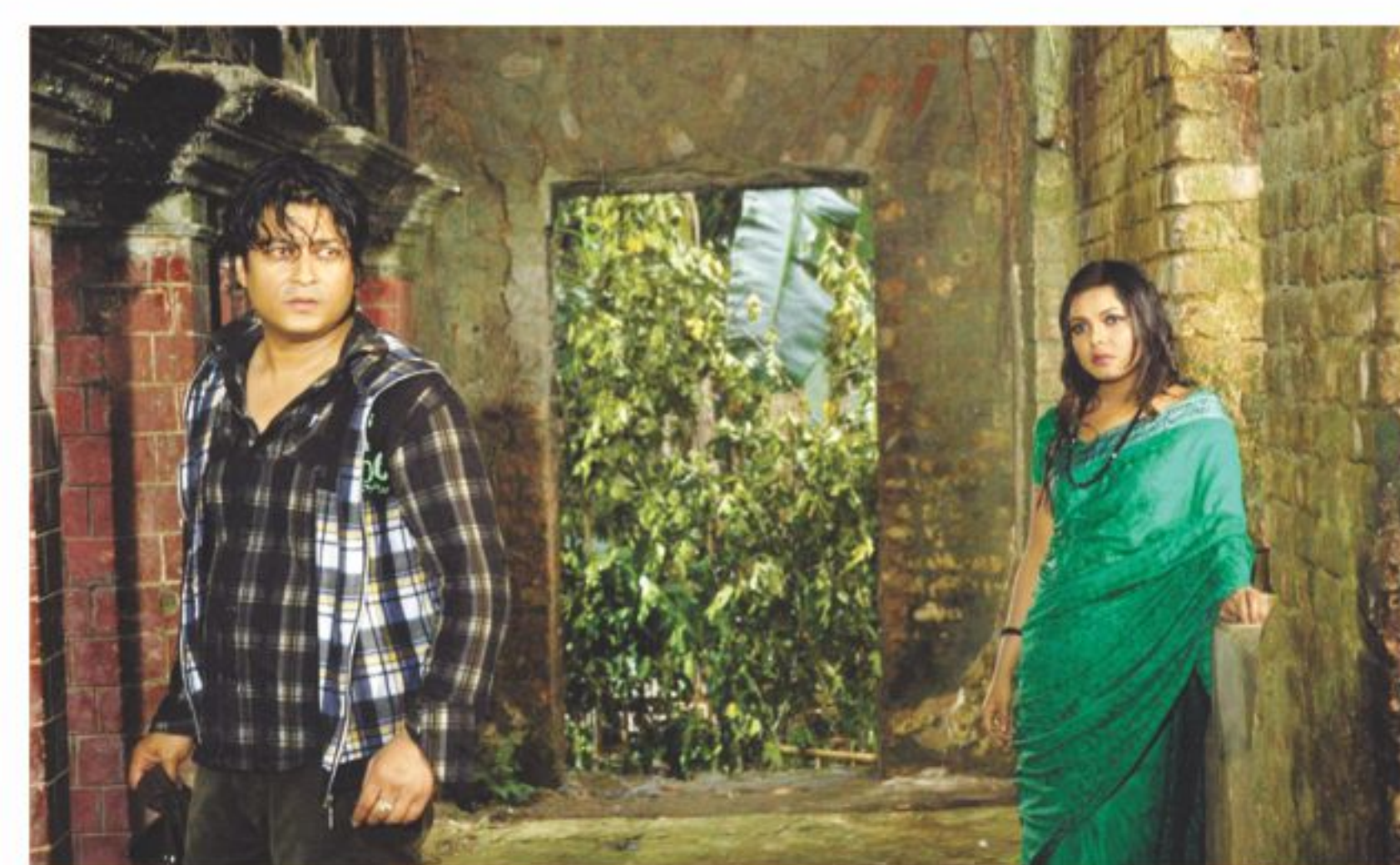
"Amar Achhe Jol"