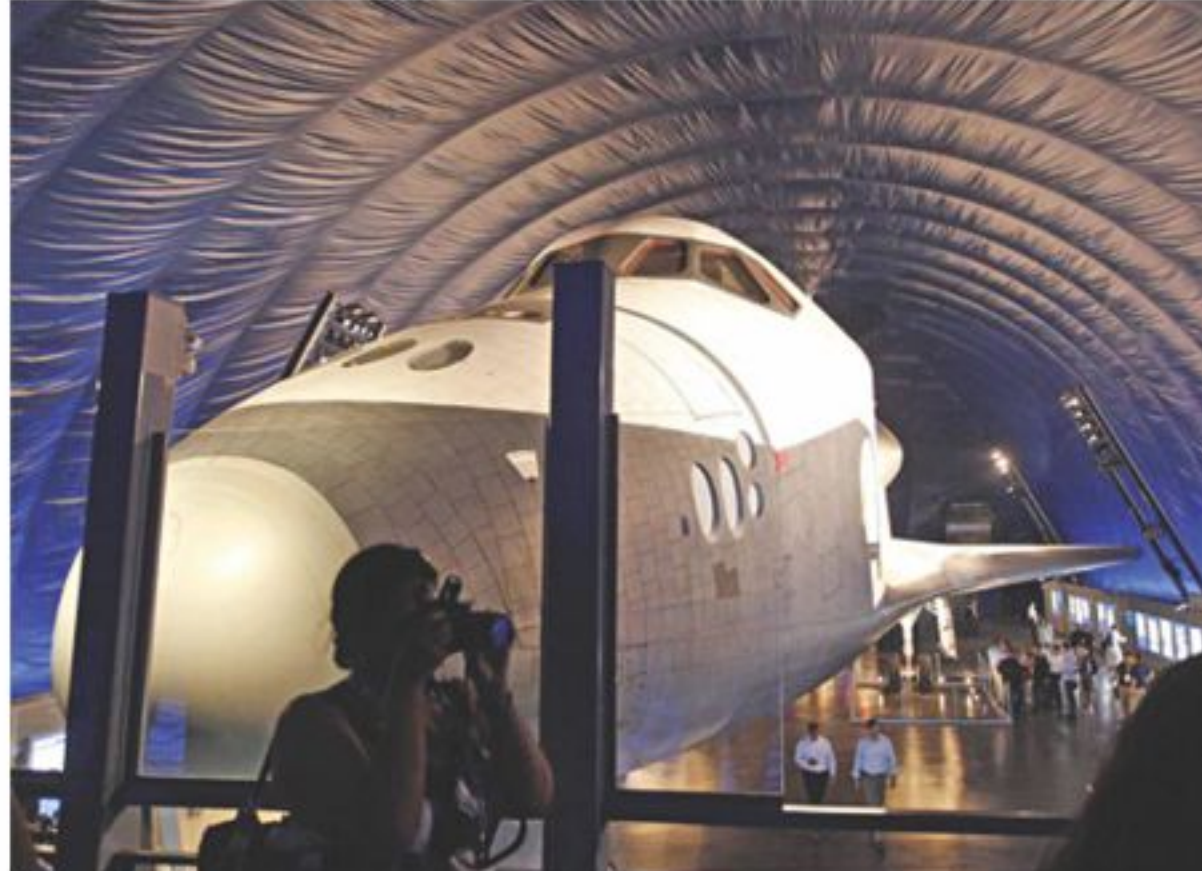
The Space Shuttle Enterprise sits on display at the Sea, Air and Space Museum in New York on Wednesday.

Watch দেশ every Saturday 7.45 pm till Eid