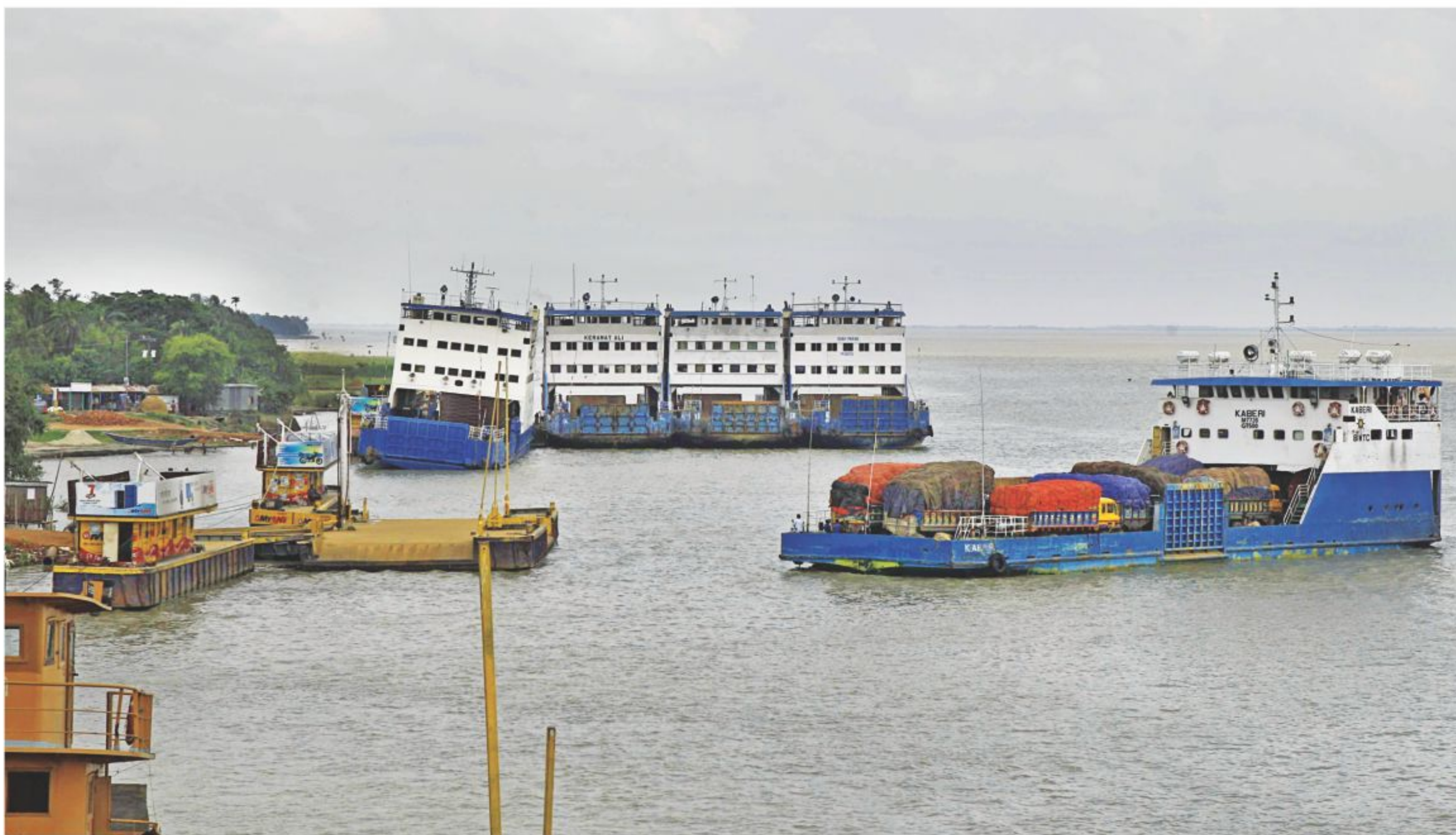
The Daulatdia-Paturia route has plunged into a crisis as four ferries lie idle, awaiting repairs at Paturia terminal. The shortage of ferries results in a huge tailback of vehicles on either side of the Padma. Seven to nine ferries have been operating on the route for decades and they go for repairs more frequently than they should. The photo was taken on Tuesday.