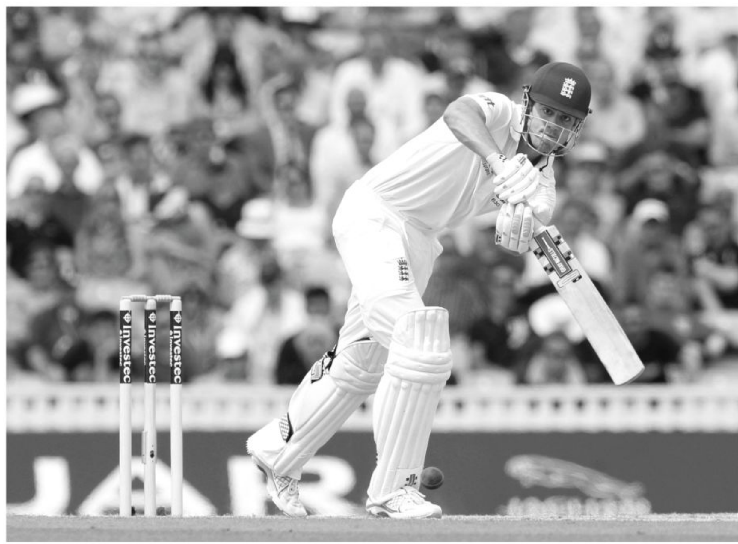
England opener Alastair Cook flicks the ball on the leg side during the first day of the first Test against South Africa at The Oval in London yesterday.

In the day's other match, Shadharan Bima defeated the winless Bangladesh Police 4-0 with Enamul Kabir striking three goals and Harpet Baisal netting the other goal.