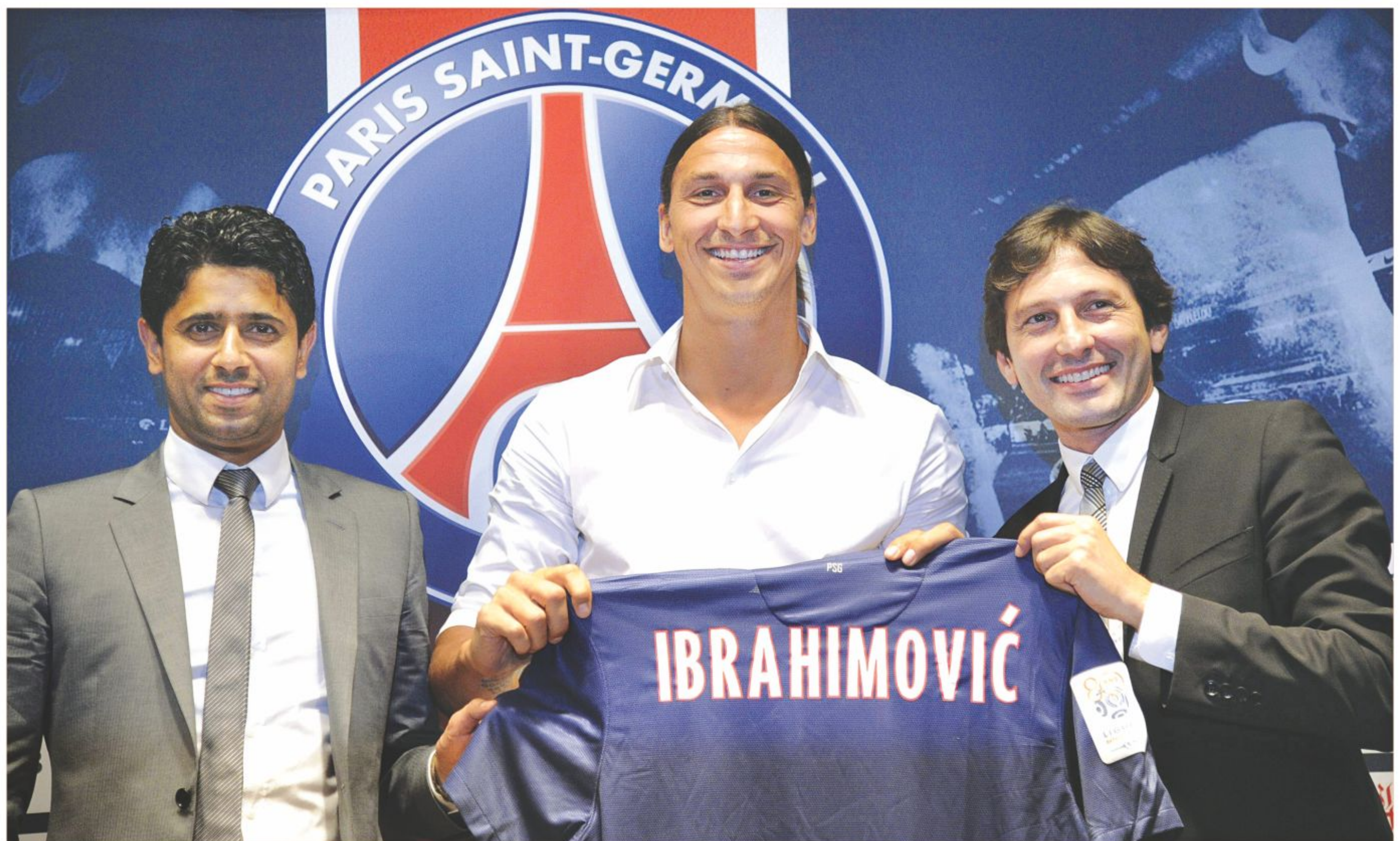
Paris Saint-Germain's latest recruit Swedish superstar Zlatan Ibrahimovic (C) poses with his new jersey next to club chairman Nasser Al-Khelaifi (L) and sporting director Leonardo during a press conference at the Parc des Princes yesterday.

"When I started picking young players, we played Port Vale in a League Cup game and an MP protested to the government, saying we were cheating the public and they wanted their money back."