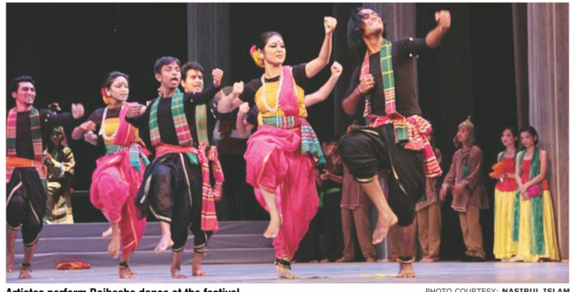
Artistes perform Raibeshe dance at the festival.