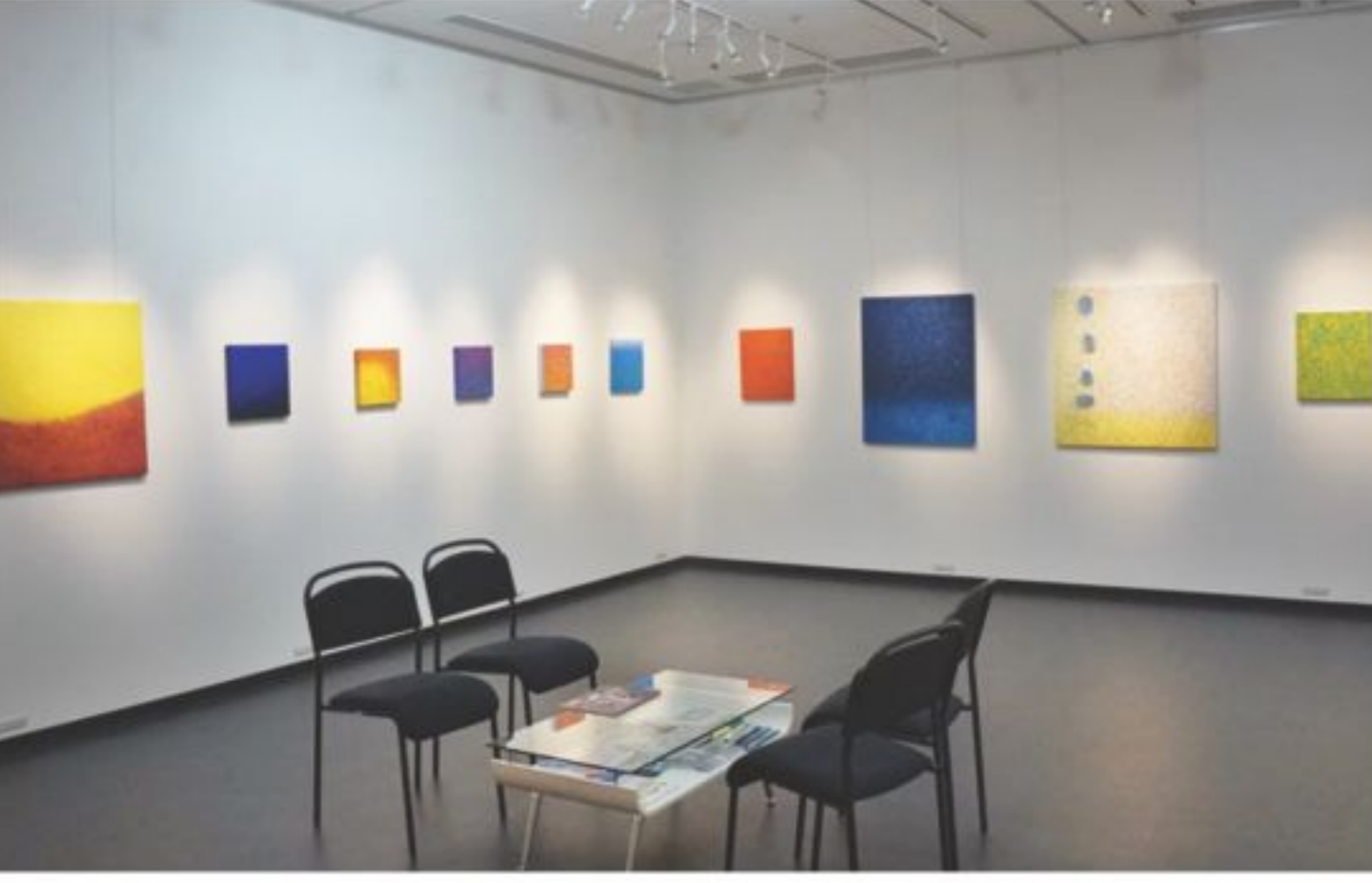
Paintings displayed at the gallery.