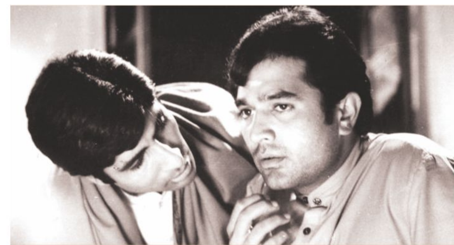
Rajesh Khanna (right) with Amitabh Bachchan in "Anand".