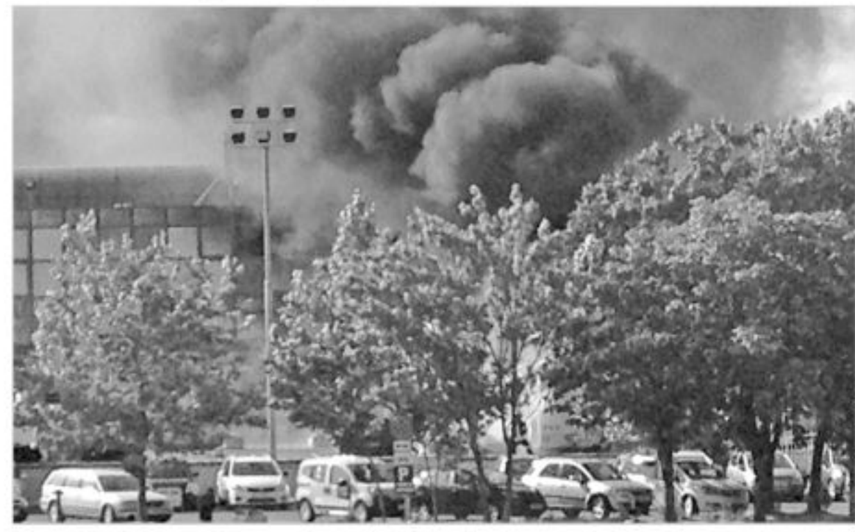
A picture shows smoke rising over Bourgas airport yesterday following the blast.

AFP, Sofia At least six people were killed and many more wounded yesterday in an attack on a bus packed with Israelis at a Black Sea airport in Bulgaria that the government in Israel blamed on arch foe Iran.