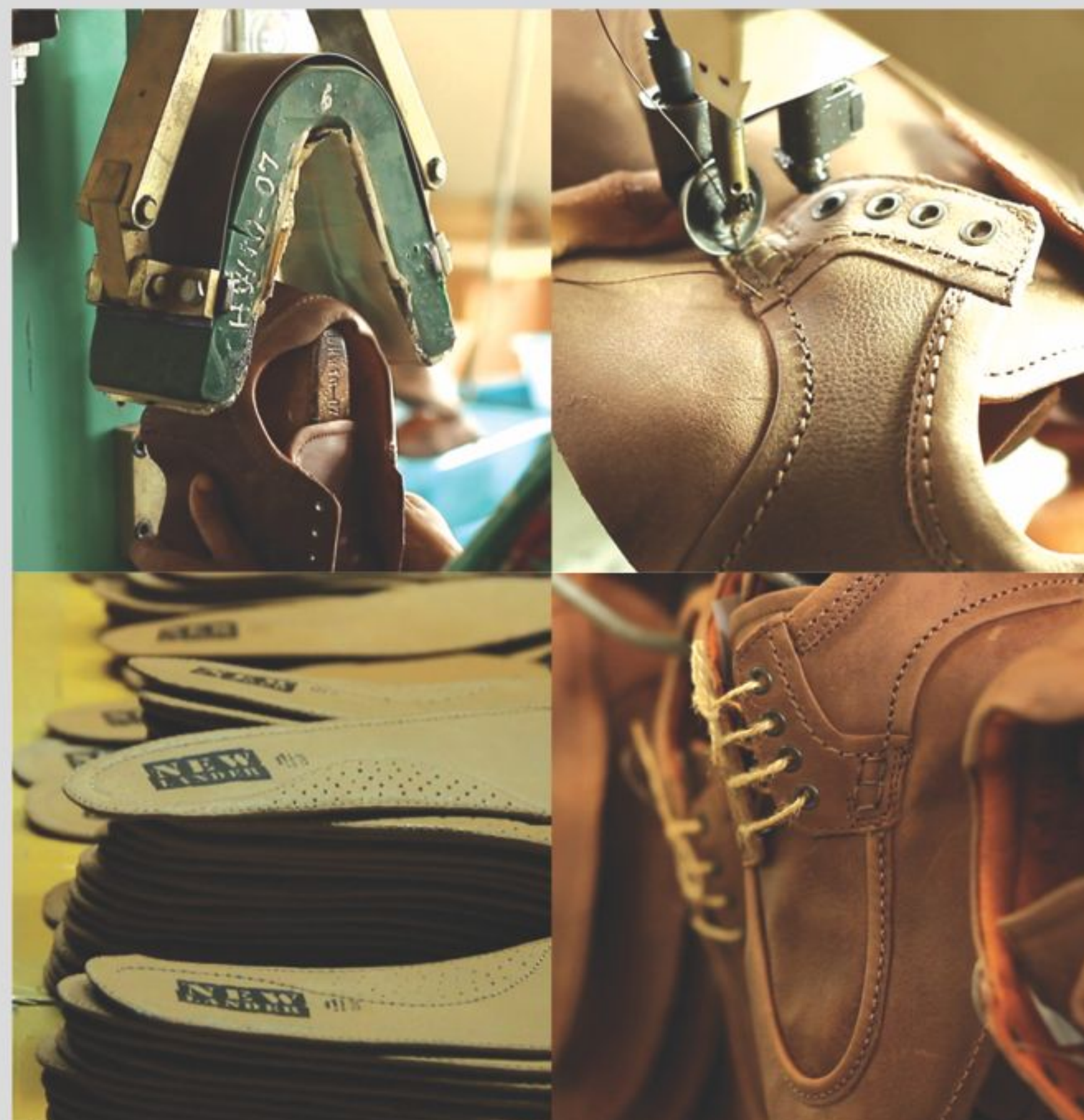
Bay Footwear - a combination of style and comfort

implementing backward linkages to its production process with Bay Tanneries Limited and Bay Rubber Limited. With a dedicated and skilled workforce, the company has established progressive HR practices with a particular focus on female employee participation and empowerment. Its dedicated management team and committed employees will help Bay Footwear Limited to emerge as a major player in the leather product export industry in the coming years.