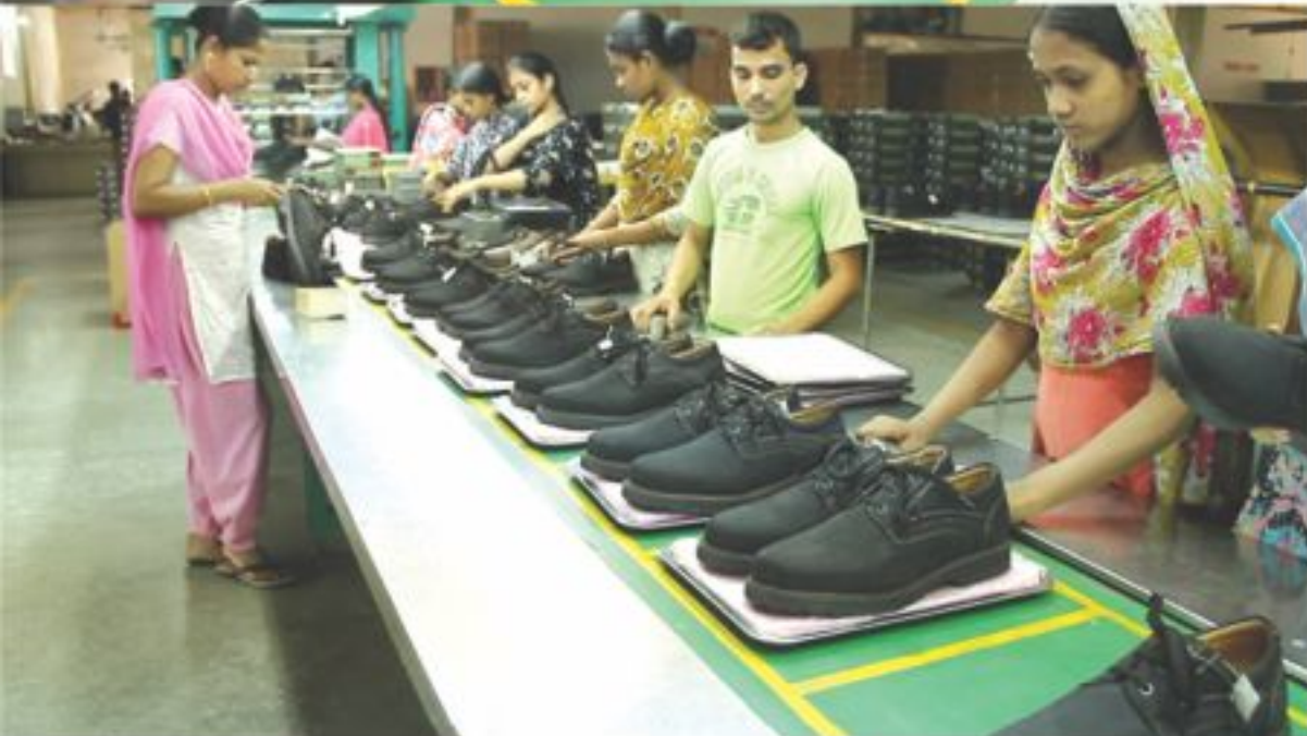
Vertical integration in production process