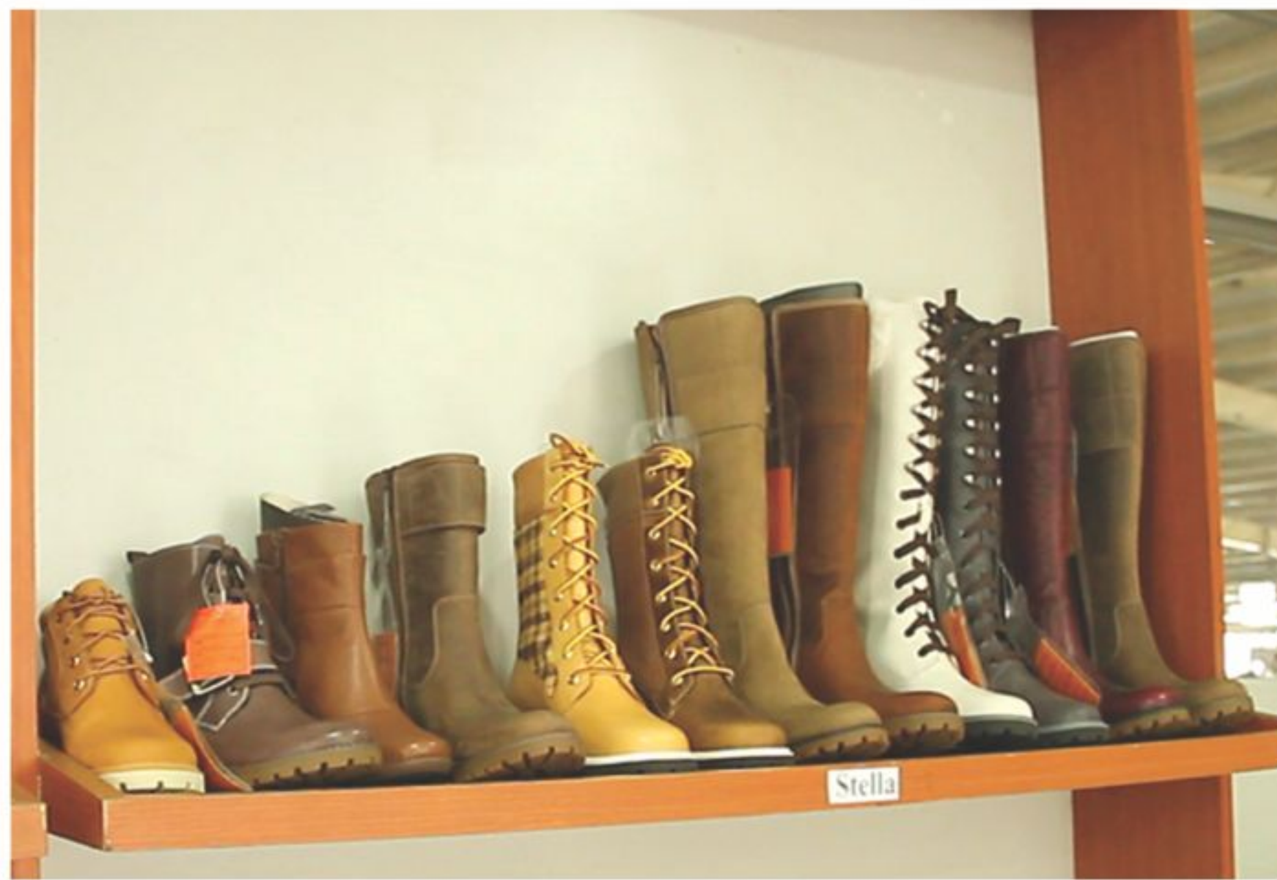
High quality export products of Bay Footwear Limited