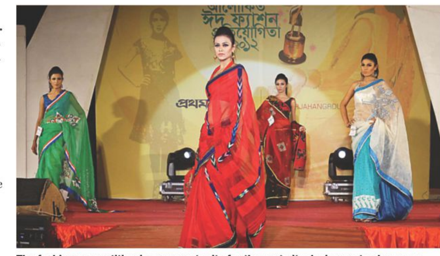
The fashion competition is an opportunity for the port city designers to showcase their innovative works.