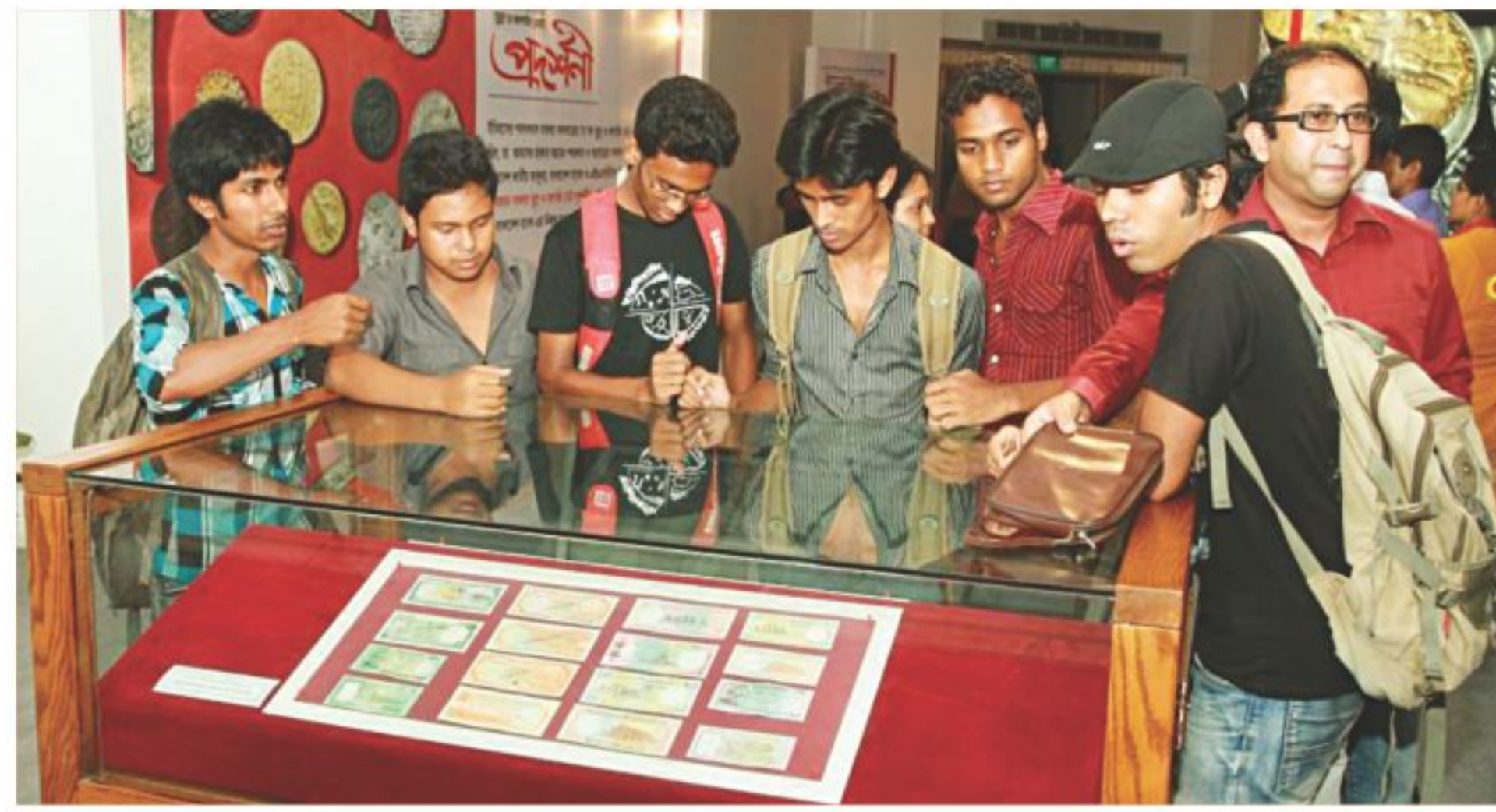
The exhibition showcases a wide array of coins and notes issued across different phases of history.

A carefully selected collection of coins and paper notes from the exclusive archives of Bangladesh National Museum and Bangladesh Bank are being displayed at this exhibition. HSBC, a co-organiser of this programme, has its own history entwined with currency -- the bank being an official currency issuer across various economies of the world, including New York, Hong Kong, Shanghai, British Malay, Philippines, Japan and Thailand -- at different points in time.