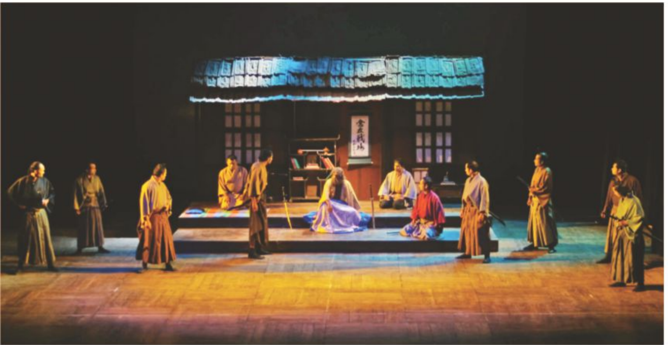
"Eksho Bosta Chal" is a joint production by Shilpakala Academy and Japanese Embassy.

Bangladesh Shilpakala Academy's award-winning samurai play "Eksho Bosta Chal" as well as Theatrewala Repertory production "Shylock and Sycophants" are about to have their 50th shows. The landmark show of "Eksho Bosta Chal" will be staged this evening at the National Theatre Hall of Bangladesh Shilpakala Academy, while "Shylock and Sycophants" will touch the important milestone tomorrow at the Experimental Theatre Hall of the academy.