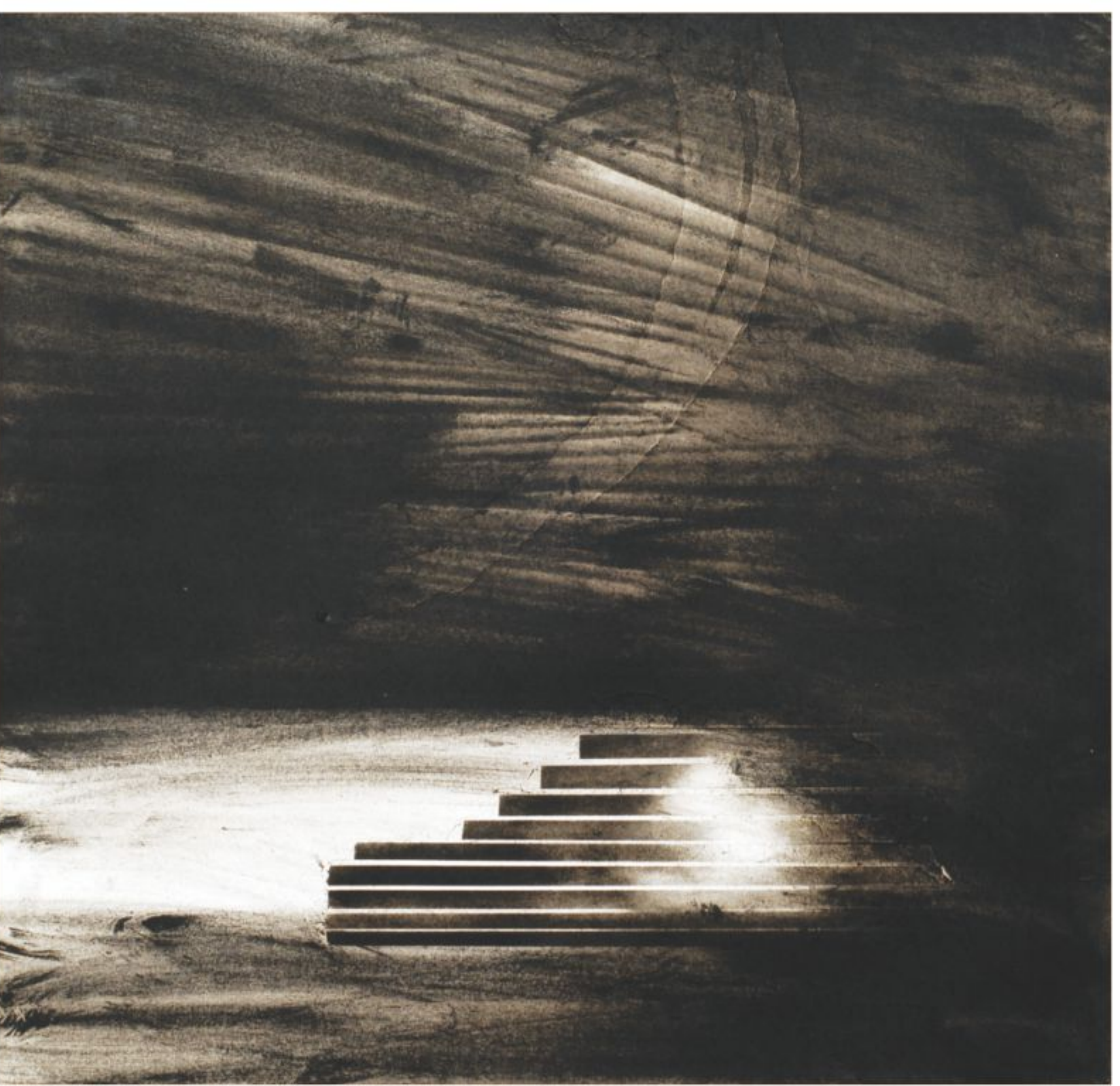
The arrangements of enormous dots and geometric forms create a sense of aestheticism.