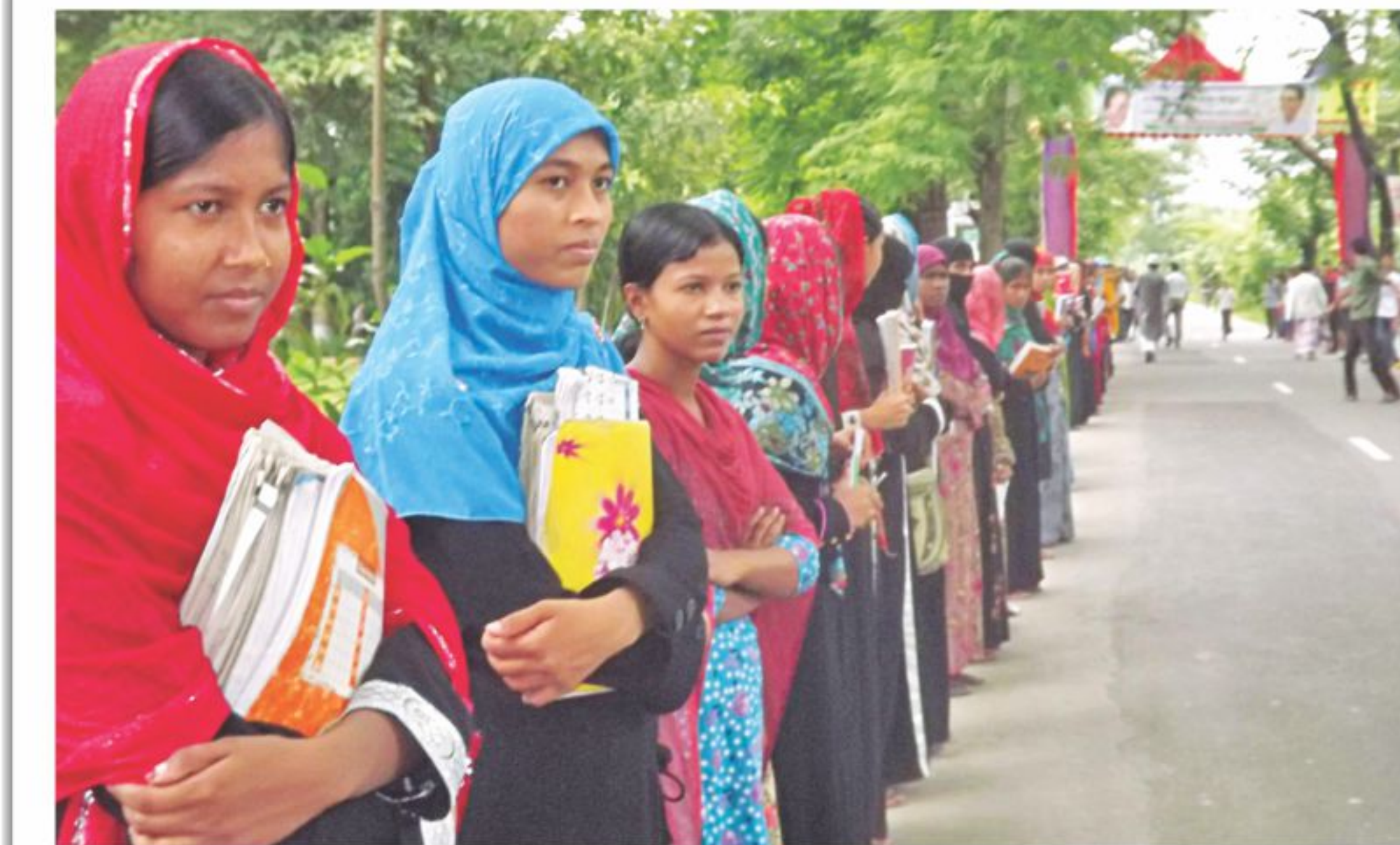
A section of students of all the educational institutions at Char Fasson in Bhola who queued up along the road and their teachers went to attend a meeting of the local elite with Home Minister Shahara Khatun, suspending classes and examinations yesterday.