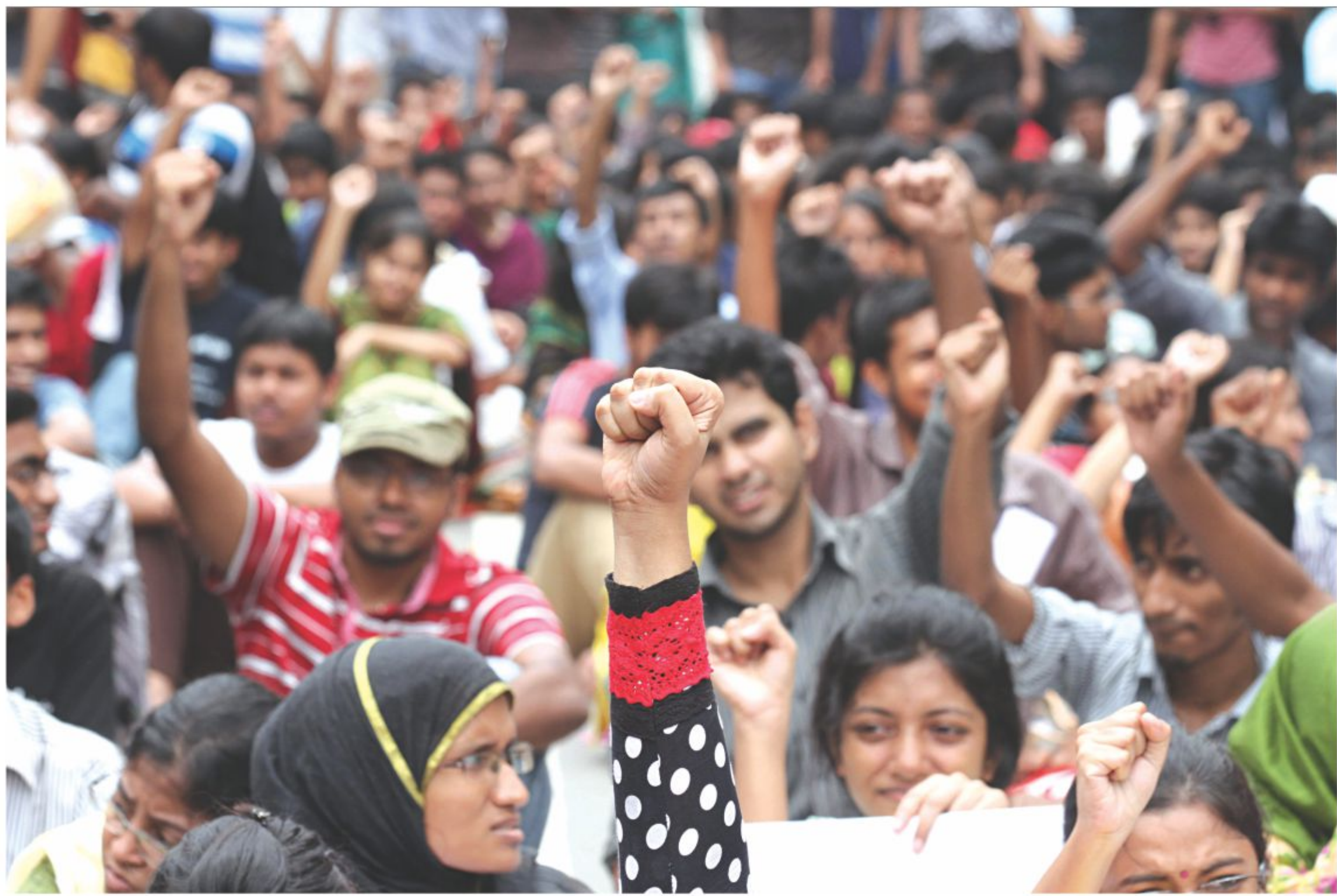
Anti-VC agitators of Buet at the gate of Dhaka University central playground yesterday vow to continue their movement until their demands are met.