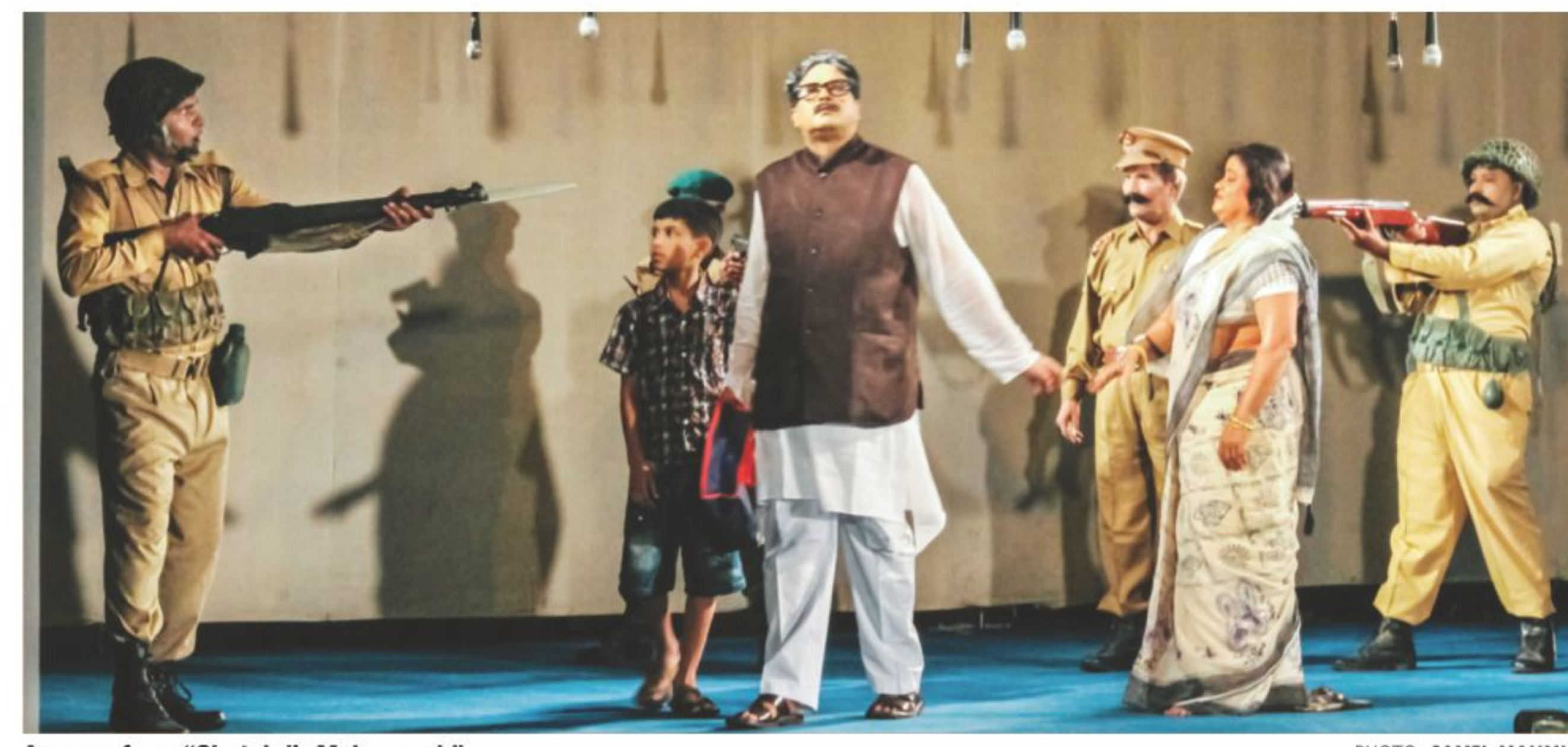
A scene from "Shatabdir Mahanayak".