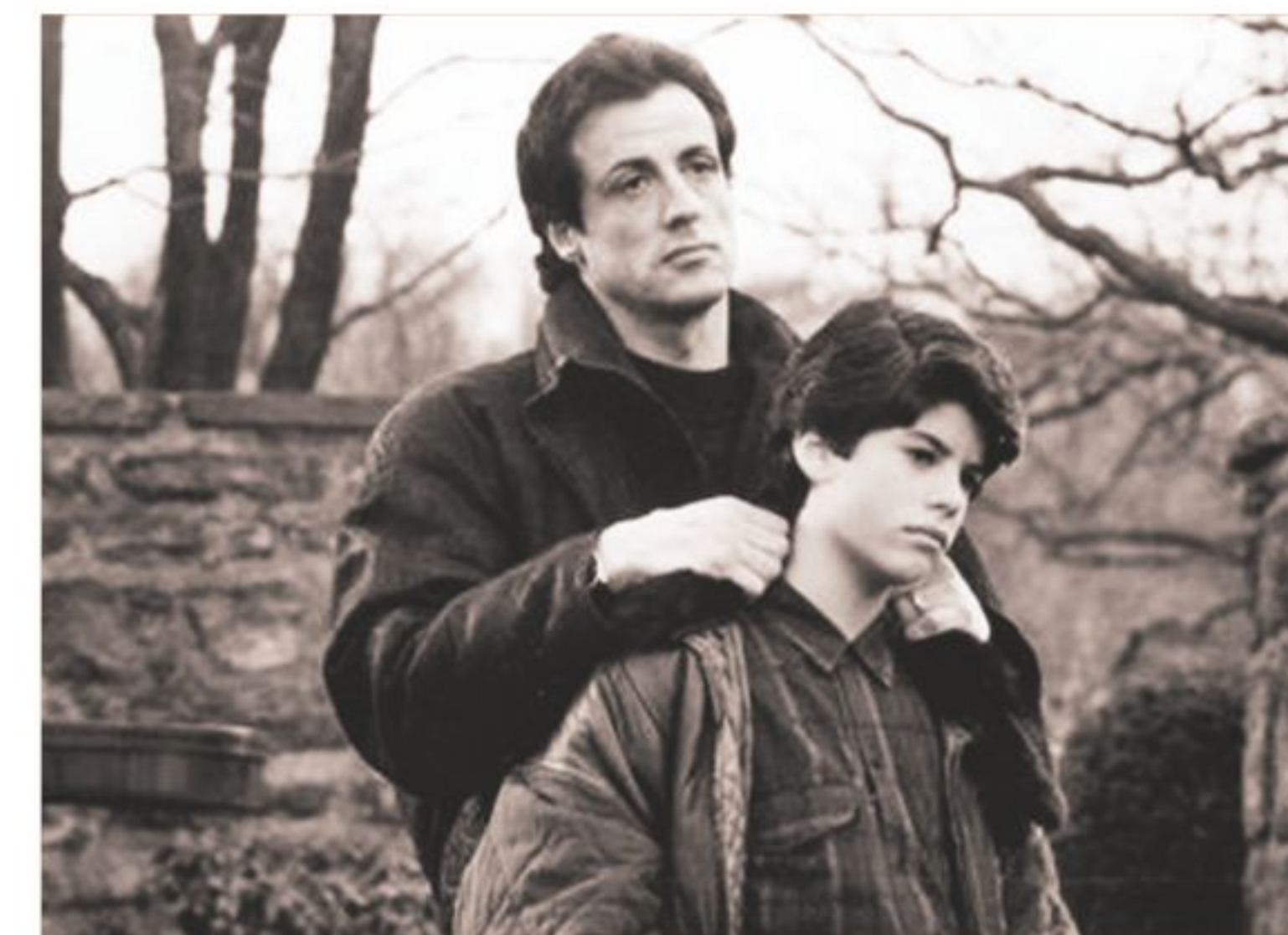
Sylvester Stallone portrays Rocky Balboa in a scene with his real life son, Sage Stallone, who portrays Rocky Balboa Jr., in the 1990 film "Rocky V".