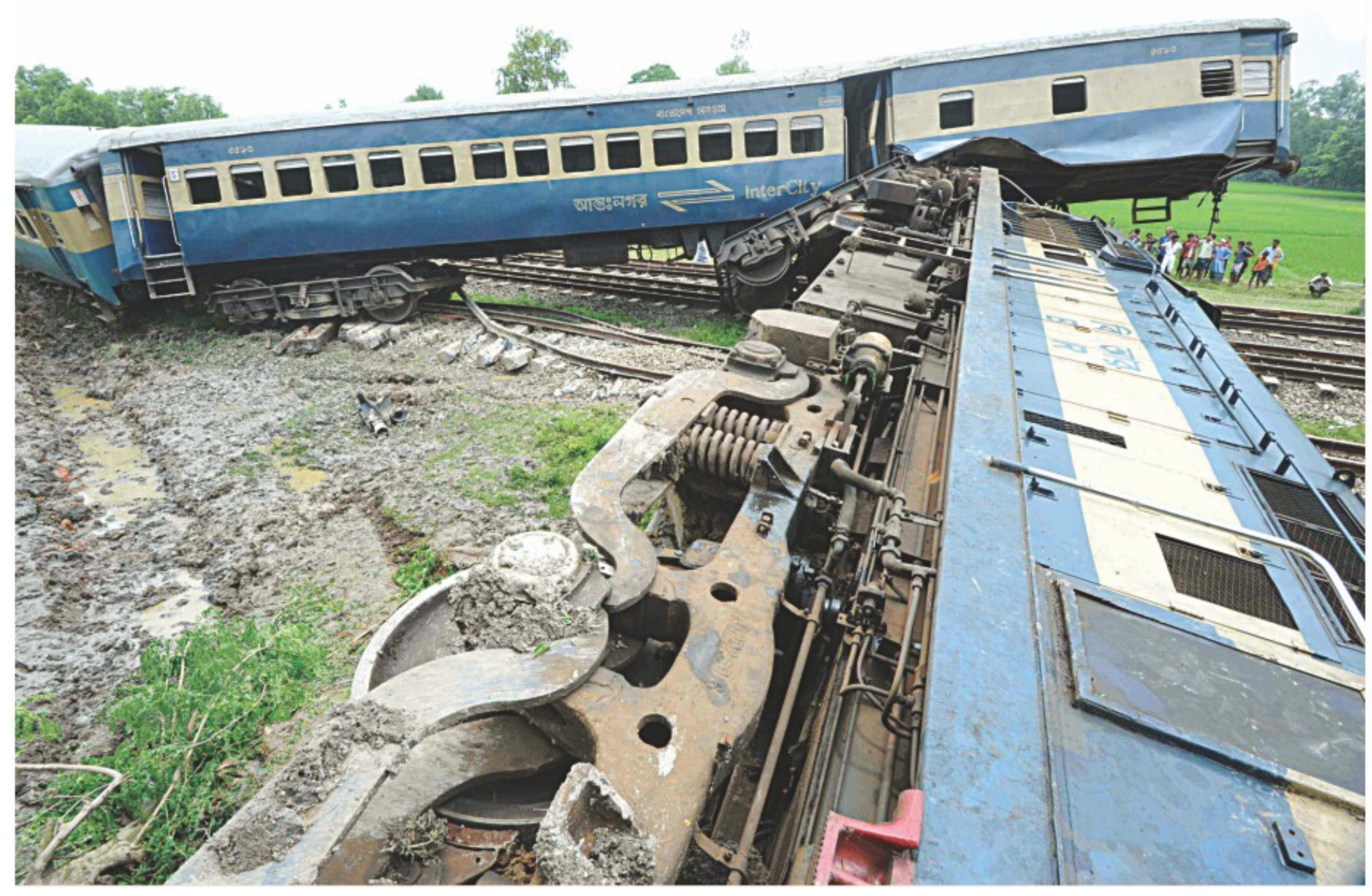
The Sundarban Express derailed near Gazipur Railway Station yesterday disrupting railway communication between Dhaka and the west and Mymensingh for almost six hours.

The Bapex chief expects the gas pressure would reach up to 2,700 psi SEE PAGE 19 COL 5