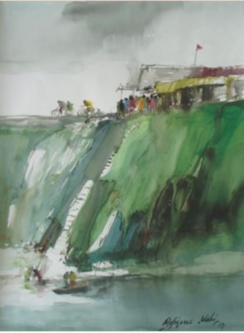
A watercolour by Rafiqun Nabi

The paintings from the workshop featured riverine life, tides of the river, transport in river, people living in