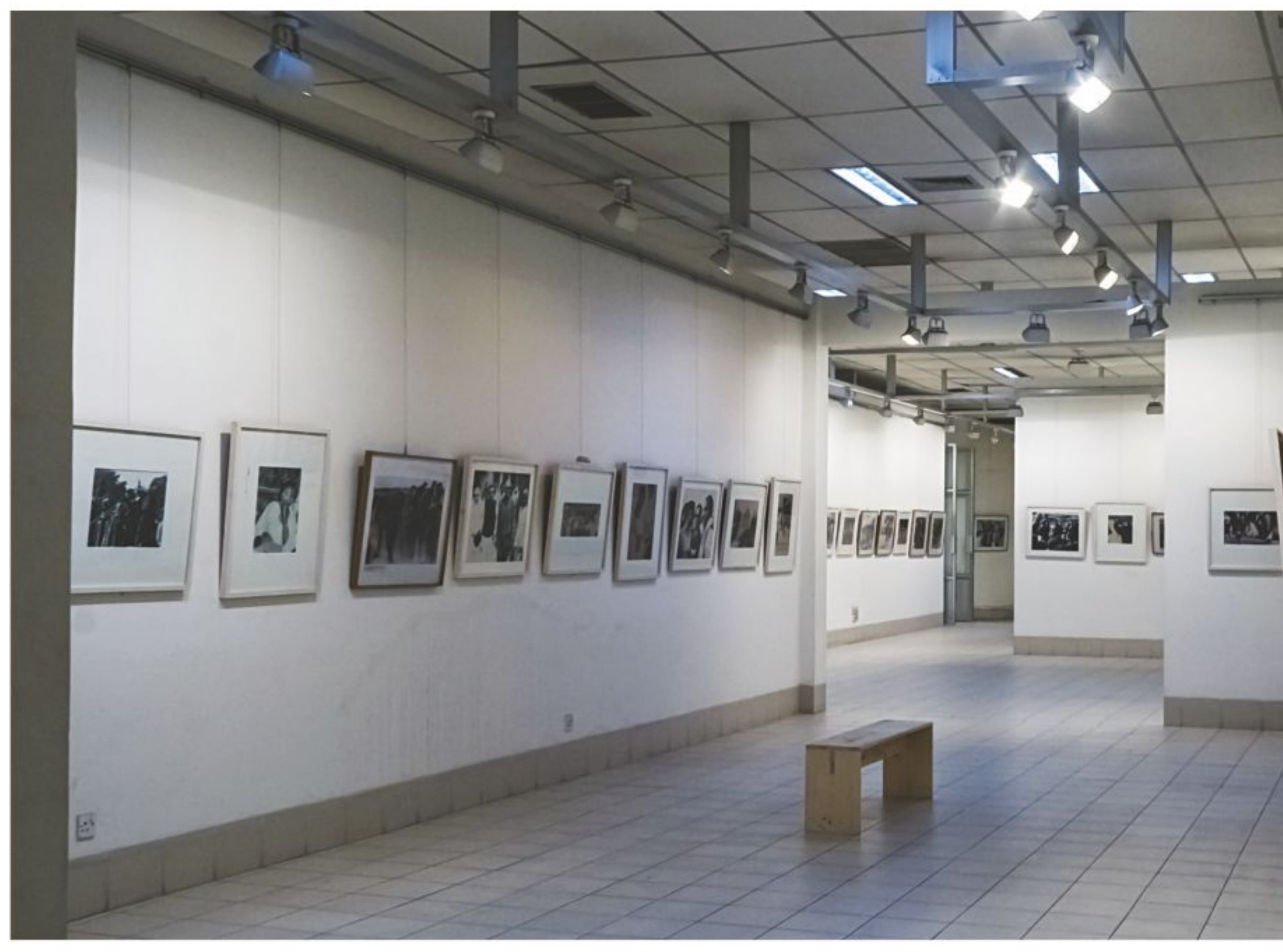
Featuring a few hundred photos and artworks, the exhibition showcased some rare images as well as thematic artworks.

Fragmented moments from the Liberation War, the aftermath of the political upheaval as well as portraits of and vignettes from the life of Bangabandhu Sheikh Mujibur Rahman were the themes. Bangabandhu's portraits were highlights, while some abstract paintings upholding the spirit of the war were on display.