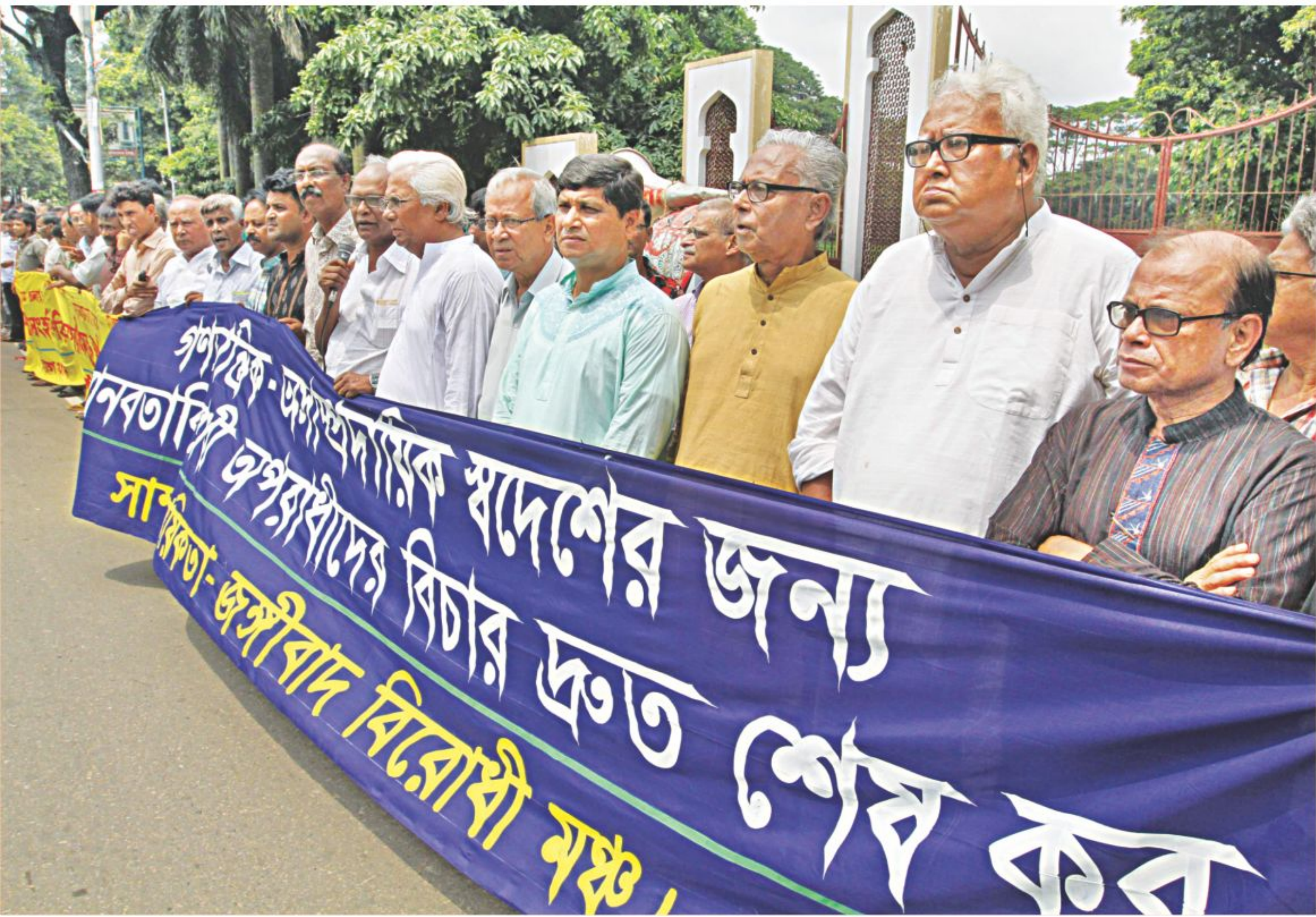
Shamprodayikota-Jongibad Birodhi Mancha forms a human chain in front of Jatiya Eidgah Maidan, near the High Court, in the capital yesterday demanding speedy trial of war criminals.