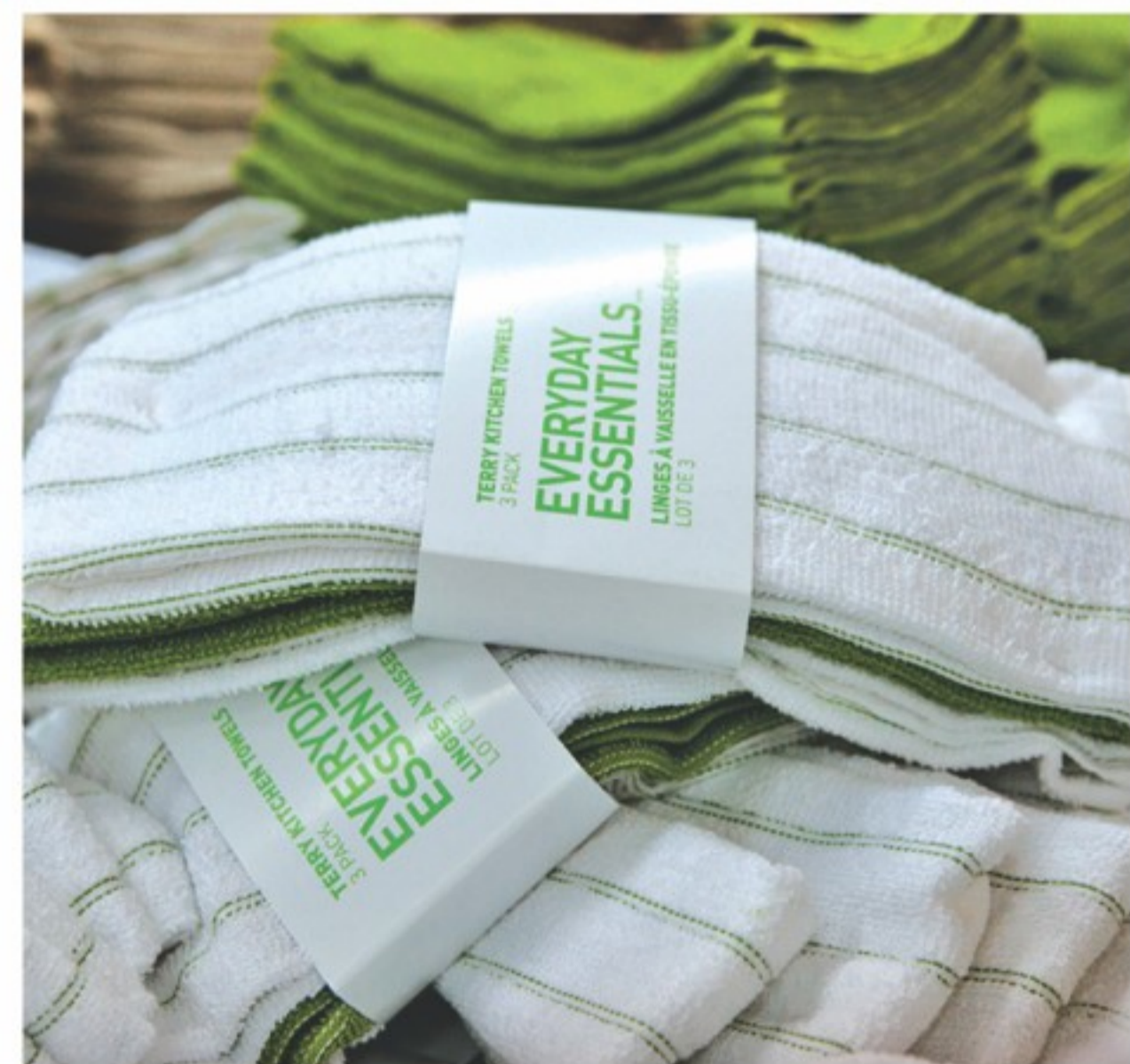
World-class terry towel products exported by Qualitex Group