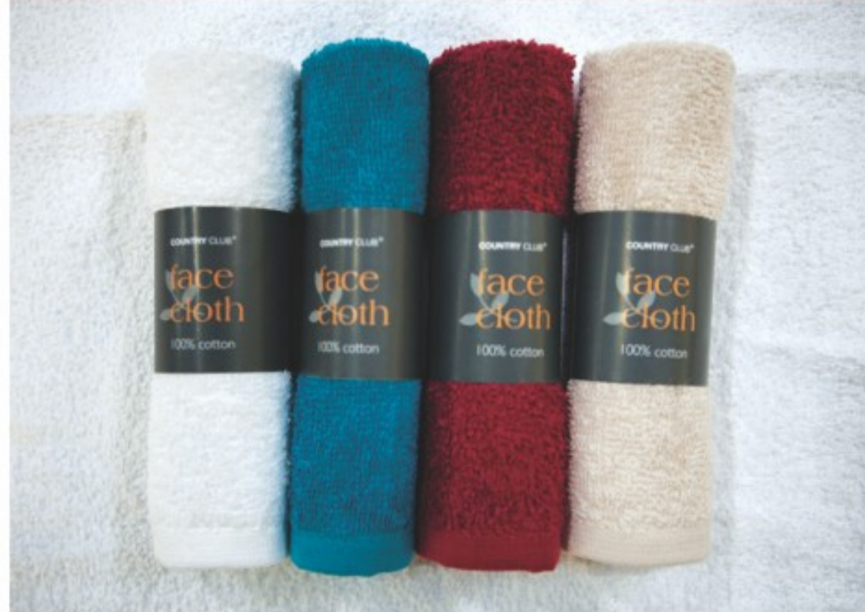
A diverse product portfolio - suitable for a wide range of needs