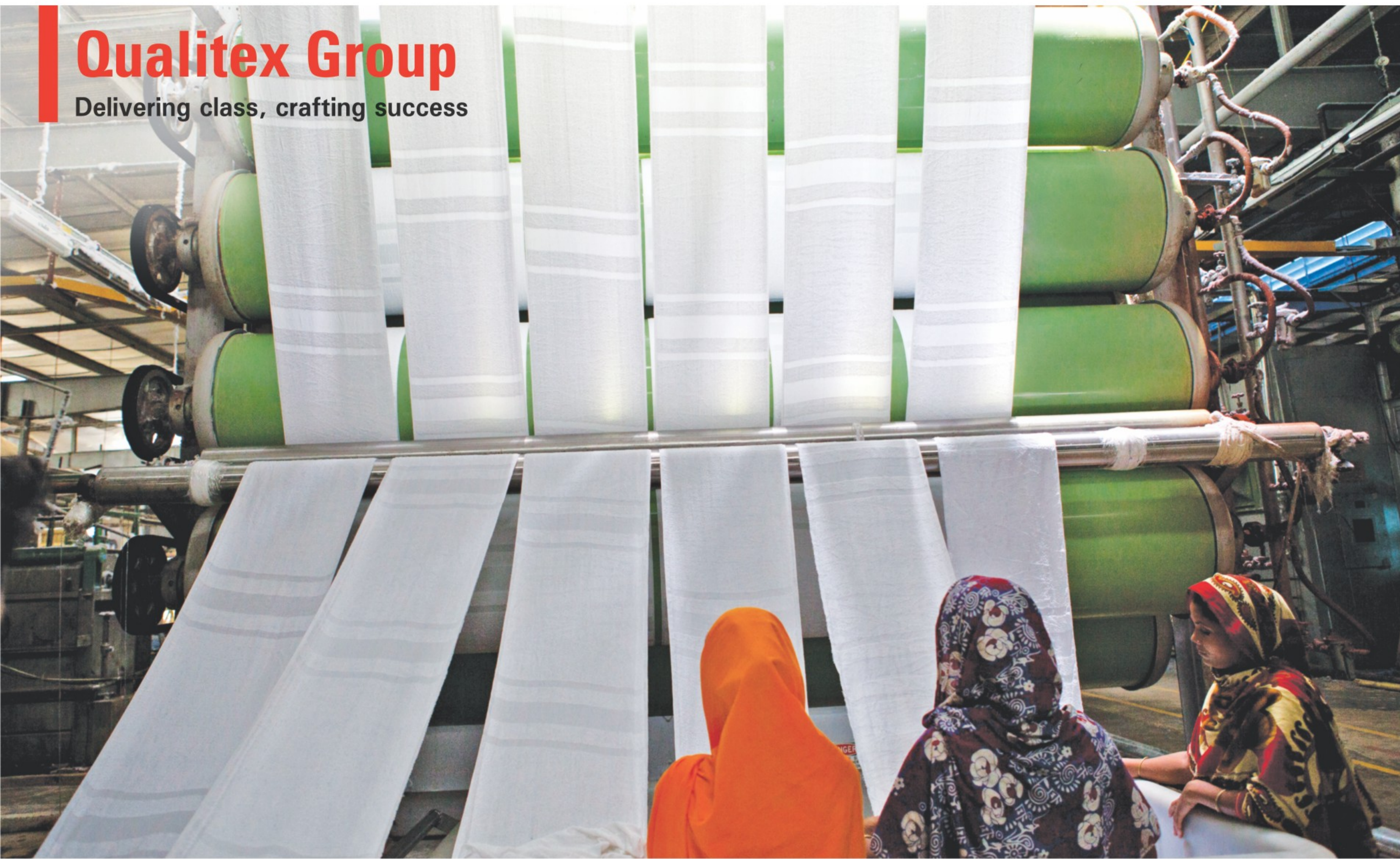
Employees working at full pace at the factory premises