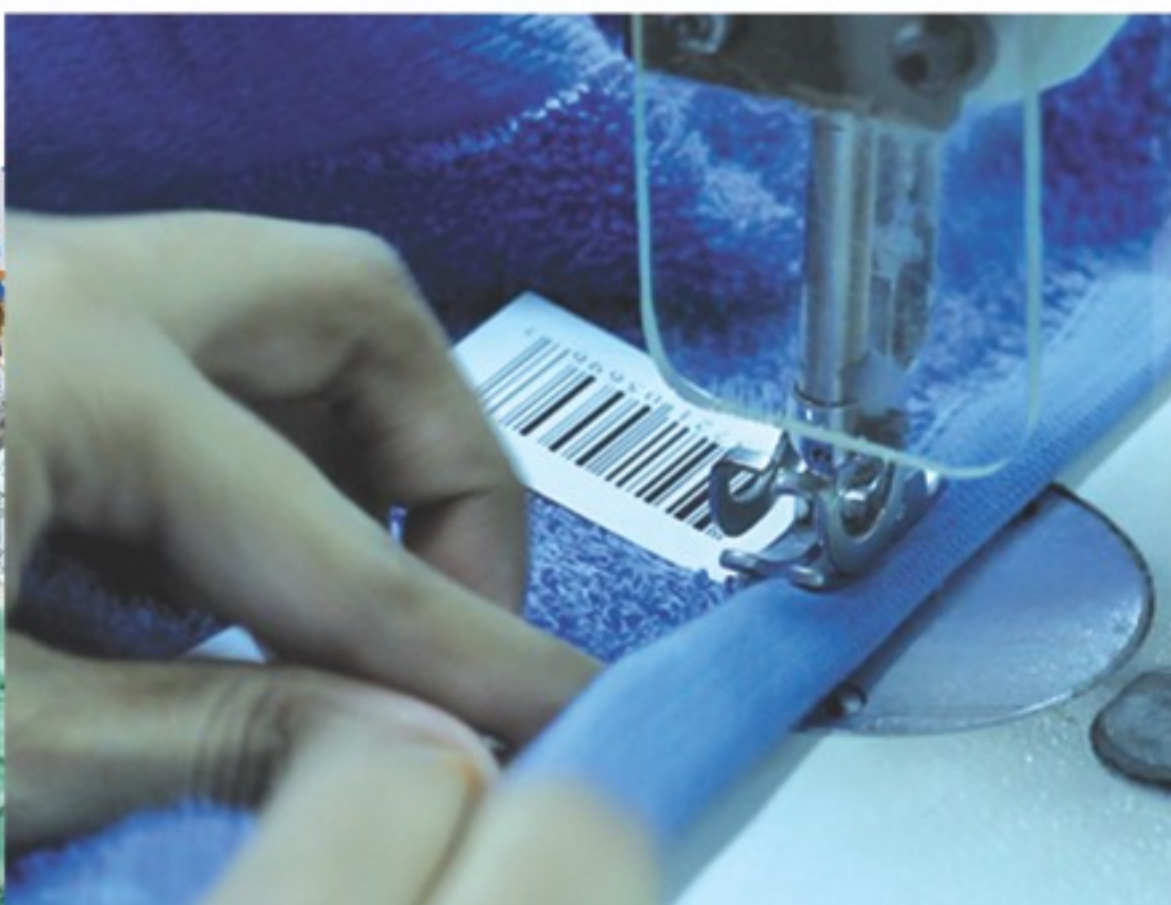
Technological innovation - the core of Qualitex Group's excellence