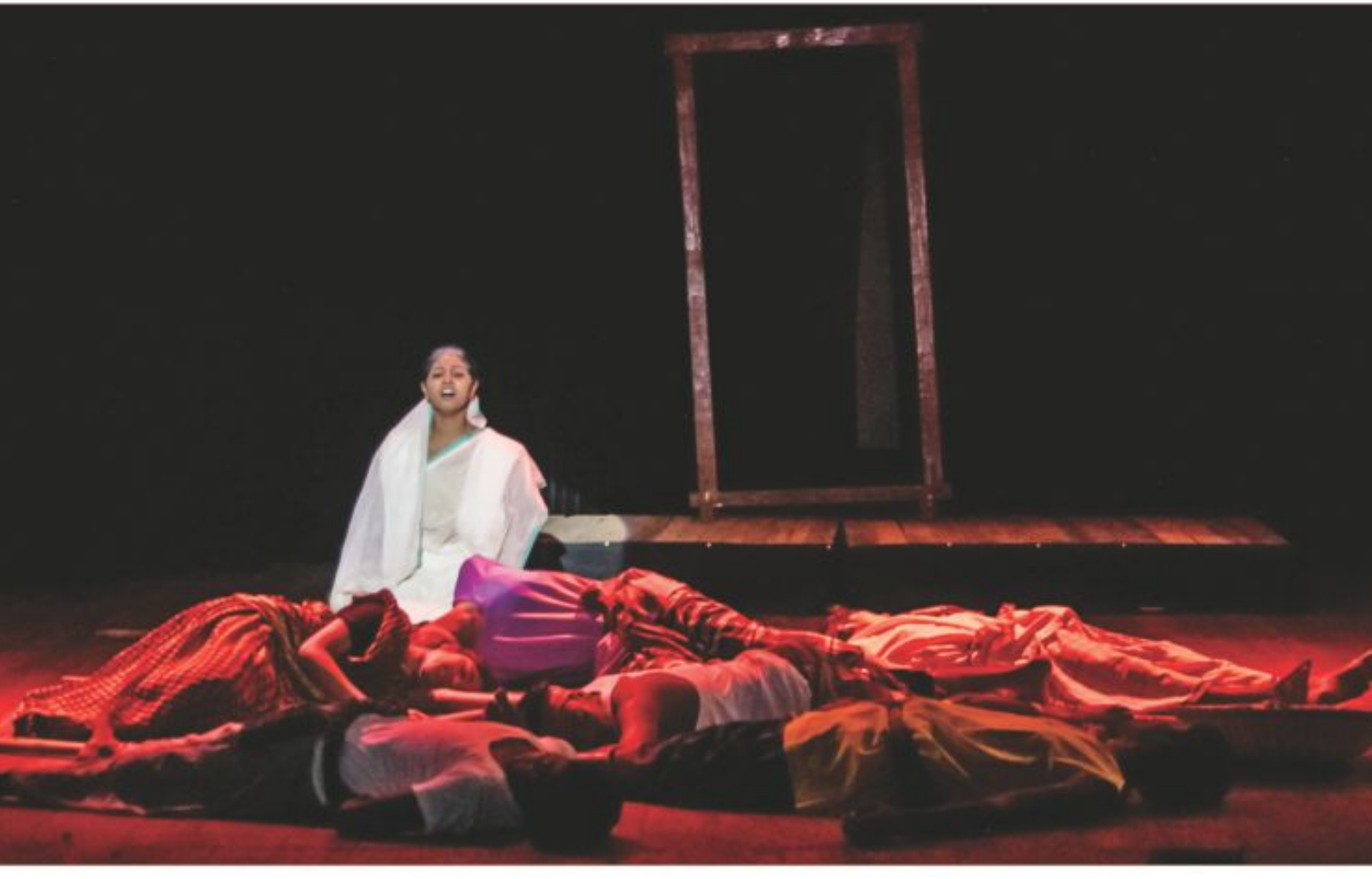
"1971" and "Smriti '71" (right) chronicle the War time atrocities.

Bangladesh Shilpakala Academy in association with Bangladesh Group Theatre Federation has arranged the two week-long festival that features over 100 plays on the theme of Liberation War.