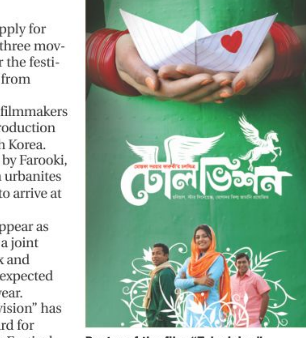
Poster of the film "Television".

It should be mentioned that "Television" has received the Asian Cinema Fund award for script development at the Pusan Film Festival.