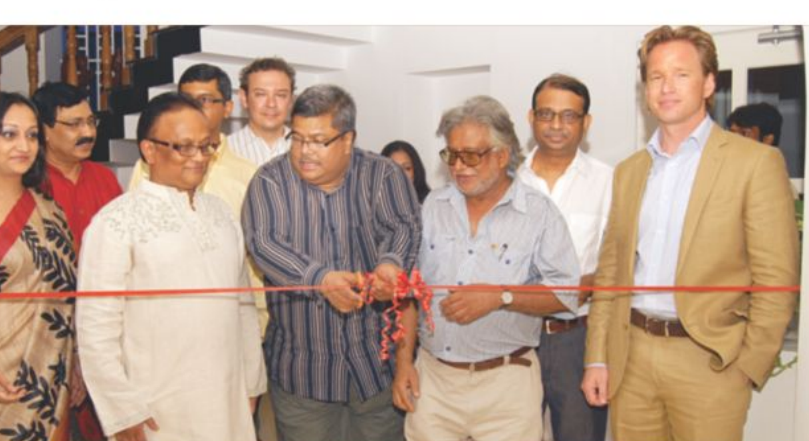
Guests at the inaugural ceremony.

The exhibition has brought together a number of prominent and budding artists to promote interaction and initiate a creative dialogue between artists and art aficionados