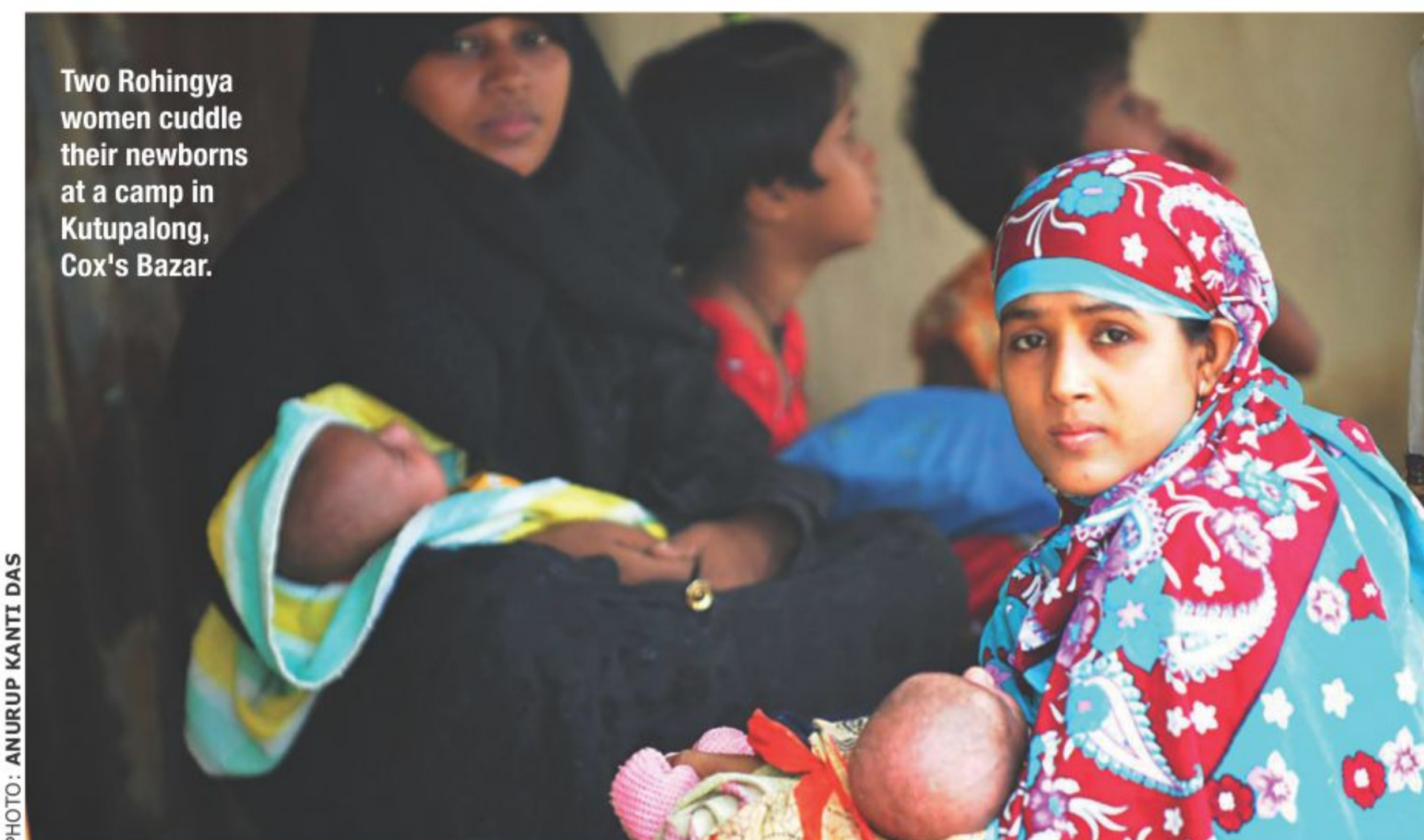
Two Rohingya women cuddle their newborns at a camp in Kutupalong, Cox's Bazar.

A three-day conference of deputy commissioners (DCs) will begin in the capital tomorrow, with law and order, prices of essentials, land management and strengthening local government bodies high on the agenda. Prime Minister Sheikh Hasina will inaugurate the