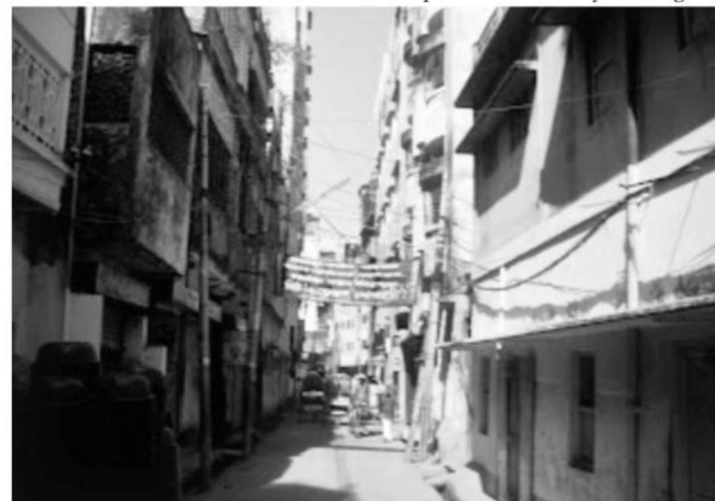
Narrow gaps between buildings and no greenery

result in increased temperature and consequently increased need for cooling. They also reduce the ability of a building to employ natural ventilation by blocking wind. Often closely spaced buildings reduce the penetration of daylight in a building, requiring artificial lighting, even on a clear sunny day. This is unfortunate when the country is blessed with adequate sky illumination 20,000-30,000 lux on an average day and up to 120,000 lux on bright cloudless days. The typical requirement for an office environment is between 300-500 lux, almost 100 times less than what is available and we still need to consume electricity for lighting during the day. Apparently, when illumination-poor countries in the Western Europe are developing ways to bring more natural light indoors we seem to be going