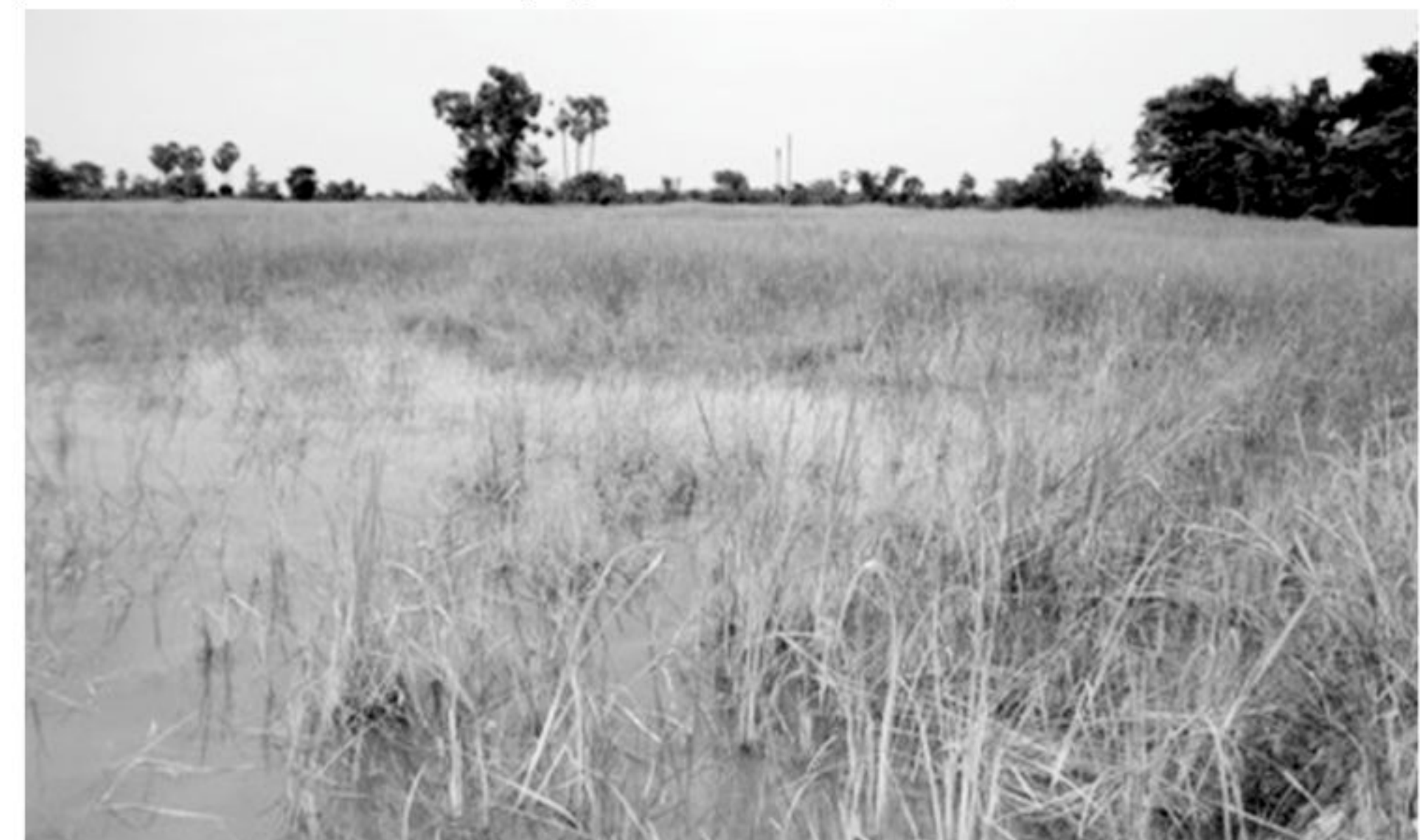
Salinity tolerant crop variety is the answer

The writer, a former Professor at Bangladesh Agricultural University, is a Senior Agriculture Specialist, Bangladesh Centre for Advanced Studies (BCAS), Dhaka. E-mail: sahaque2010@yahoo.com