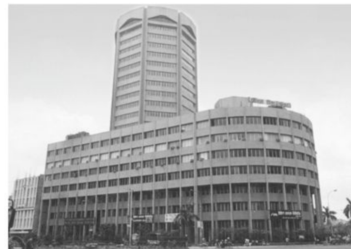
Arcaded street: One rare example in Dhaka and an example from Italy