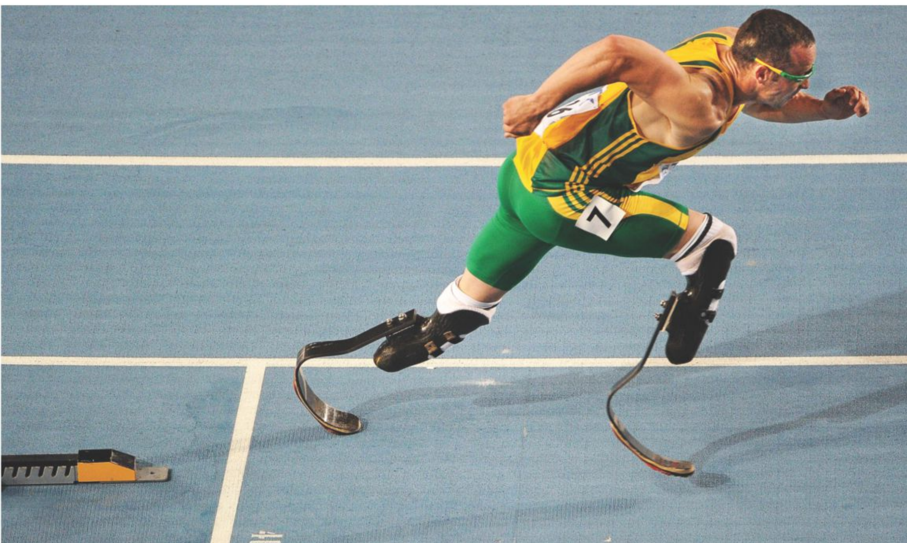
Oscar Pistorius will become the first double amputee to compete at the Olympic Games after being included yesterday in the South African 4x400-metre relay team for London Games.