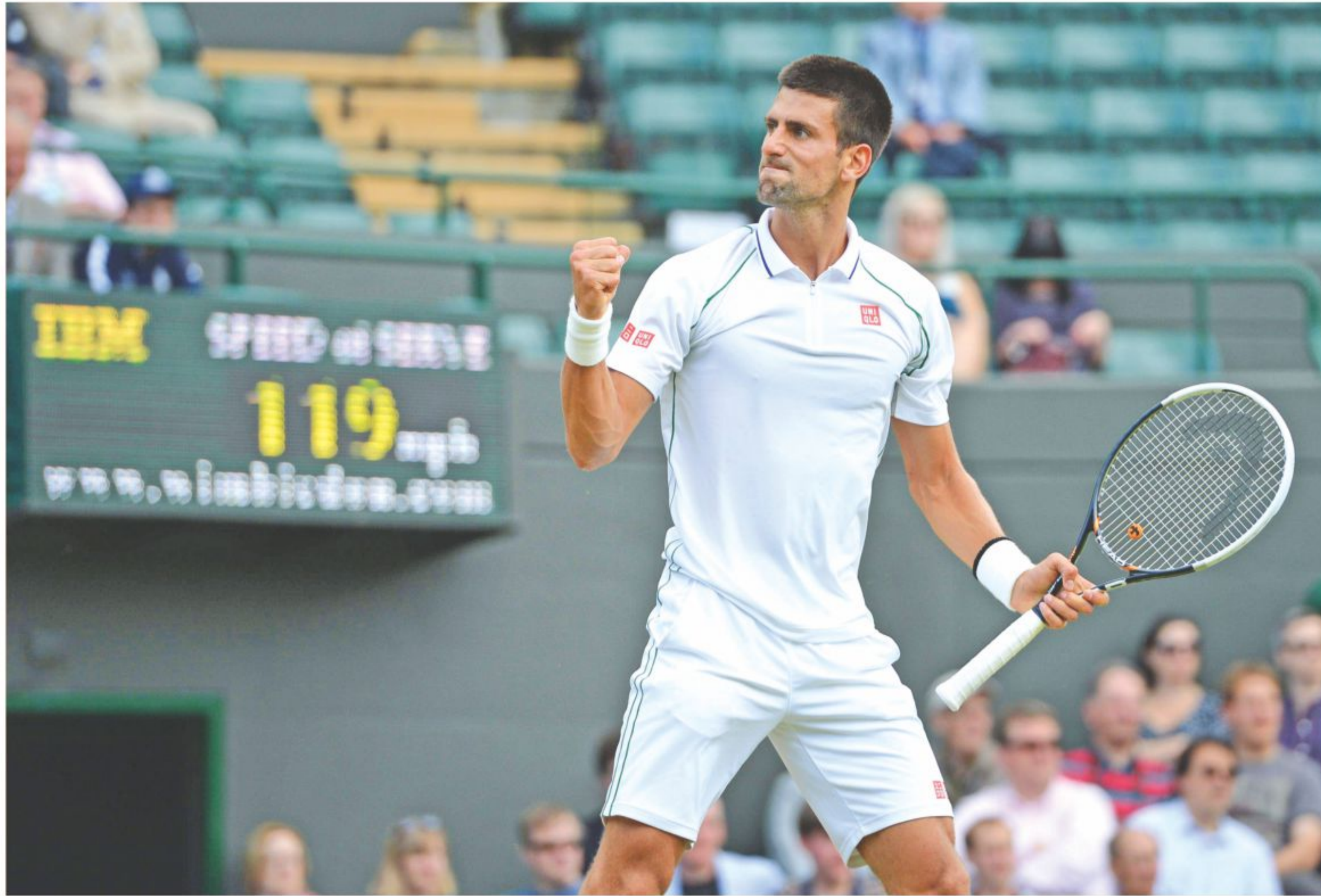
Serbia's Novak Djokovic pumps his fist after winning his Wimbledon men's singles quarterfinal against Germany's Florian Mayer at the All England Club in Wimbledon yesterday.