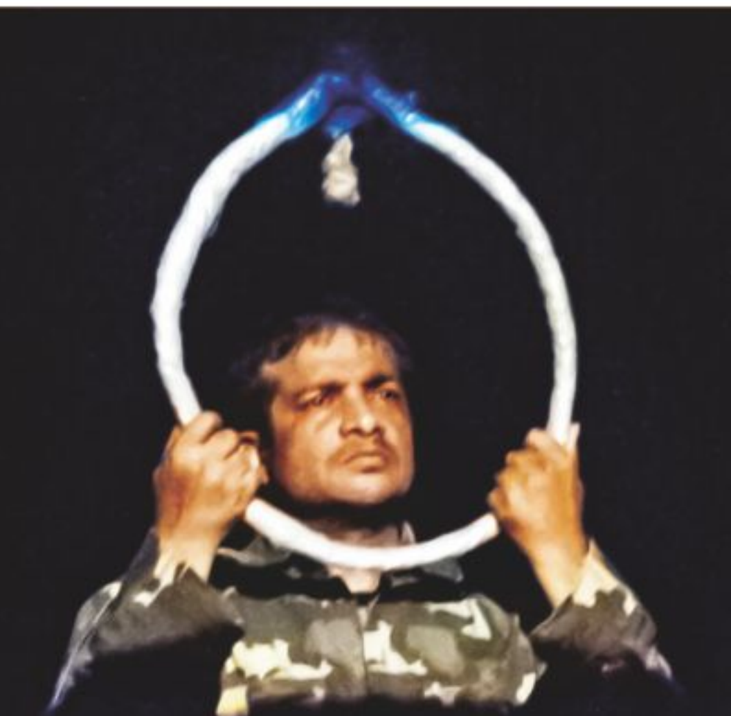
"Court Martial" depicts how a Birangana's son is oppressed and finally treated as a murderer.