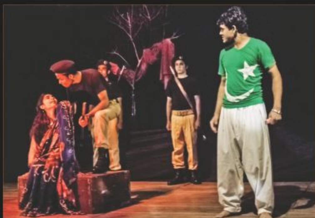
"Babur Pukurey Ganohotya" is a testament to brutality unleashed by the Pakistani Army.

organisers placed several installations at different corners of the venues. Mostly articulation of the empathic moments from the War and the aftermath of the War, the art works create a meaningful ambience with the use of lights in the evening. Bangladesh Shilpakala Academy has been organising the festival as part of its year long celebration on the 40th anniversary of independence. Today, on the fourth day, 13 plays will be staged at four venues.