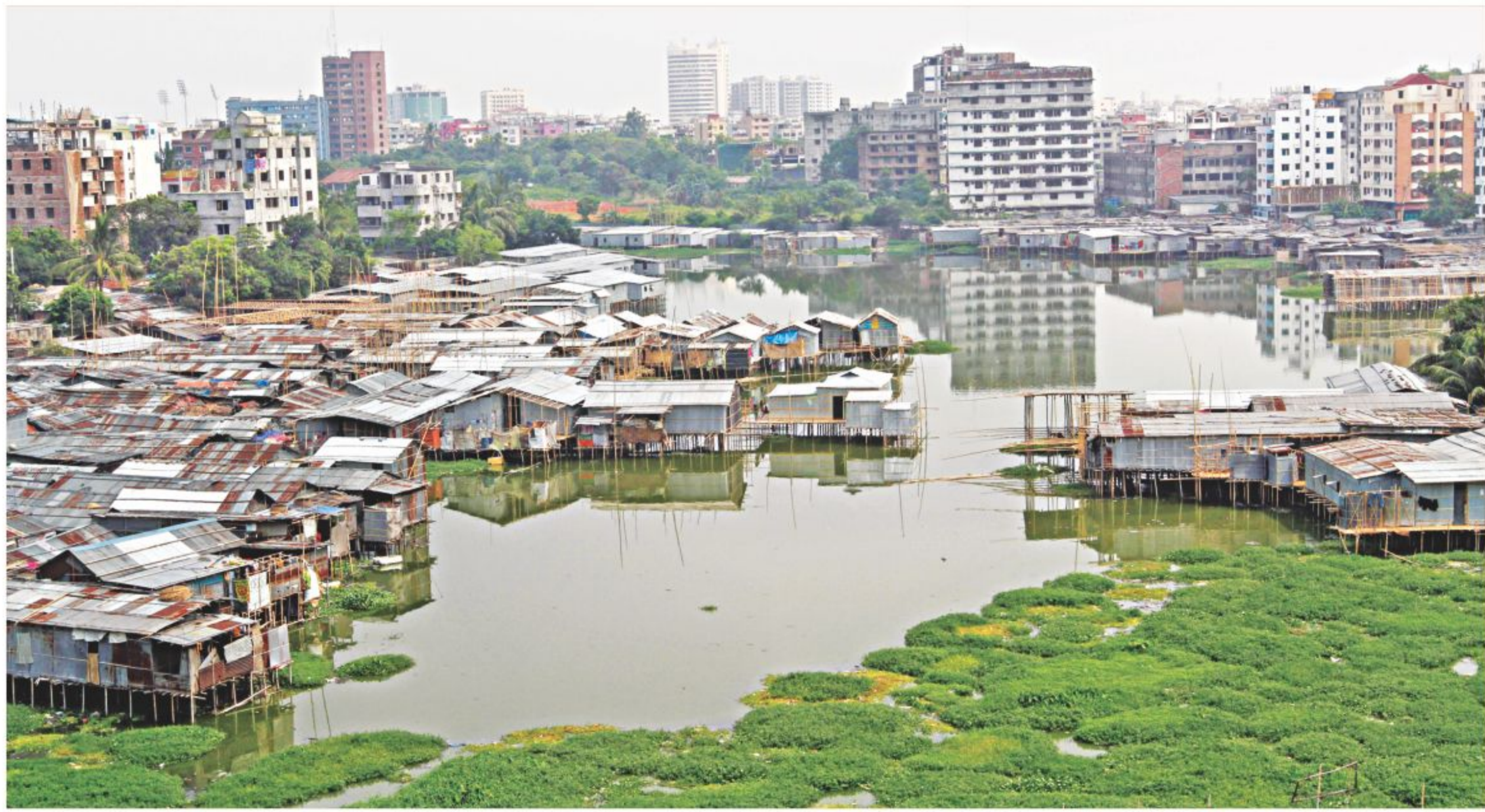
A slum is built on the lake in Rupnagar of Mirpur in the capital. Unscrupulous people are building the shanties and renting them out to poorer dwellers of Dhaka.